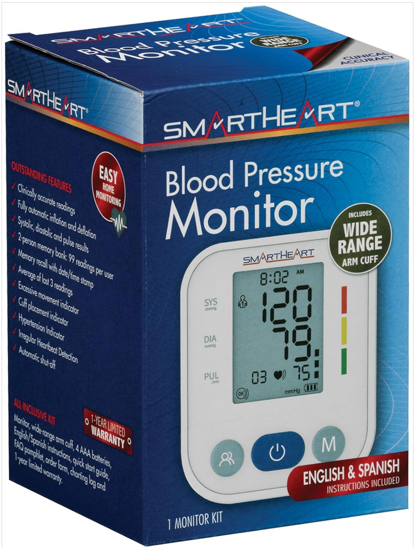
Image: The SmartHeart Blood Pressure Monitor box, detailing the included components and key features such as automatic inflation and 2-person memory.