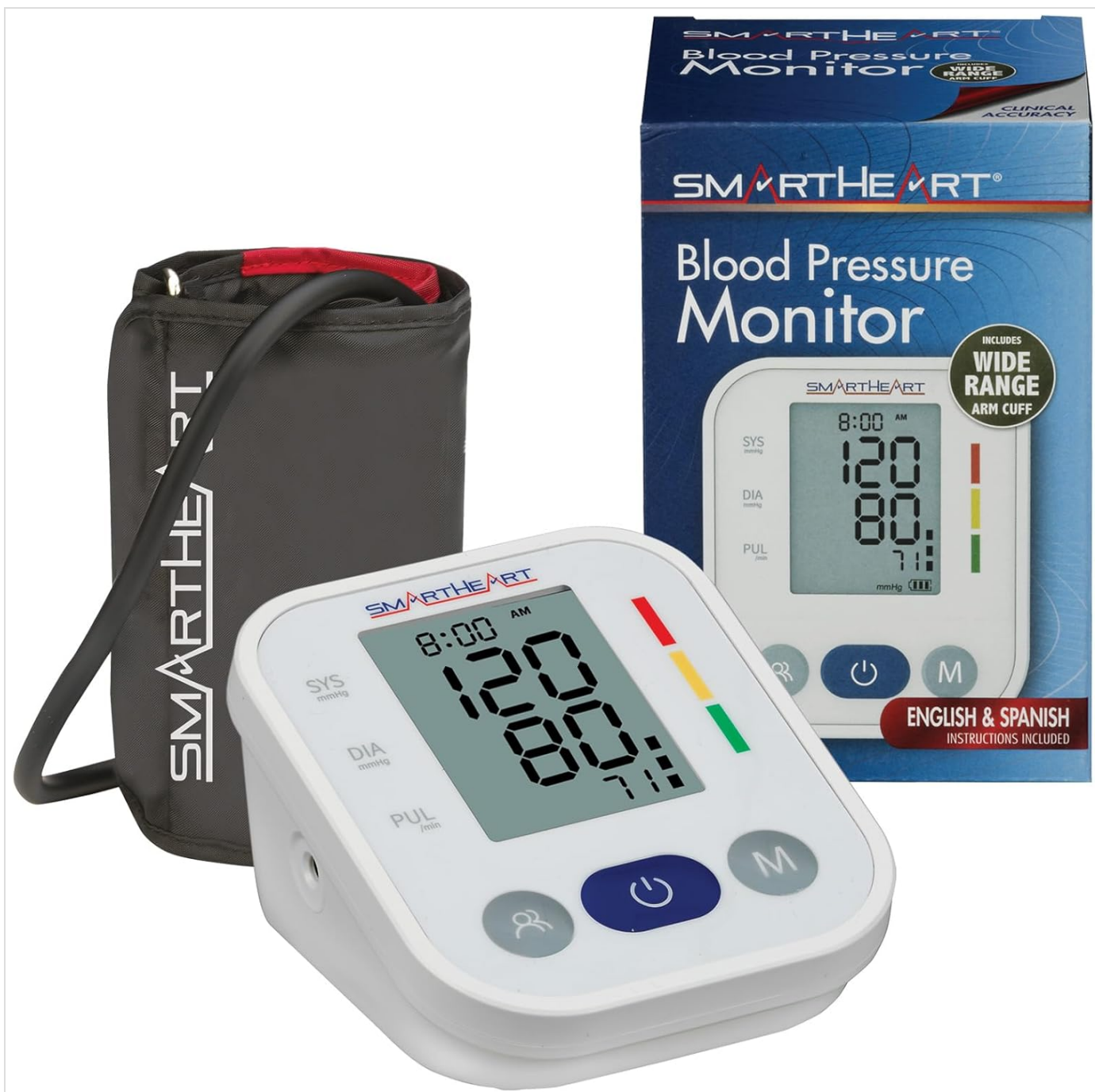
Image: SmartHeart Blood Pressure Monitor, including the main unit, wide-range arm cuff, and product packaging.