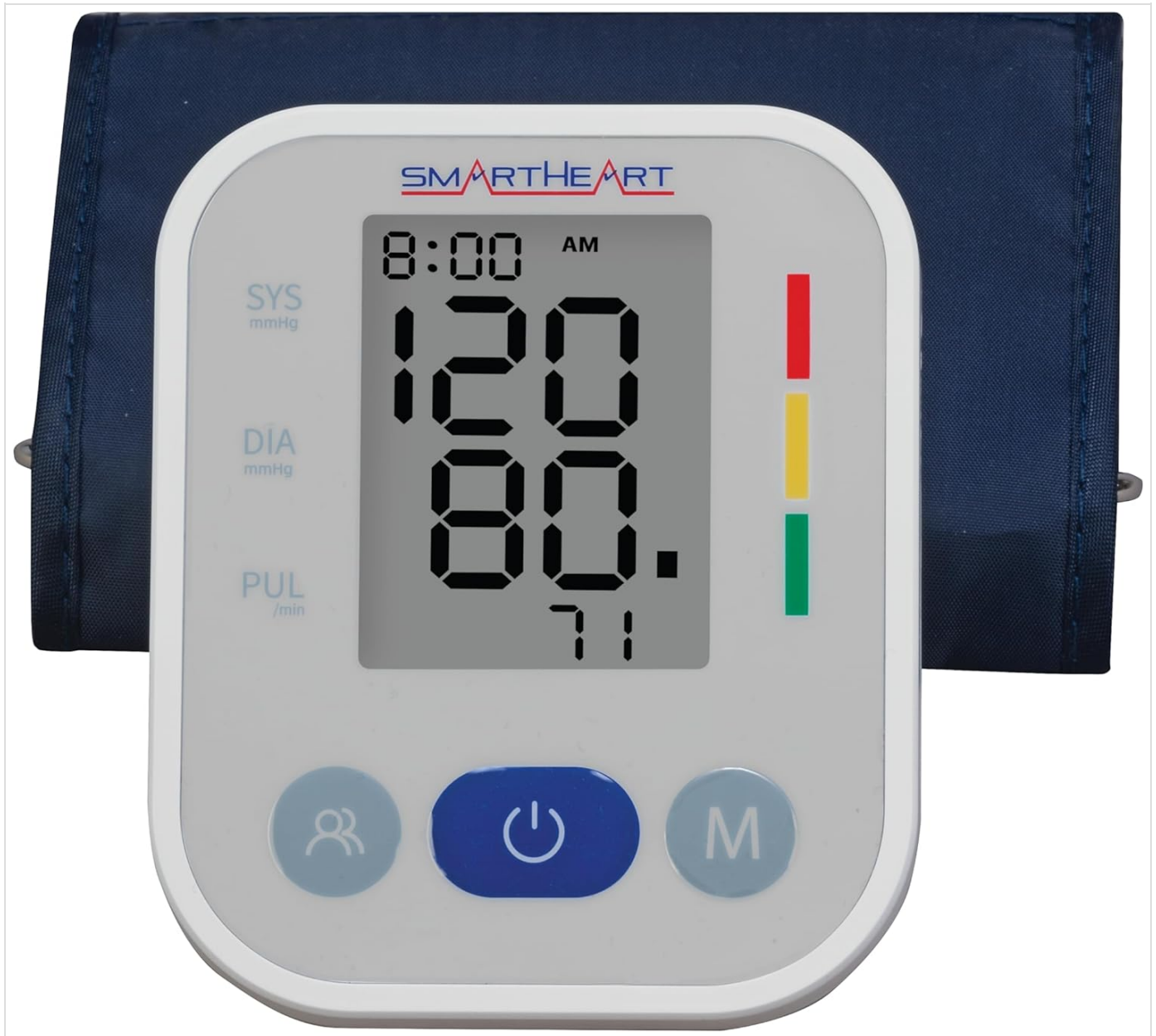
Image: A close-up view of the SmartHeart Blood Pressure Monitor's digital display and control buttons, showing the main unit.

The monitor requires 4 AAA batteries (included). Open the battery compartment on the back of the unit and insert the batteries, ensuring correct polarity (+/-). Close the compartment securely.