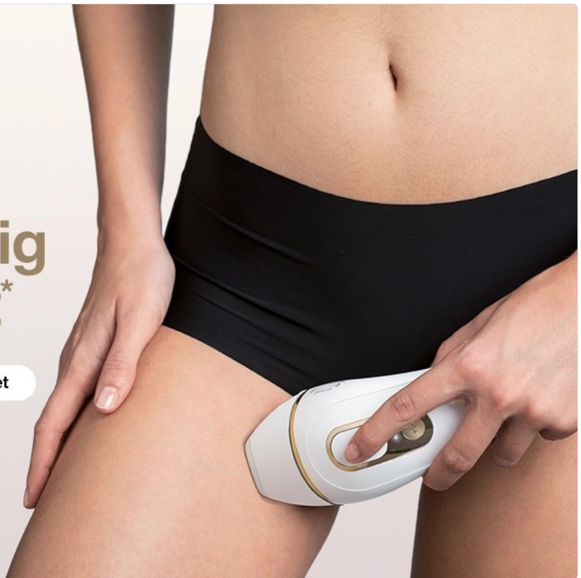
Image 1.1: The Braun Silk-expert Pro 5 in use, demonstrating smooth skin results. This device helps achieve smooth skin for up to one year when used according to the treatment plan.

*Unter Einhaltung des Behandlungsplans. Individuelle Ergebnisse können variieren