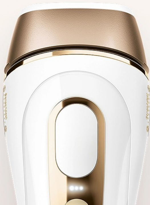
Image 1.2: Visible results can be achieved in as little as three weeks with consistent use of the Braun Silk-expert Pro 5.

Lichtimpulse alle 0,5 Sekunden für ein müheloses Gleiten und eine gründliche Abdeckung.