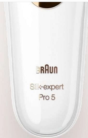
Image 1.3: The device automatically adapts its power output to match your specific skin tone, ensuring both safety and effectiveness.