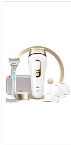
Image 4.1: The Braun Silk-expert Pro 5 is suitable for various body areas, including underarms, legs, and bikini line. Specific attachments are provided for different areas.