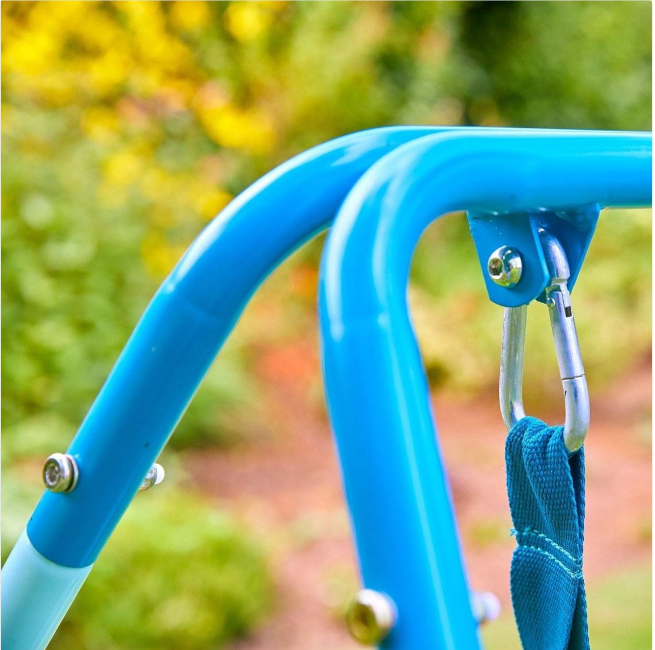
Image 4.1: Detail of a secure frame connection point, illustrating how sections are joined.