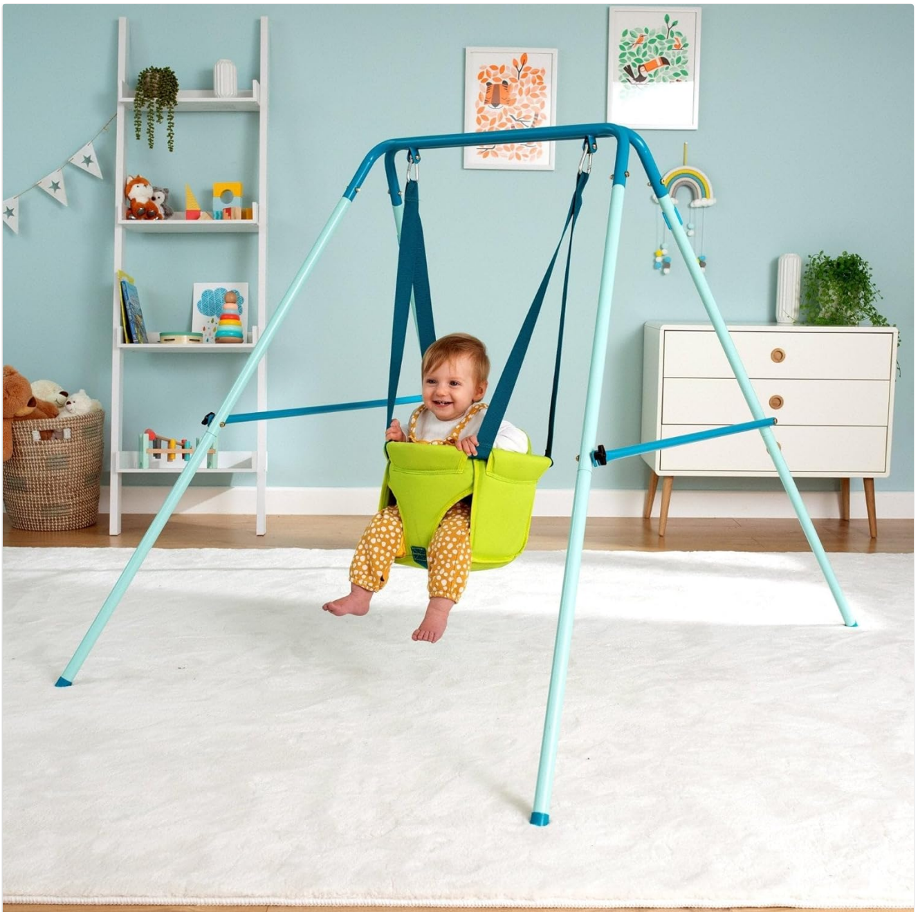
Image 5.1: The baby swing set up for indoor use on a carpeted surface.