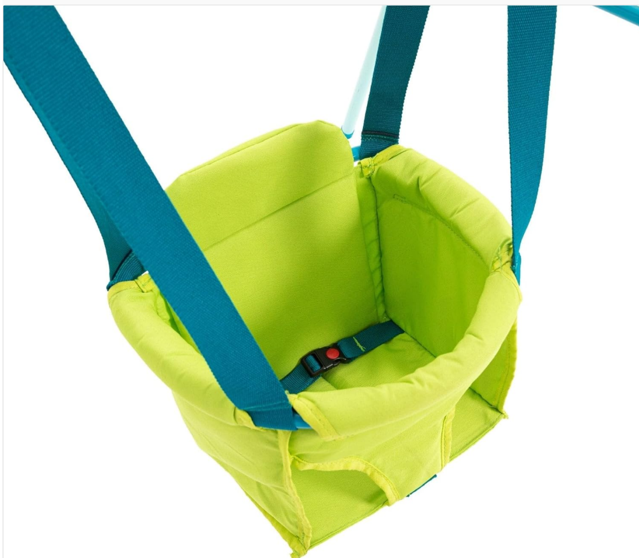
Image 3.1: Detail of the comfortable baby swing seat with its integrated safety harness.