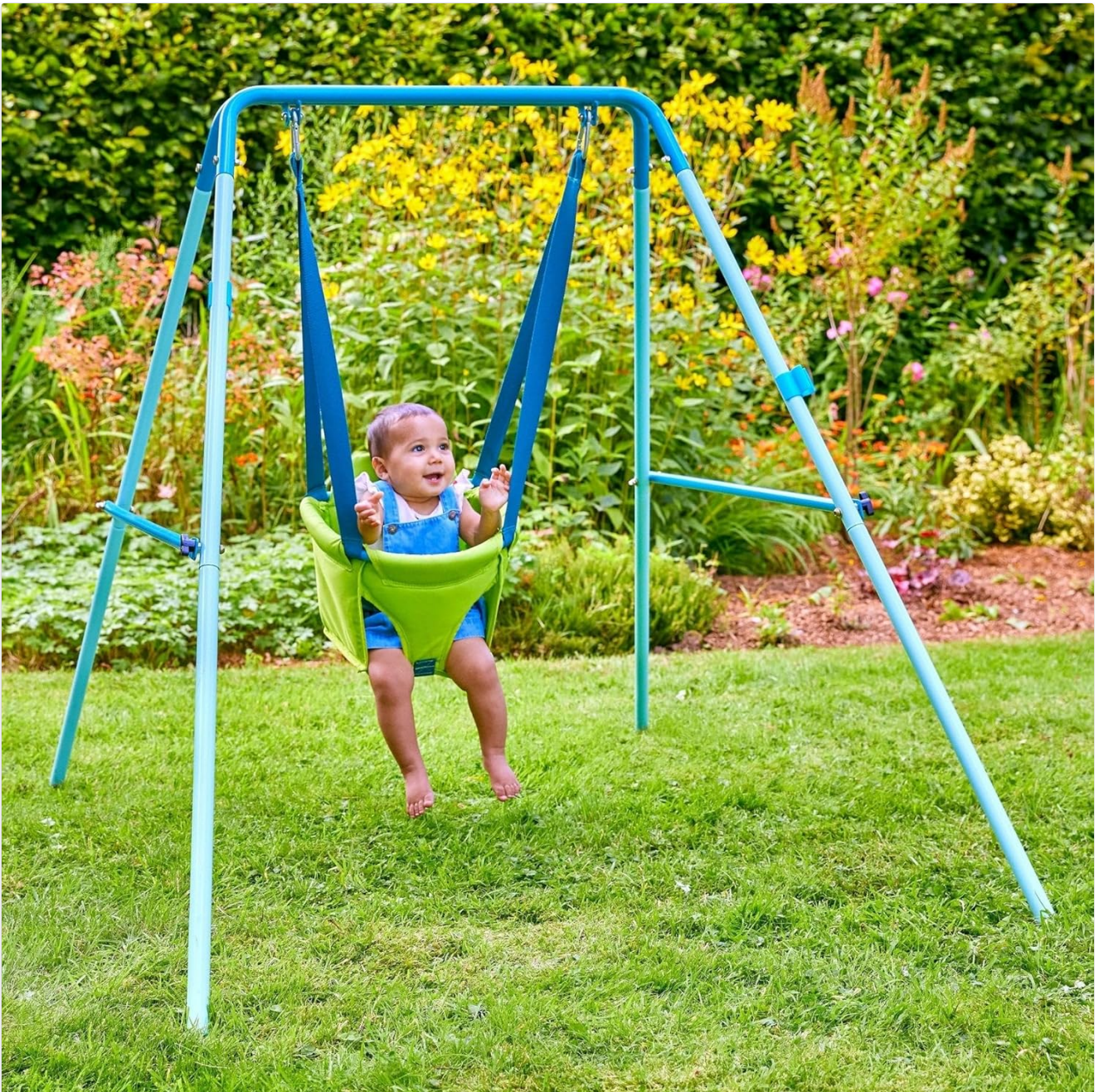
Image 5.2: The baby swing set up for outdoor use in a garden environment.