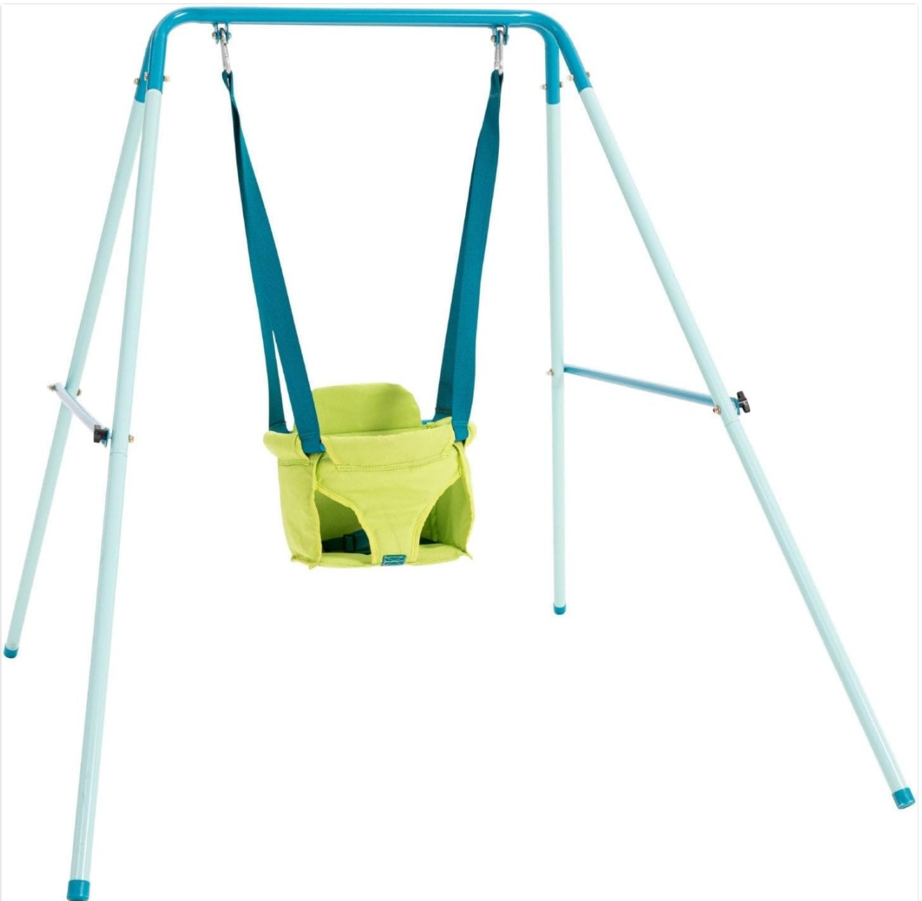
Image 1.1: The TP Toys Foldaway Baby Swing, Model 526, in its assembled state.