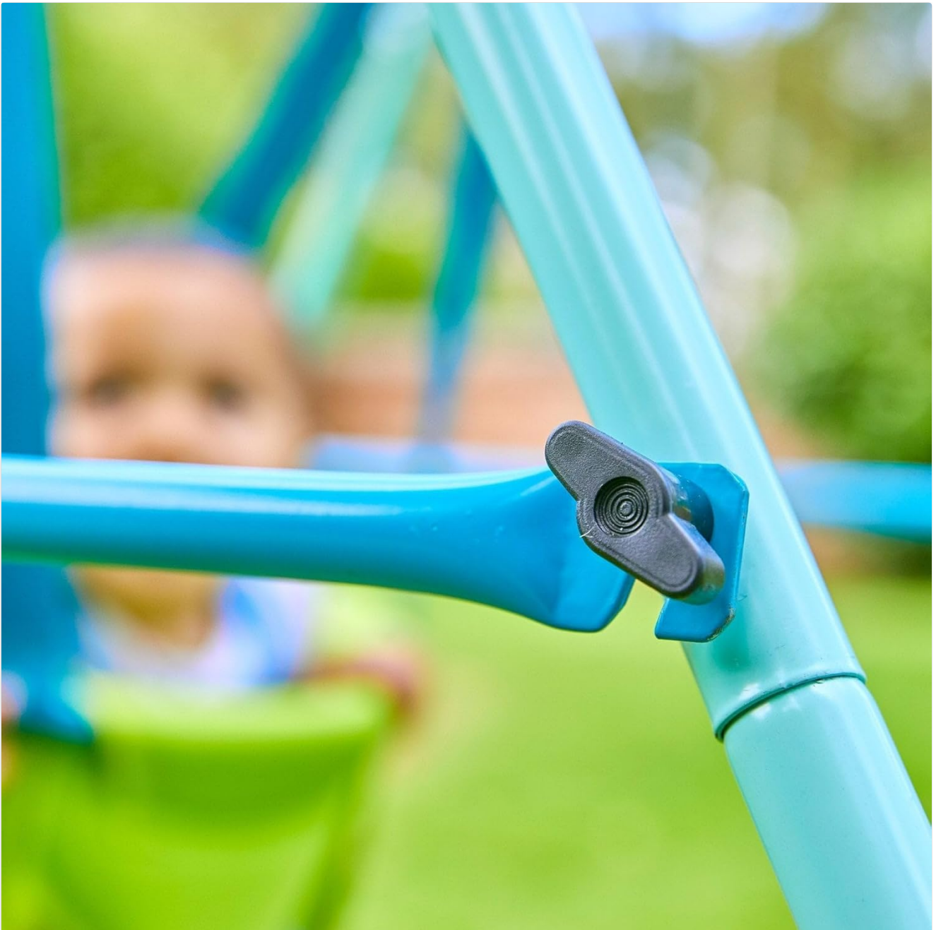
Image 4.2: The folding mechanism knob, used to secure or release the frame for folding.