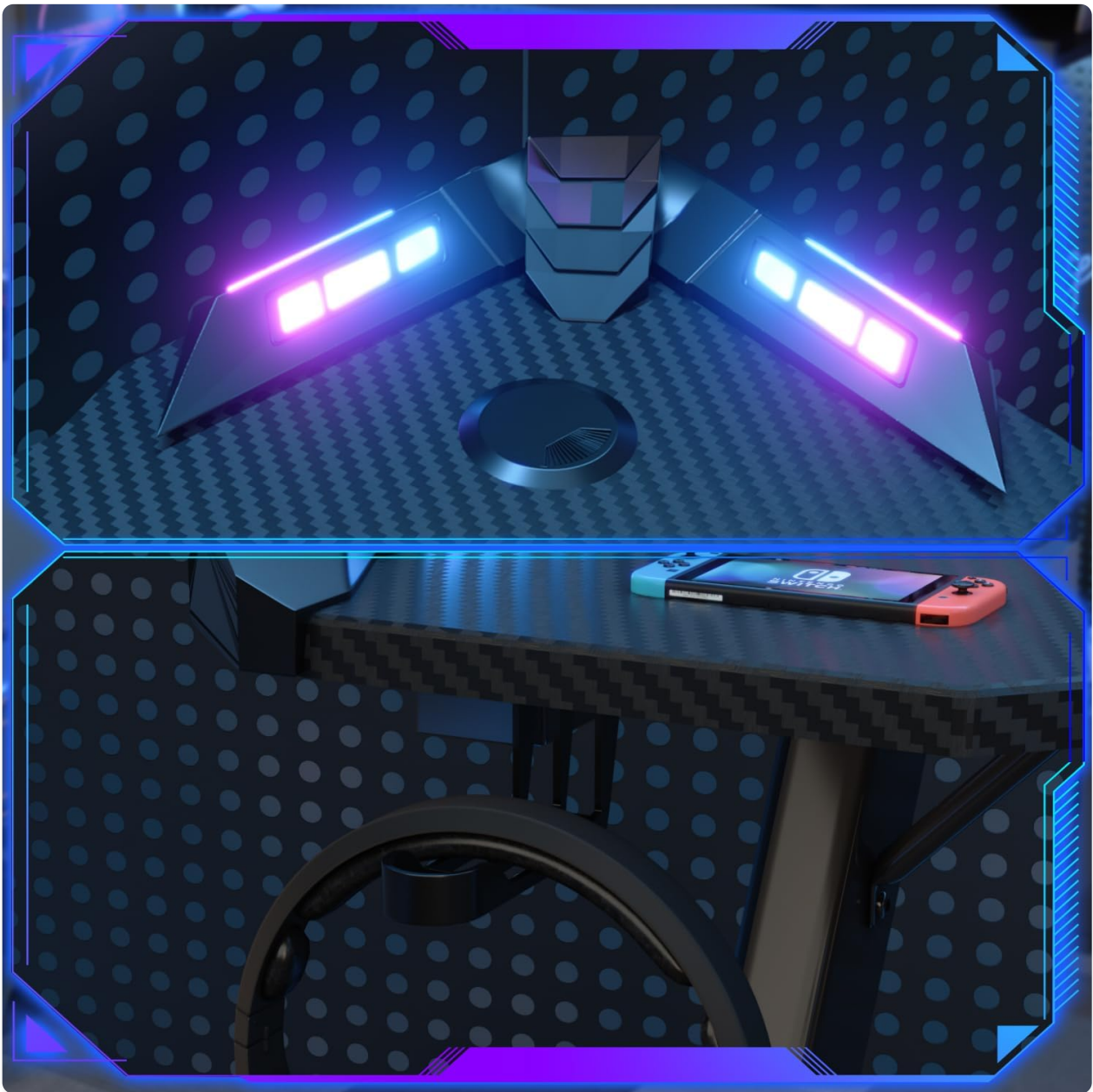
Image: A detailed view highlighting the key features of the Devoko Gaming Desk, including the integrated LED lights, the convenient cup holder, and the practical headphone hook, all designed for an optimized gaming setup.