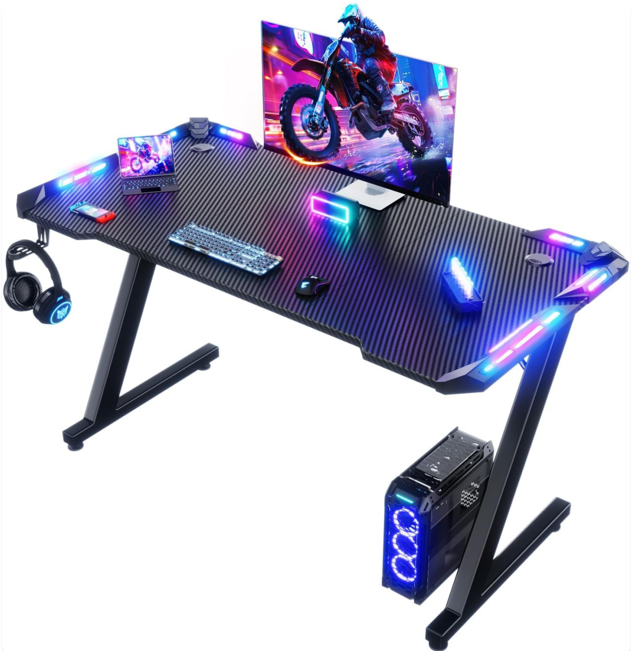
Image: The Devoko Gaming Desk, showcasing its LED lighting, carbon fiber texture, and included accessories like the headphone hook and cup holder. A monitor, keyboard, mouse, and gaming PC are also visible, demonstrating a typical setup.