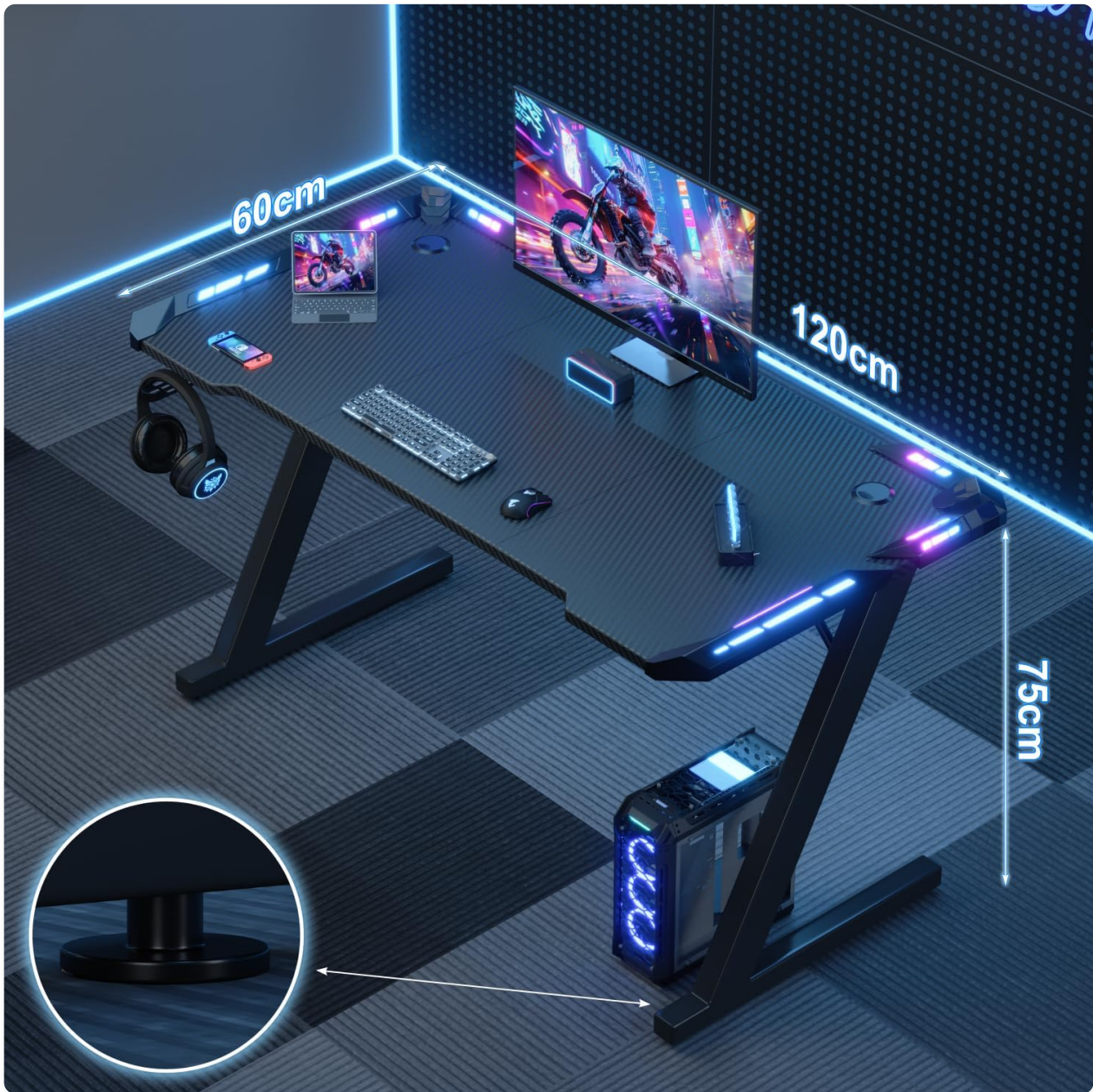
Image: A diagram illustrating the dimensions of the Devoko Gaming Desk (120cm length, 60cm width, 75cm height) and a close-up view of the adjustable, non-slip foot, highlighting the desk's stable design.