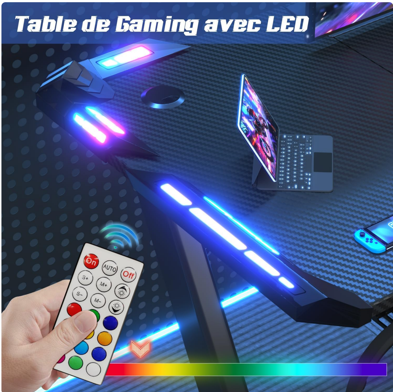
Image: A close-up view of the RGB LED lighting on the Devoko Gaming Desk and the remote control used to operate it. The remote shows buttons for power, color selection, mode, brightness, and speed adjustments.