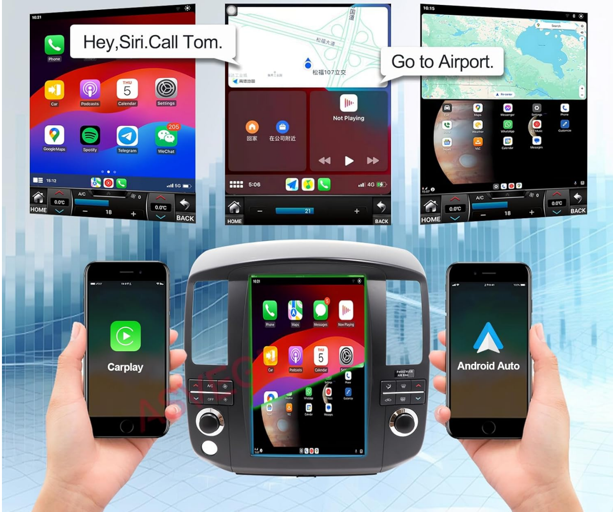
Image: The head unit showcasing both Wireless CarPlay and Android Auto interfaces, demonstrating seamless smartphone integration.

Your browser does not support the video tag.