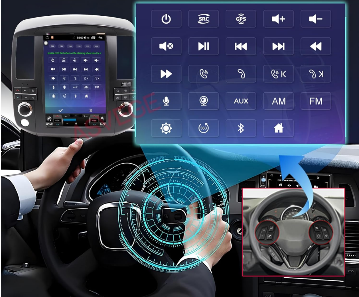
Image: Interface for customizing steering wheel controls, showing various functions that can be assigned to your vehicle's buttons.