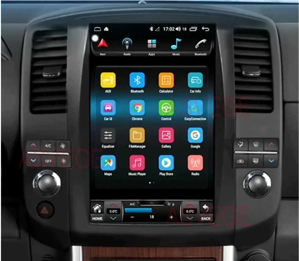
Image: The main application screen of the head unit, showing various apps for multimedia, navigation, and settings.

The main screen provides quick access to essential functions like Navigation, Music, and Radio. Swipe left or right to access additional applications.