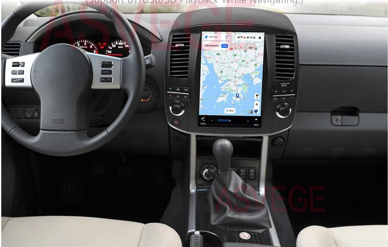
Image: The head unit displaying GPS navigation, highlighting support for 3D maps and downloadable map software.

Support Both Online And Off-Line Navi App,Support 3D Maps And Vioce Guidance, Your Long Journey Will No Loger Be Bothered By The Nightmare of Getting Lost. (Support BT/USB/SD Playback While Navigating.)