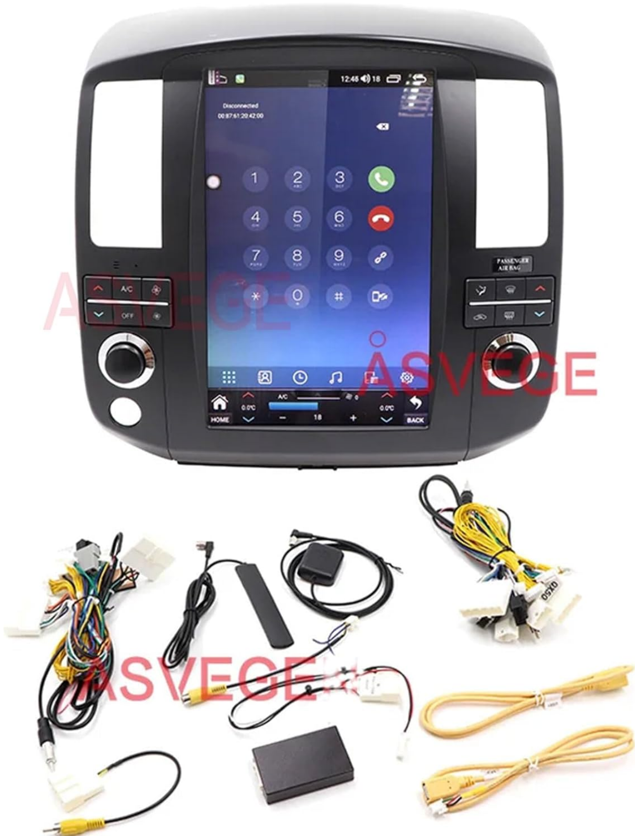
Image: The ASVEGE 12.1 inch Android Car Radio head unit shown with all included cables and accessories, such as the power harness, USB cables, and GPS antenna.