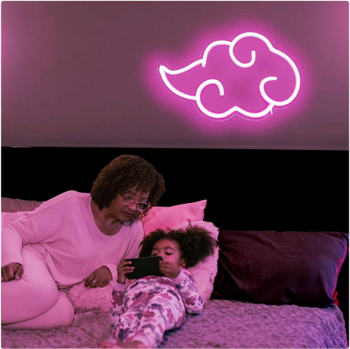
Image 10.3: The neon sign providing soft ambient lighting in a bedroom setting.