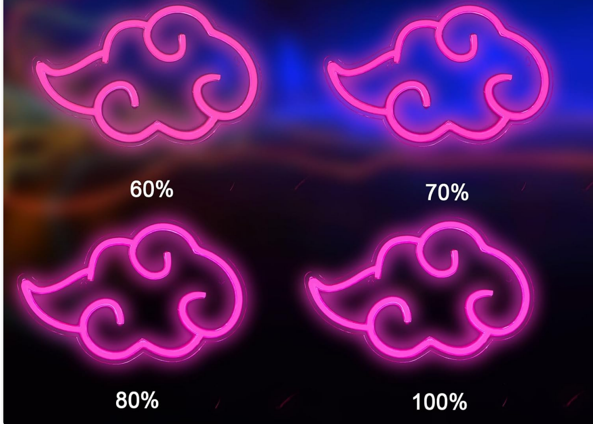
Image 2.1: Detail of the sign's qualified acrylic backboard and bright neon strip.