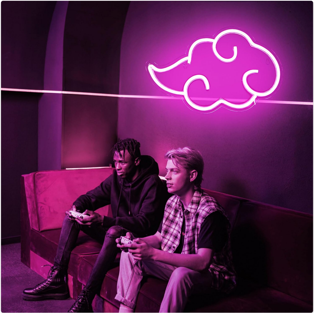
Image 10.2: The neon sign creating a relaxed atmosphere in a gaming environment.