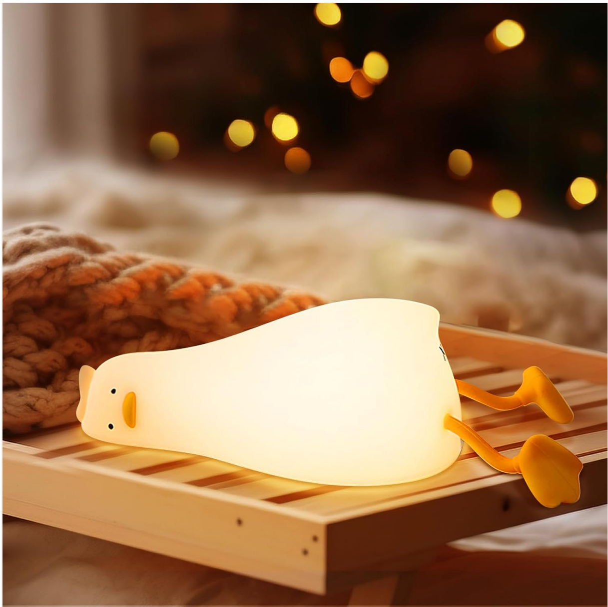
Image 1.1: The AVACOM Squishy Duck Night Light in an illuminated state.