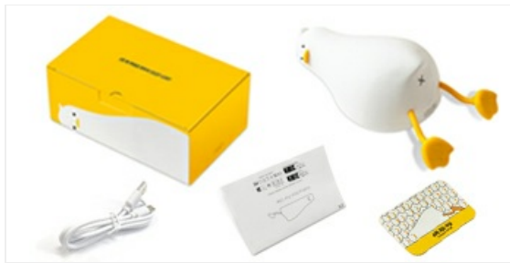
Image 2.1: Included components: night light, charging cable, and documentation.