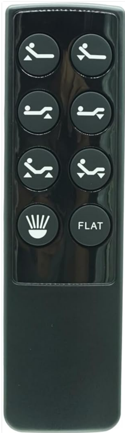
Image: Front view of the black replacement remote control, showing its eight circular buttons with bed adjustment icons and a 'FLAT' button.

The replacement remote control features an intuitive button layout for easy operation of your adjustable bed base. It is designed for comfortable grip and reliable performance.