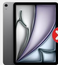
iPad Air 11 inch (M3,2025)

Image: A visual guide illustrating compatible iPad models (iPad 11th Gen A16, iPad 10th Gen 2022) and incompatible models (iPad Air 4th/5th Gen, iPad 11-inch M2/M3).