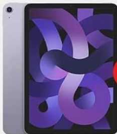
iPad Air 5th 10.9-inch 2022