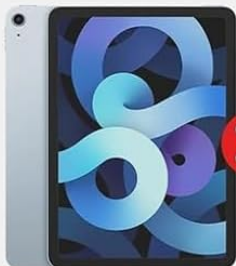
iPad Air 4th 10.9-inch 2020

NOTE: Not for iPad Air 4th/5th Gen Air 11 inch(M2,2024 & M3,2025)