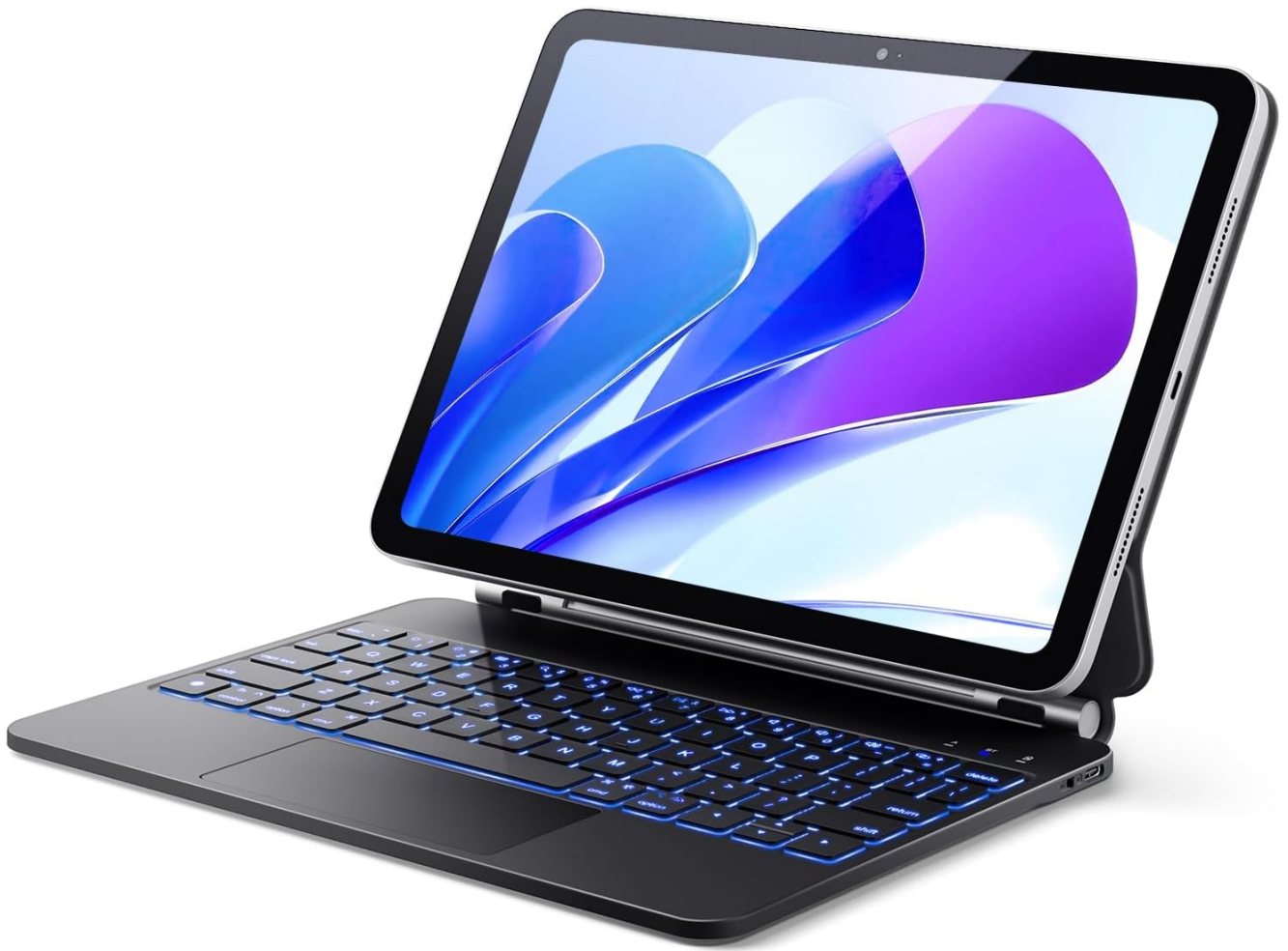
Image: GreenLaw iPad Keyboard Case with iPad attached, showcasing its sleek design and integrated keyboard.