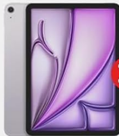
iPad Air 11 inch (M2,2024)