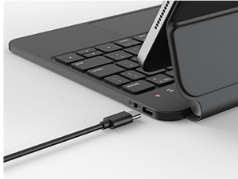
Image: An animated demonstration of the keyboard case's ability to adjust the iPad's viewing angle up to 135 degrees, providing versatile positioning for various tasks.