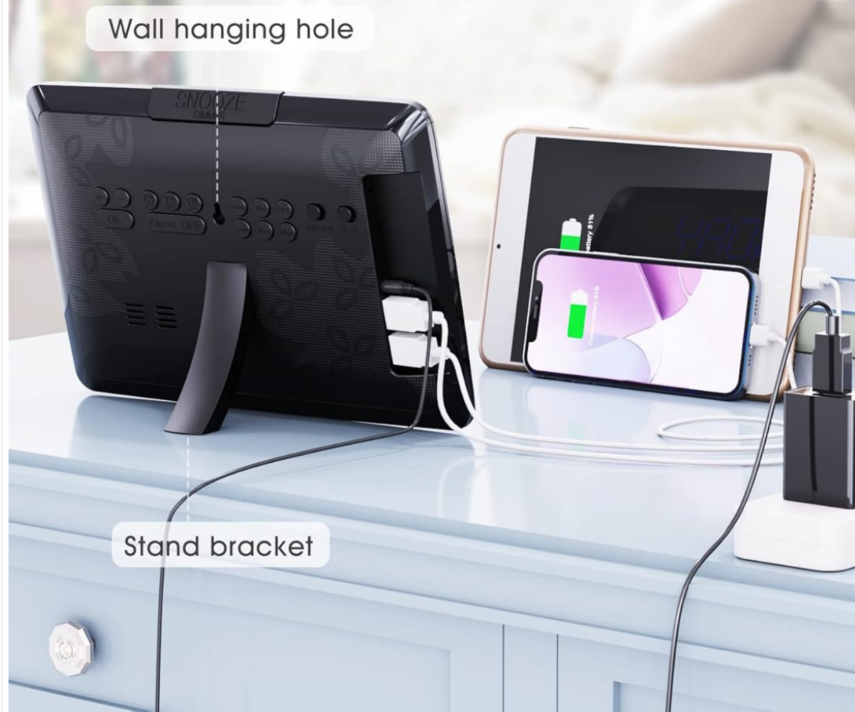
Image: Rear view of the clock illustrating both the desk stand and the wall hanging hole. Dual USB charging ports are also visible.