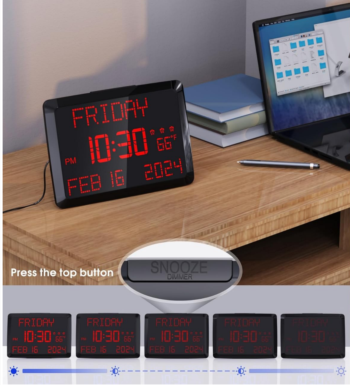
Image: The clock display at five different brightness settings, illustrating the dimmer function controlled by the top button.