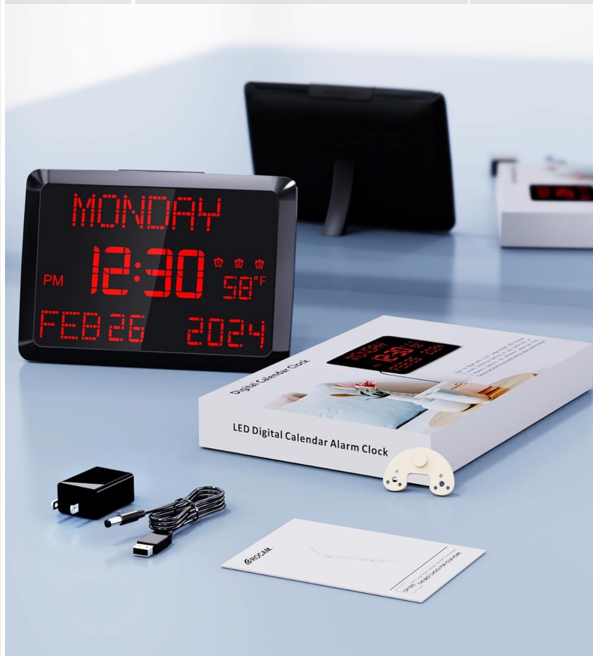
Image: The ROCAM Digital Calendar Clock and its accessories, including the power adapter, USB cable, and user manual.