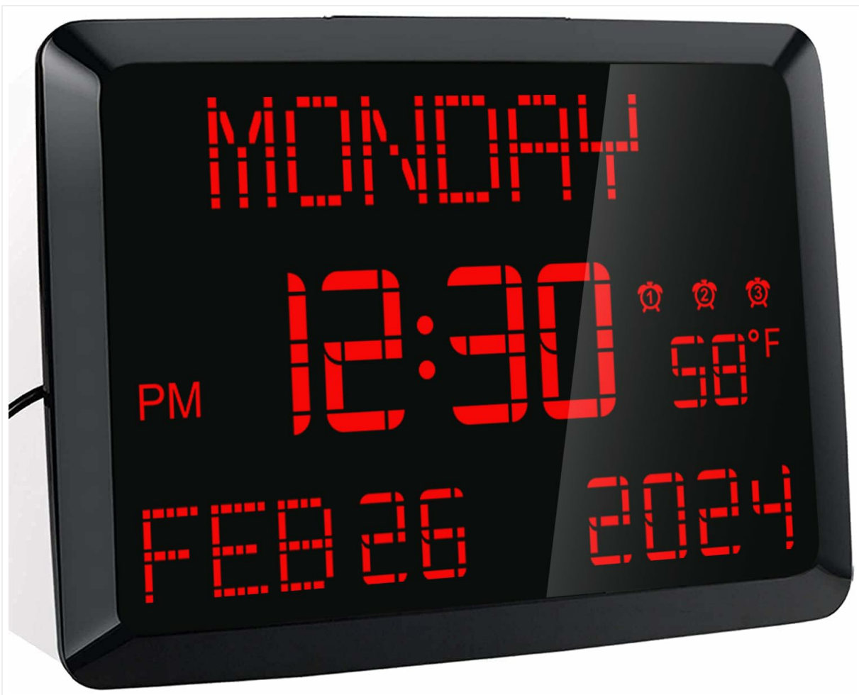
Image: Front view of the ROCAM 11.5-inch Digital Calendar Clock displaying time, date, day of the week, and temperature.