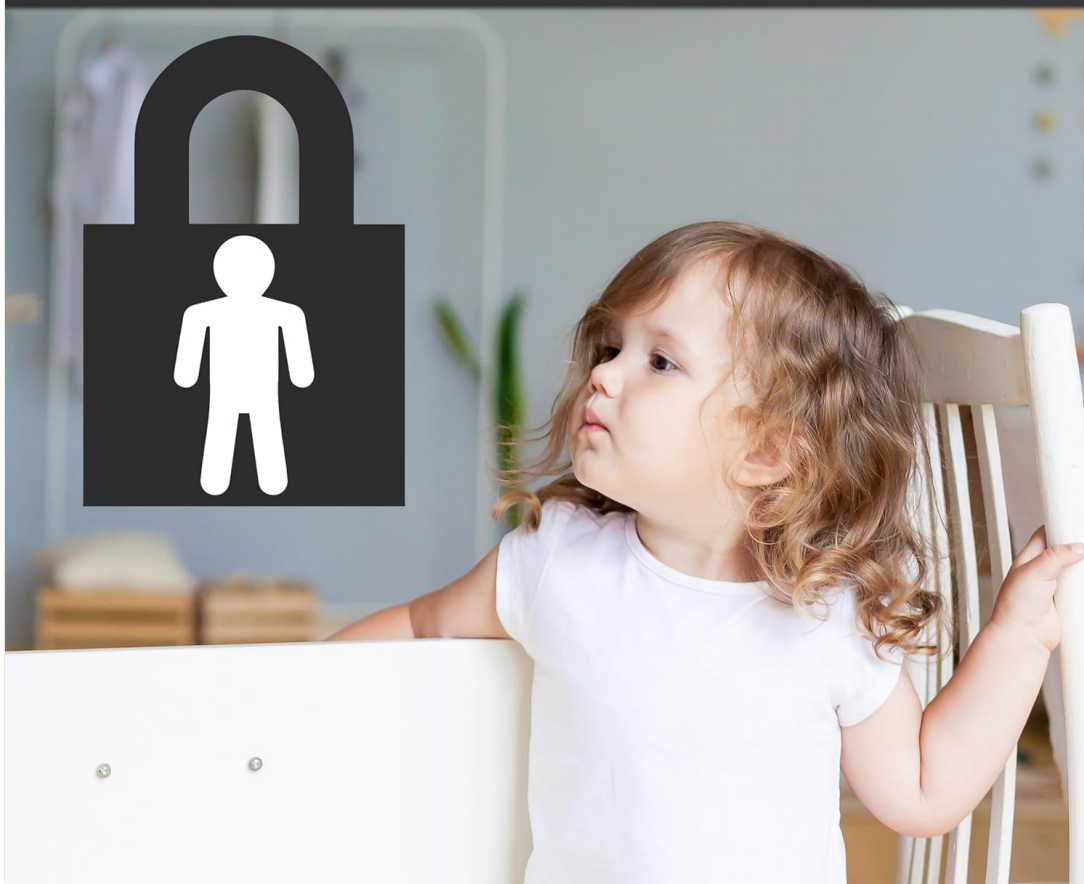
Figure 4.2: Visual representation of the Child Safety Lock feature.