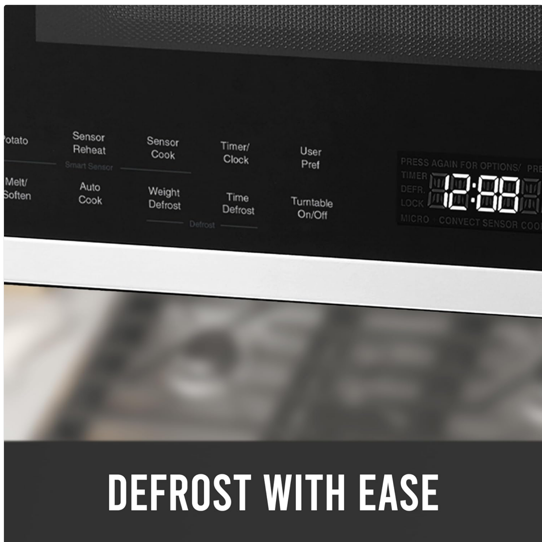
Figure 5.1: Defrosting options on the control panel for convenient food preparation.