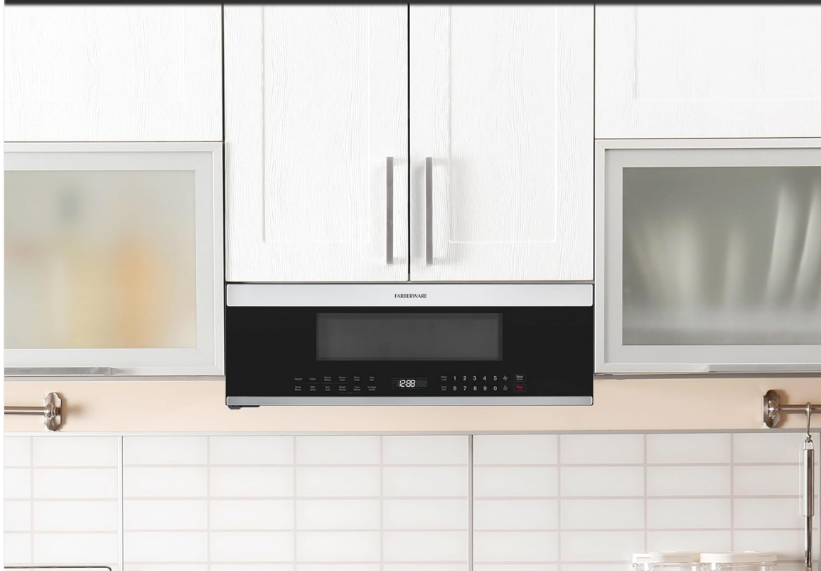
Figure 3.1: The microwave installed over a range, demonstrating its space-saving design and integration into kitchen decor.

Refer to the detailed installation template and instructions provided in the separate installation guide for precise mounting and wiring procedures.