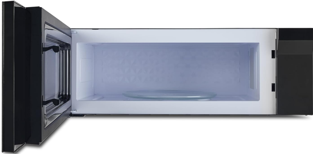
Figure 4.1: Interior of the microwave, highlighting the spacious cavity and turntable.