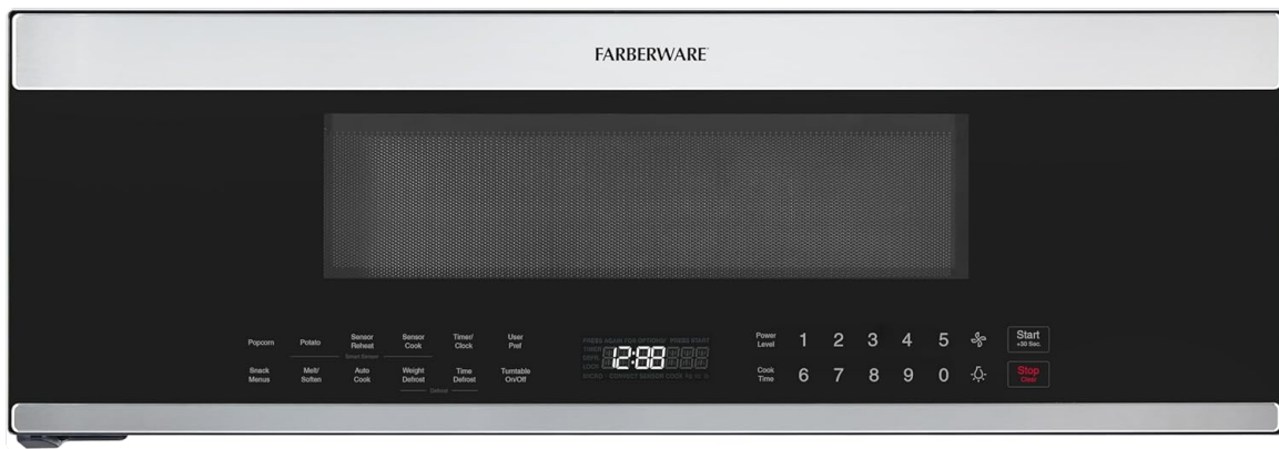
Figure 2.1: Front view of the Farberware Over-the-Range Microwave Oven, showcasing its sleek stainless steel design and control panel.