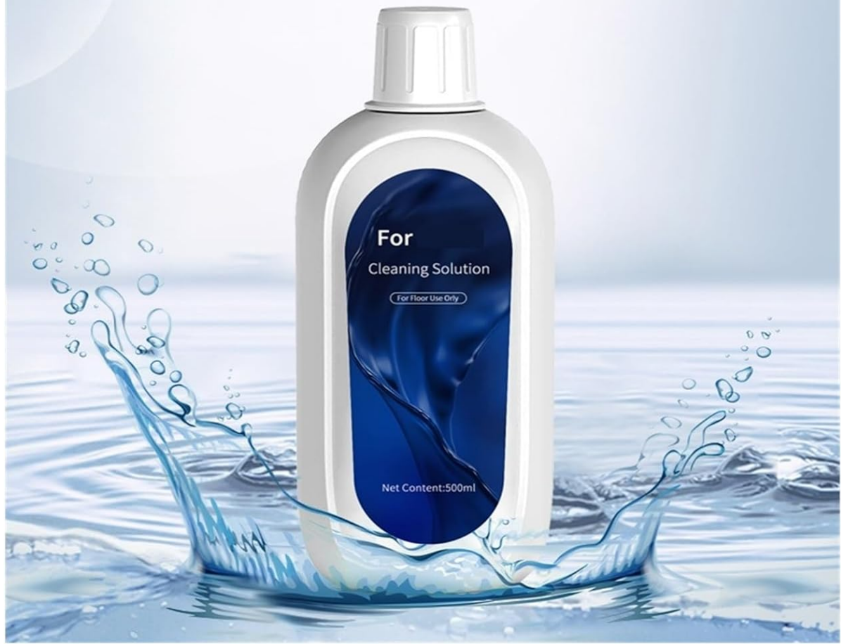
Figure 2: PonpEd Cleaning Solution bottle with water splash background, indicating compatibility with Dibeas DC22 and HC26 models.

This solution is compatible with Dibeas DC22 and HC26 vacuum robots, ensuring optimal performance when used with these devices.