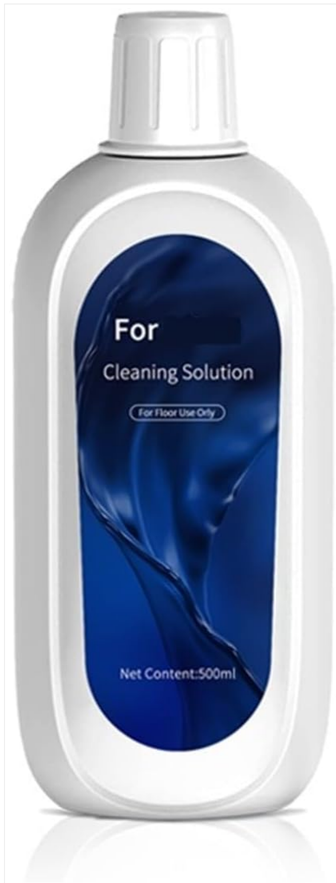
Figure 1: PonpEd 500ml Floor Cleaning Liquid Solution bottle. This image displays the white bottle with a blue label indicating "Cleaning Solution" and "Net Content: 500ml".

The PonpEd Floor Cleaning Liquid Solution is designed to provide effective cleaning for various hard floor types. Its formulation is gentle yet powerful, making it suitable for daily use.