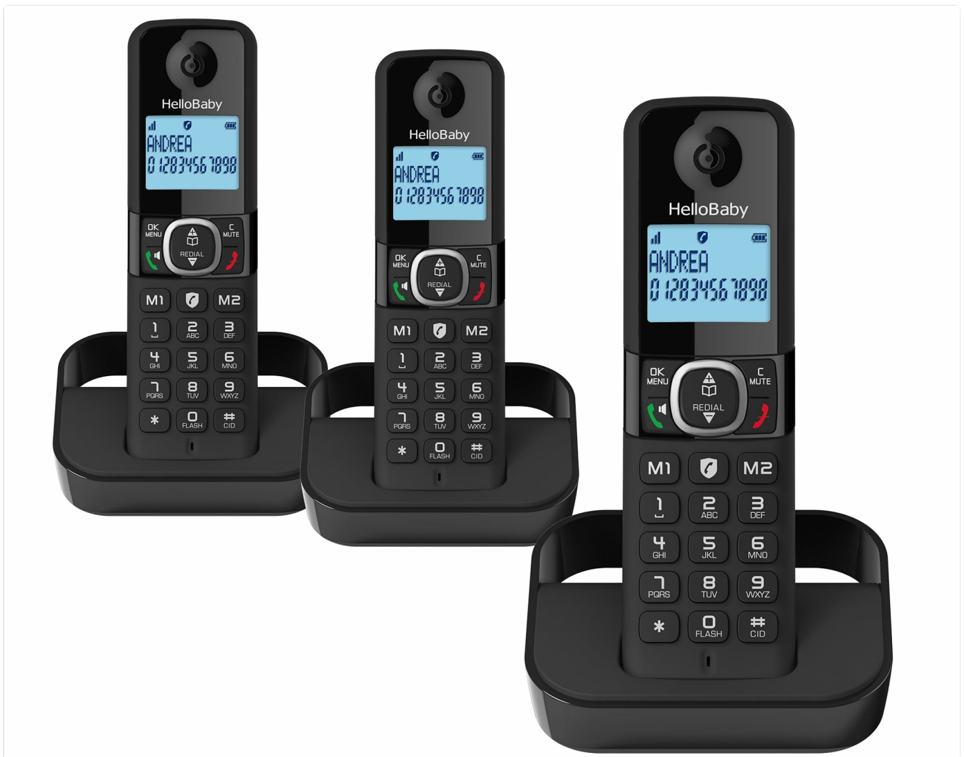
The Hellobaby HB2688-3 DECT 6.0 Digital Cordless Telephone system, featuring three handsets for extended home coverage.