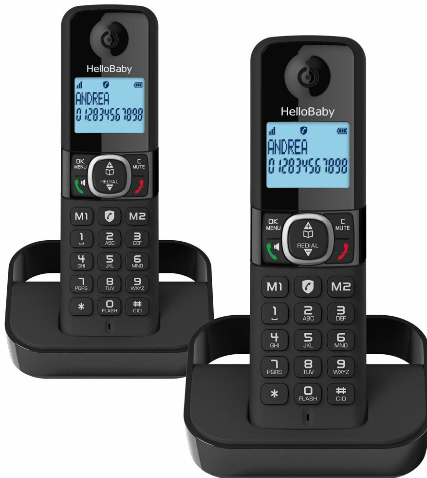
Image: Hellobaby DECT 6.0 Cordless Phone with two handsets and base units, showcasing the sleek design and backlit display.

The Hellobaby DECT 6.0 Cordless Phone system includes a base unit and one or more cordless handsets. Each handset features a blue backlit display and large, easy-to-use buttons for clear visibility and operation.