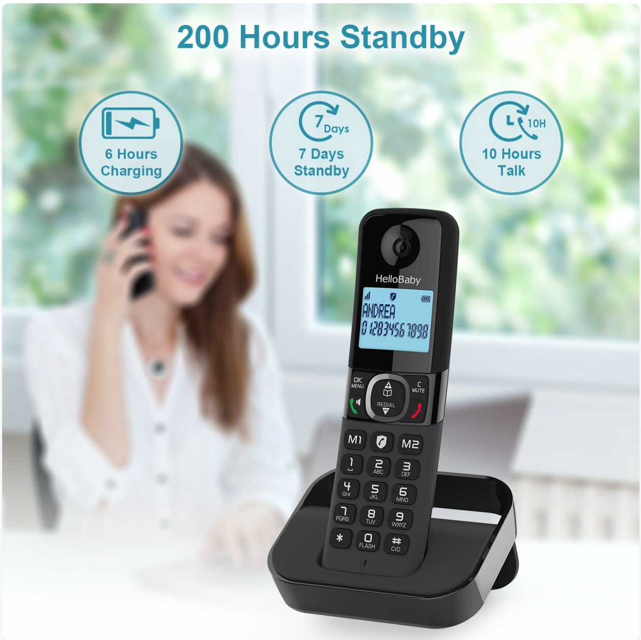
Image: A Hellobaby cordless phone on its base, illustrating its impressive battery life with icons for 6 hours charging, 7 days standby, and 10 hours talk time.