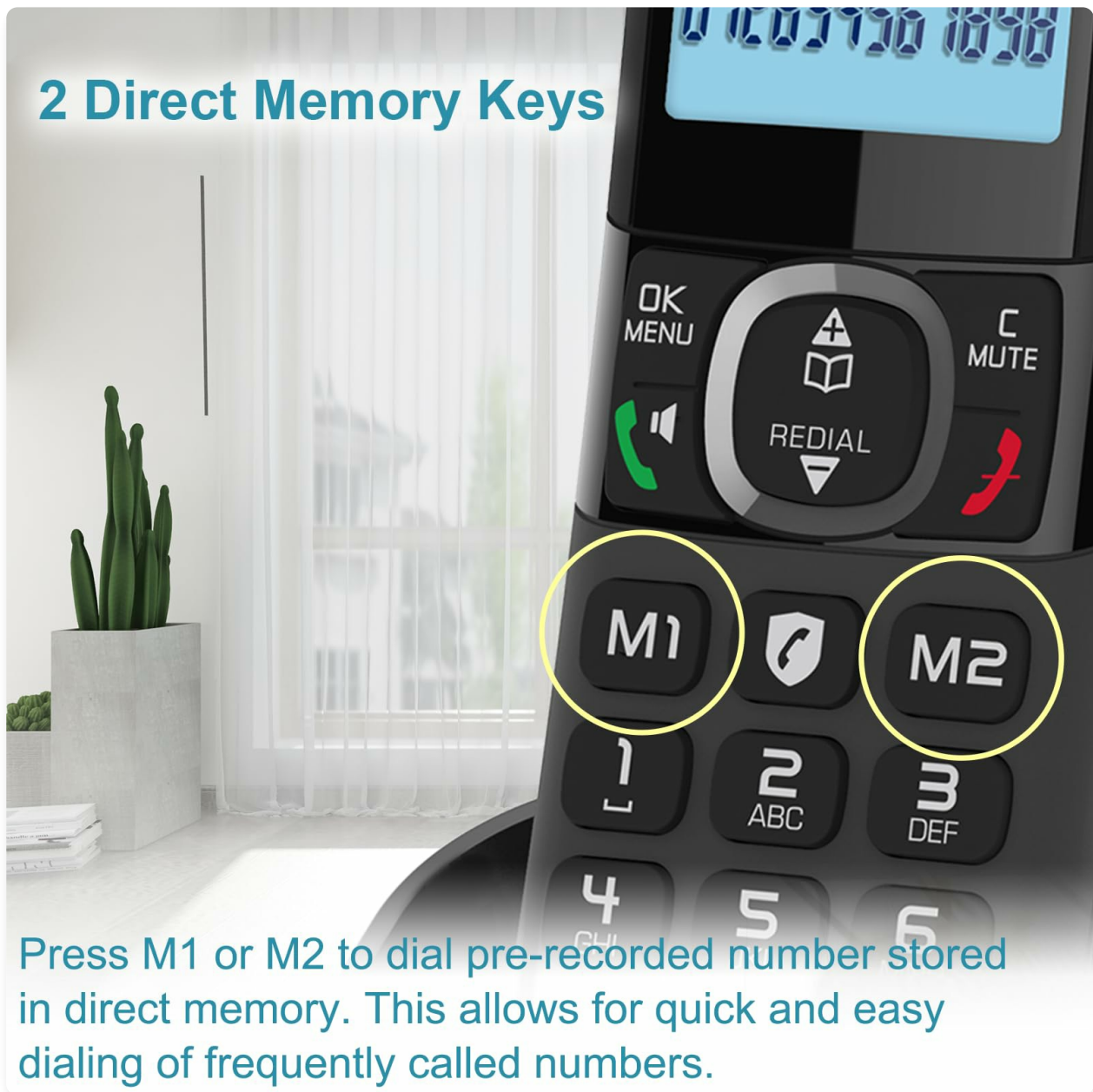
Image: A close-up of the Hellobaby cordless phone keypad, highlighting the M1 and M2 direct memory keys for quick dialing.

The phonebook can store up to 100 names and numbers. Use the navigation keys to access and manage your contacts. The handset also features two direct memory keys (M1 and M2) for quick dialing of frequently called numbers.