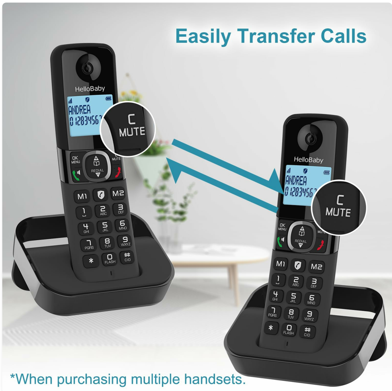
Image: Two Hellobaby cordless phones demonstrating the ability to easily transfer calls between handsets, indicated by arrows.

Communicate privately between handsets within your home. This feature allows for convenient internal communication without using the landline.