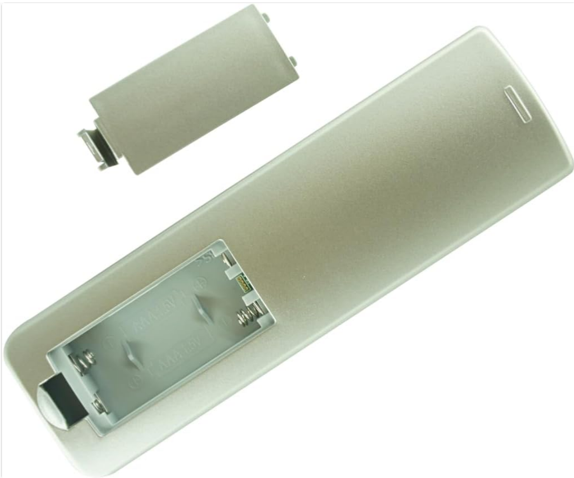
Image: Rear view of the remote control with the battery cover open, illustrating where to insert the two AAA batteries.