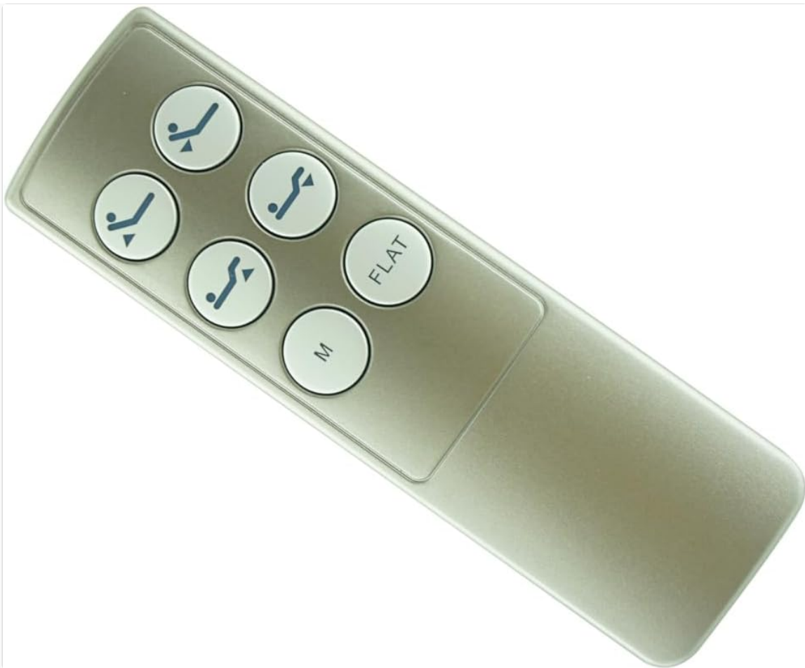
Image: A clear view of the remote control's front face, displaying all functional buttons for bed adjustment.