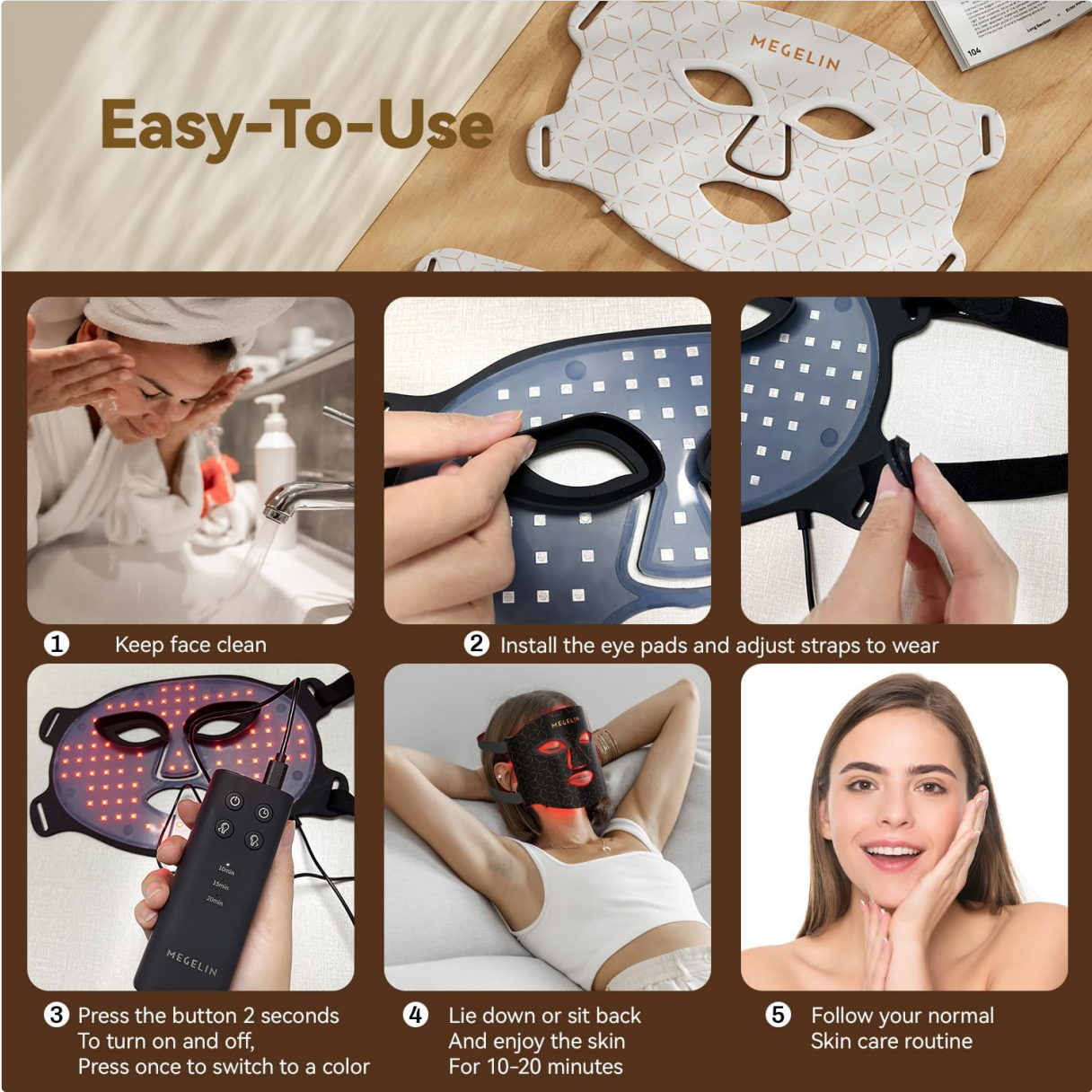
Image: A sequence of images showing the user turning on the mask, selecting settings, and relaxing during treatment.