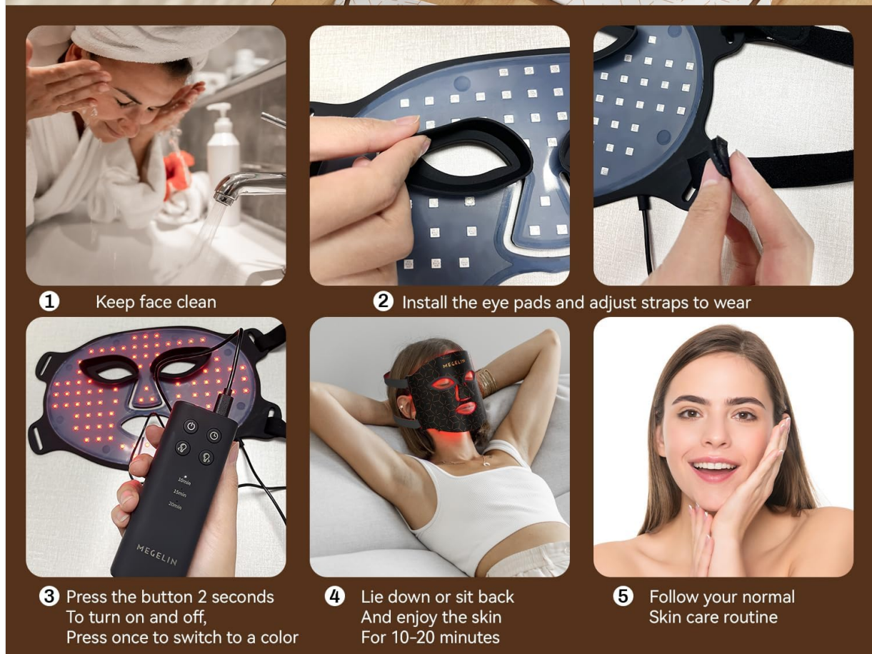
Image: A sequence of images demonstrating how to clean the face, install eye pads, and adjust the mask for wear.