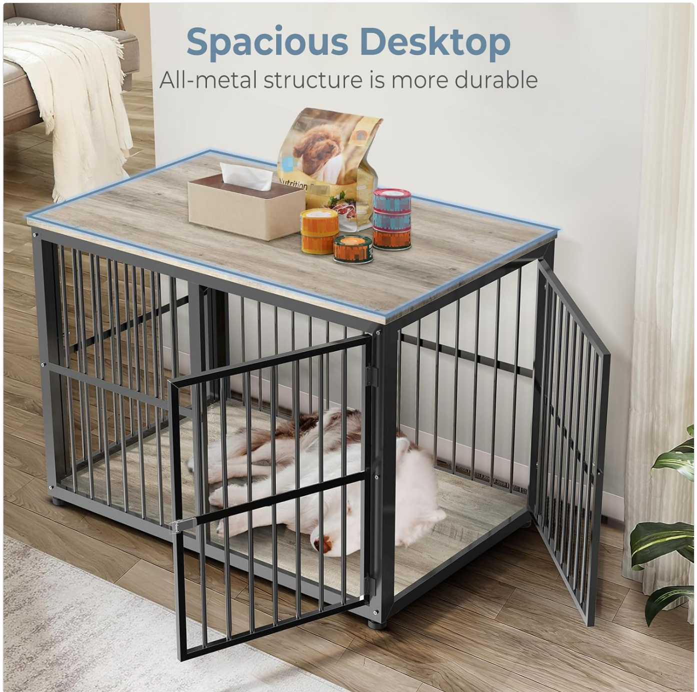
Figure 4.1: Assembled crate with open doors, demonstrating accessibility.