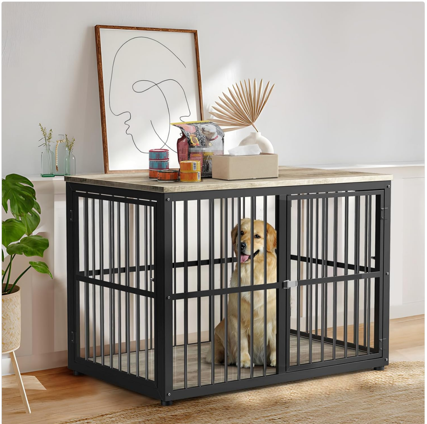
Figure 1.1: Lyromix 43-inch XL Dog Crate Furniture in use.