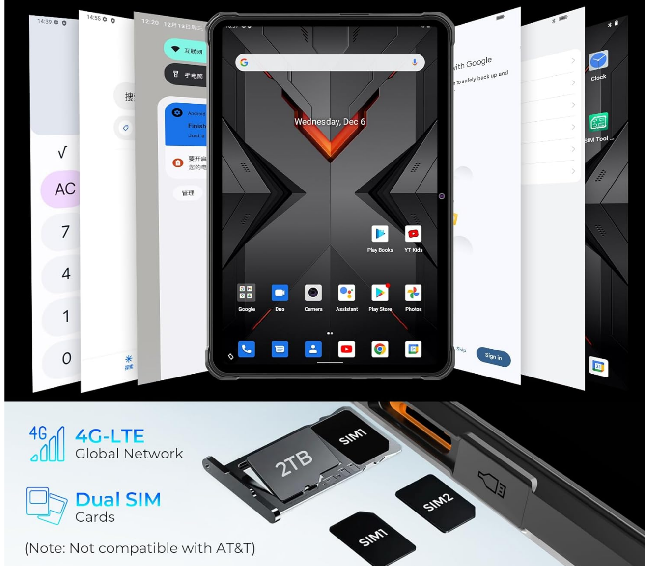
Image: Close-up of the HOTWAV R7's right spine showing the protective flap for the SIM/TF card tray. The tray is partially ejected, revealing slots for two SIM cards and one TF card. This illustrates how to access and install SIM and memory cards.