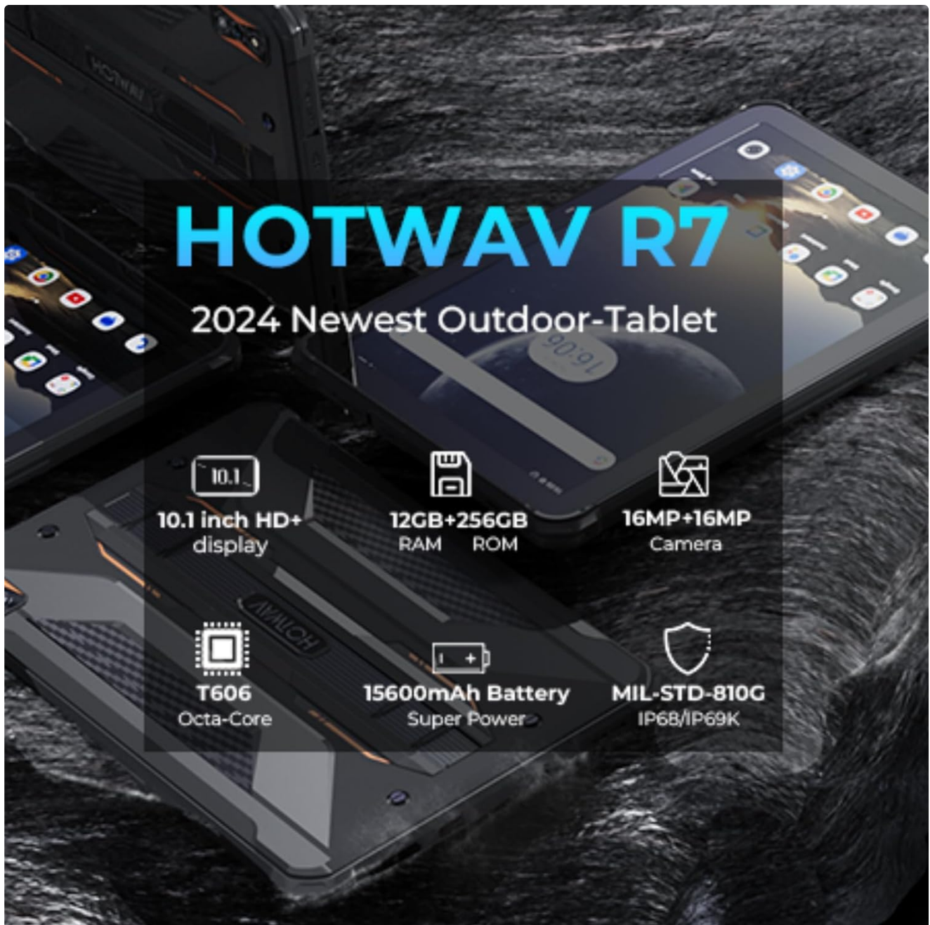
Image: Infographic illustrating the HOTWAV R7's IP68/IP69K waterproof and MIL-STD-810H drop-proof and dust-proof ratings, highlighting its durability in extreme environments.