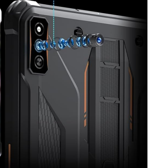
Image: The HOTWAV R7 tablet showcasing its 16MP main camera and 16MP front camera, with example photos taken by the tablet.