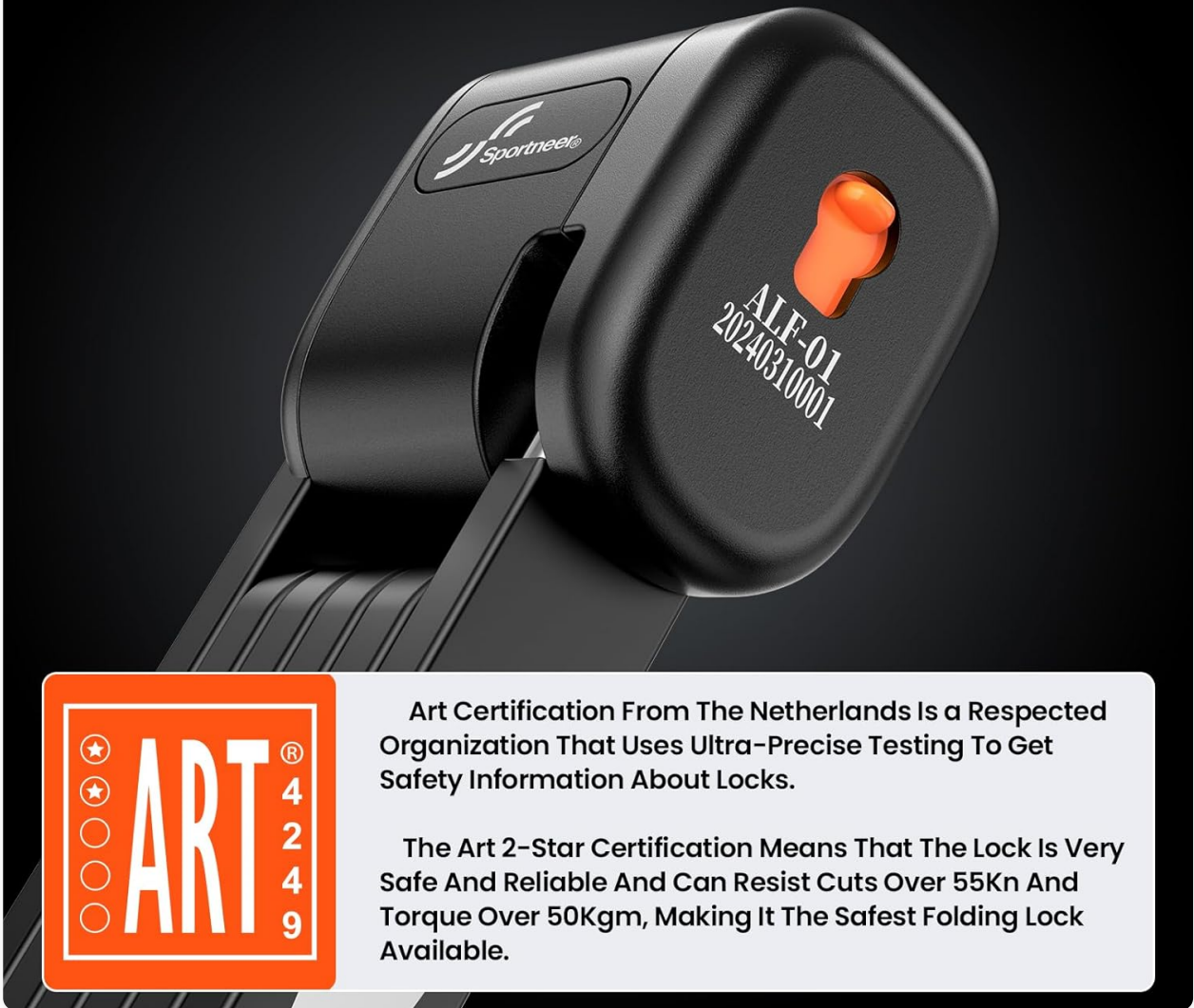
Figure 2.2: Details on the ART 2-star certification, indicating the lock's high reliability and resistance to over 55kN of cut force and 50Kgm of torque.

Fully Convinced Of The Reliability Of This Certificate