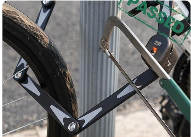
Hard Alloy Steel Saw