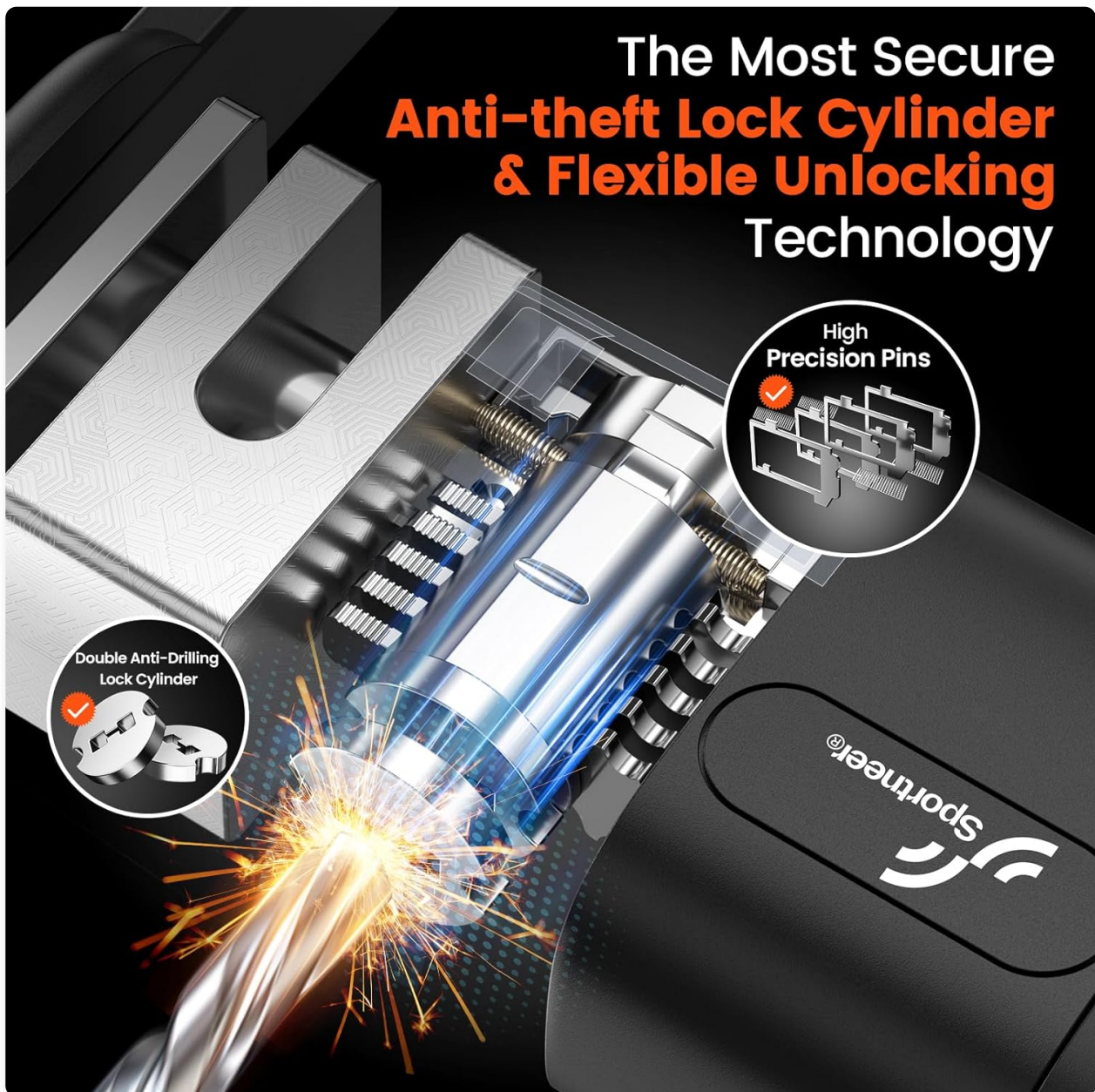
Figure 2.1: Illustration of the lock's secure anti-theft cylinder and flexible unlocking technology, featuring double anti-drilling and high precision pins.