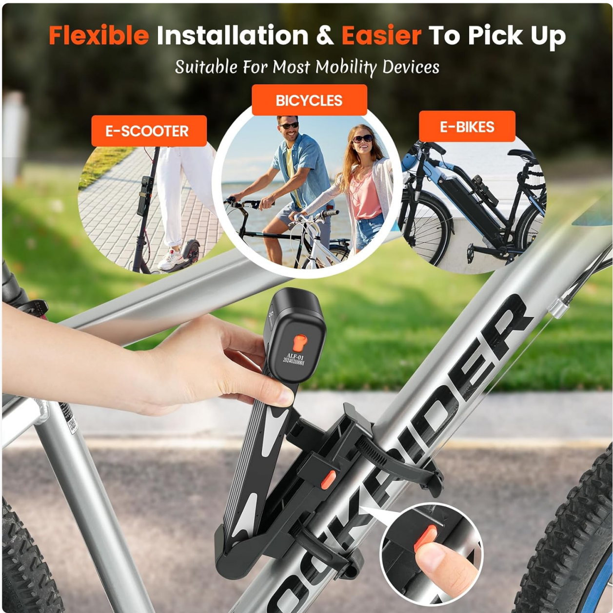
Figure 5.1: Demonstrates the flexible installation of the mounting bracket on various mobility devices, including bicycles, e-scooters, and e-bikes.