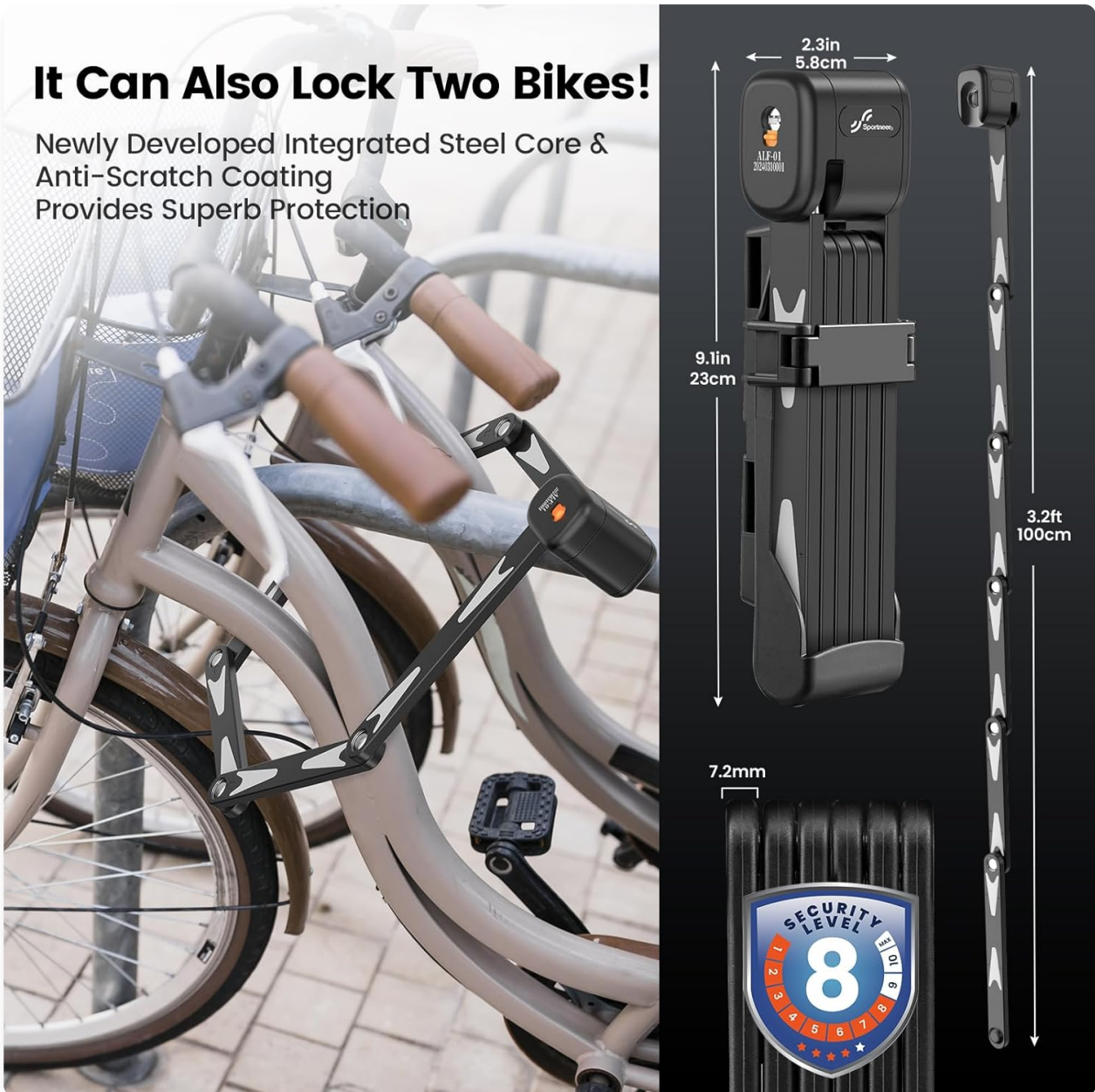
Figure 6.1: The Sportneer folding lock in use, securing a bicycle to a fixed object, highlighting its extended length and robust connection points.