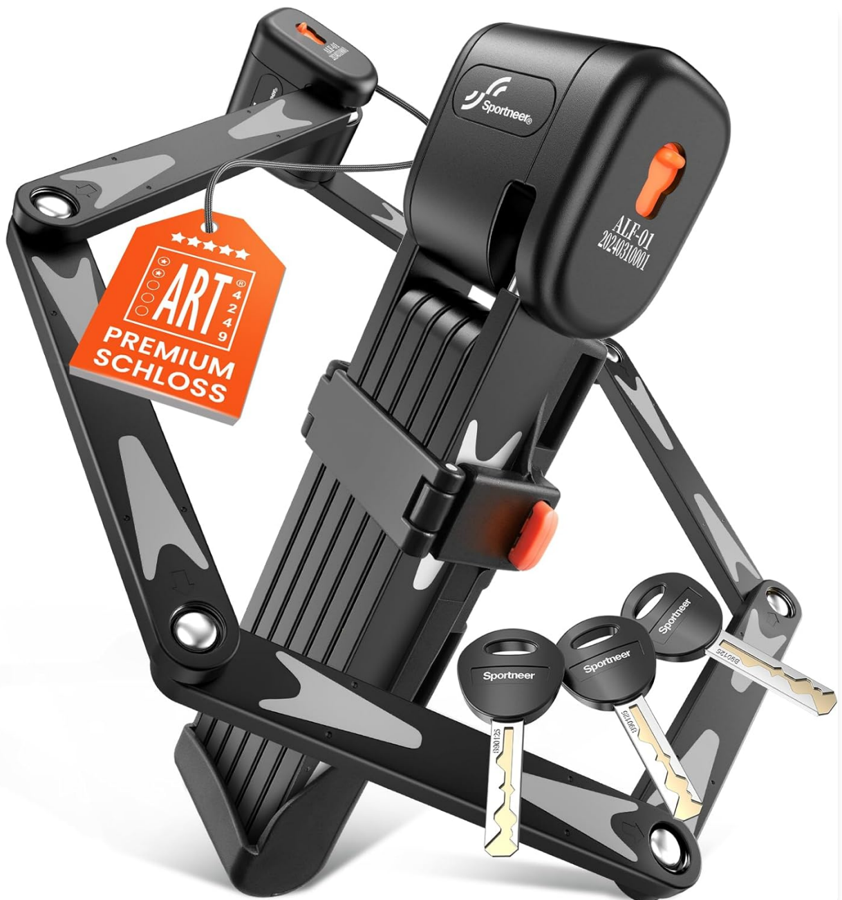
Figure 1.1: Sportneer ALF-01 Folding Bicycle Lock, showing the lock in its folded state, the mounting bracket, and the three included keys.