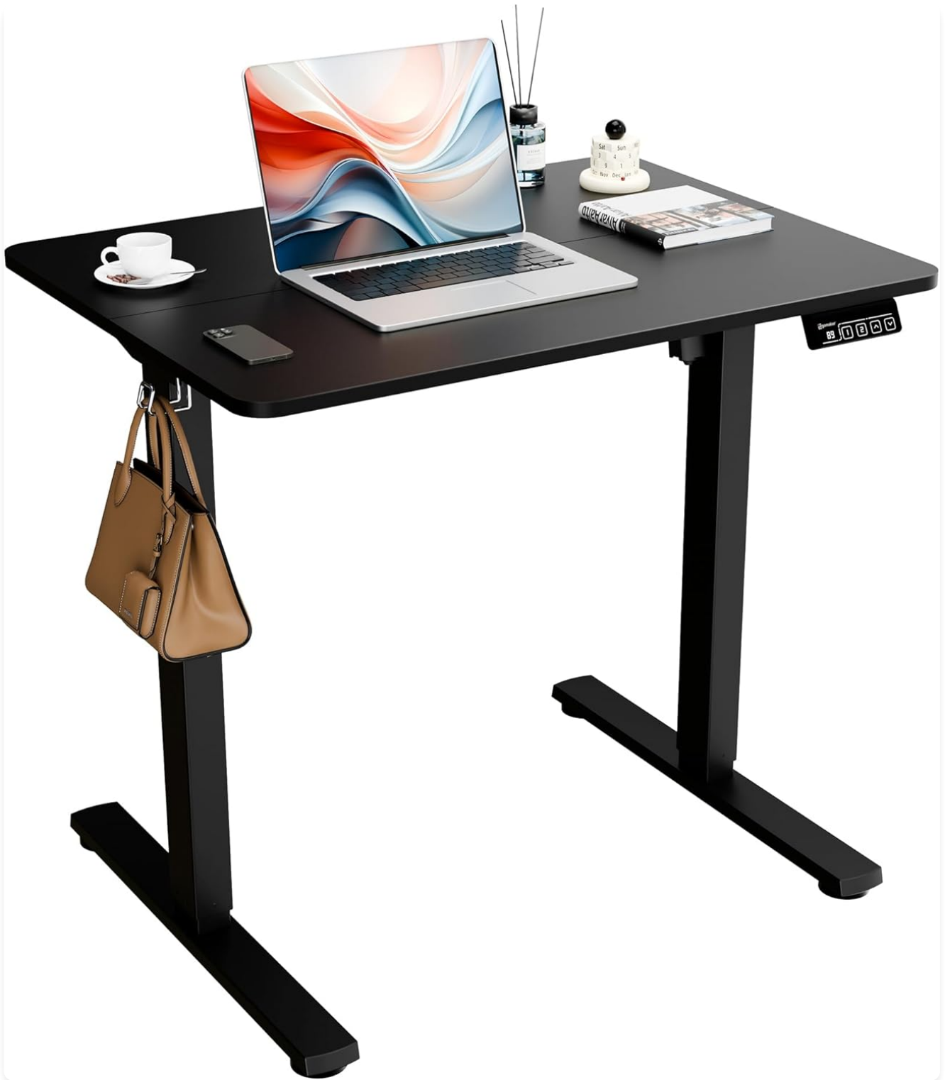
Image: The ERGOMAKER Electric Height Adjustable Standing Desk, featuring a black desktop and black frame, with a laptop and accessories.