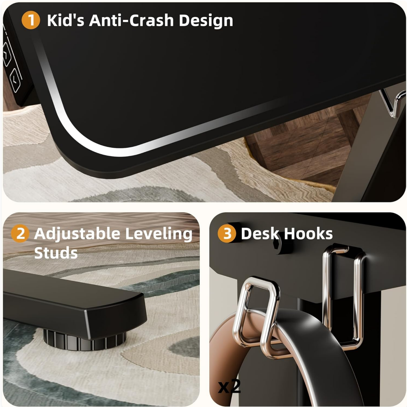
Image: Detailed view of the desk's anti-crash design, adjustable leveling studs, and convenient desk hooks.