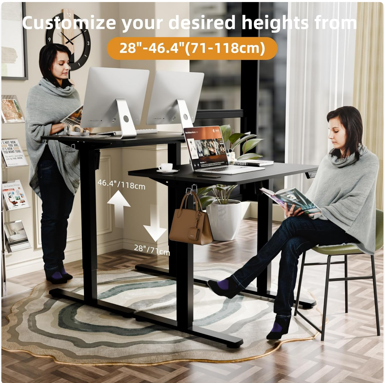
Image: Visual representation of the desk's adjustable height range, from 28 inches (71cm) to 46.4 inches (118cm), accommodating various user heights for sitting and standing.

Customize your desired heights from 28"-46.4"(71-118cm)