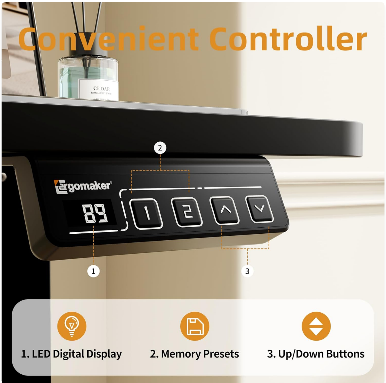
Image: The convenient control panel featuring an LED digital display, memory presets (1, 2), and up/down arrow buttons.