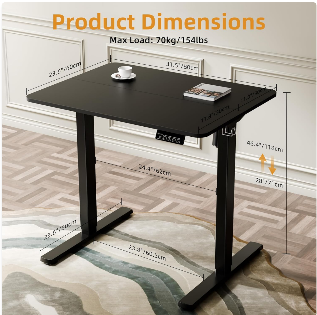
Image: Detailed product dimensions, including desktop size (31.5"W x 23.6"D) and height range (28" to 46.4").