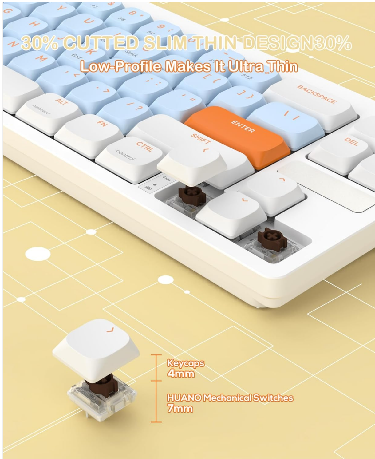
Image 8.1: Detail of the low-profile design and mechanical switches, highlighting the slim profile.