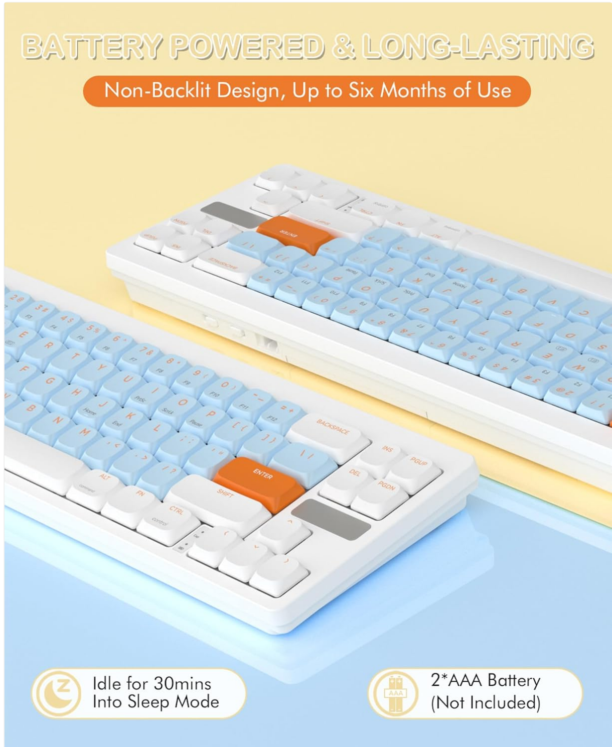
Image 4.1: The keyboard requires two AAA batteries, which are not included in the package. Locate the battery compartment on the underside of the keyboard.