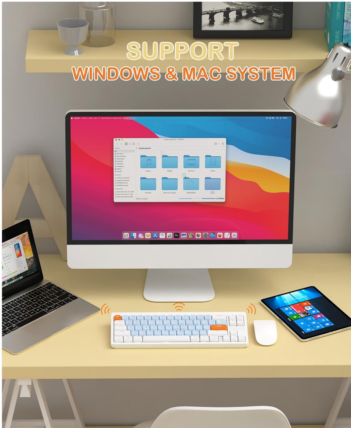
Image 4.3: The keyboard supports both Windows and Mac operating systems, allowing seamless switching.