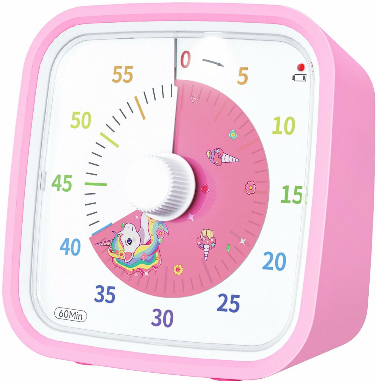
Figure 1: Yunbaoit Visual Timer (Pink Unicorn)