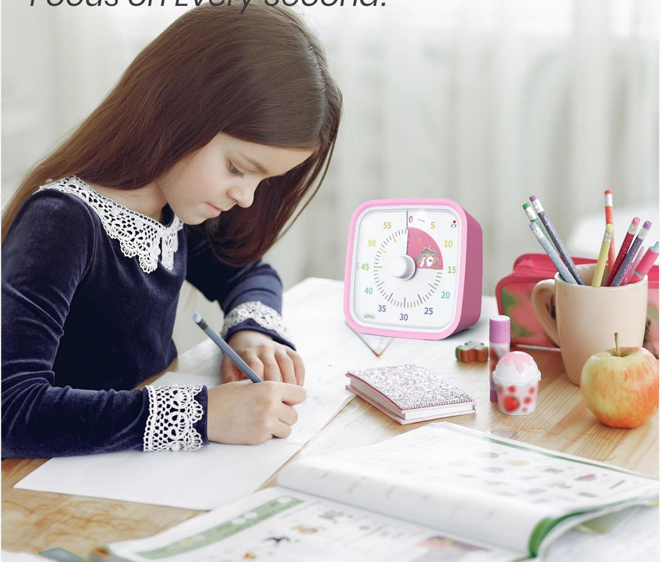
Figure 2: Silent operation for focused work.