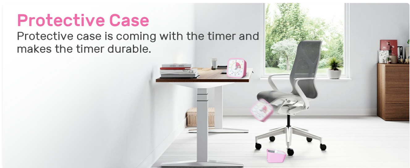
Figure 4: Protective case for enhanced durability.

The timer comes with a silicone protective case. Ensure the case is properly fitted around the timer for optimal protection against impacts.