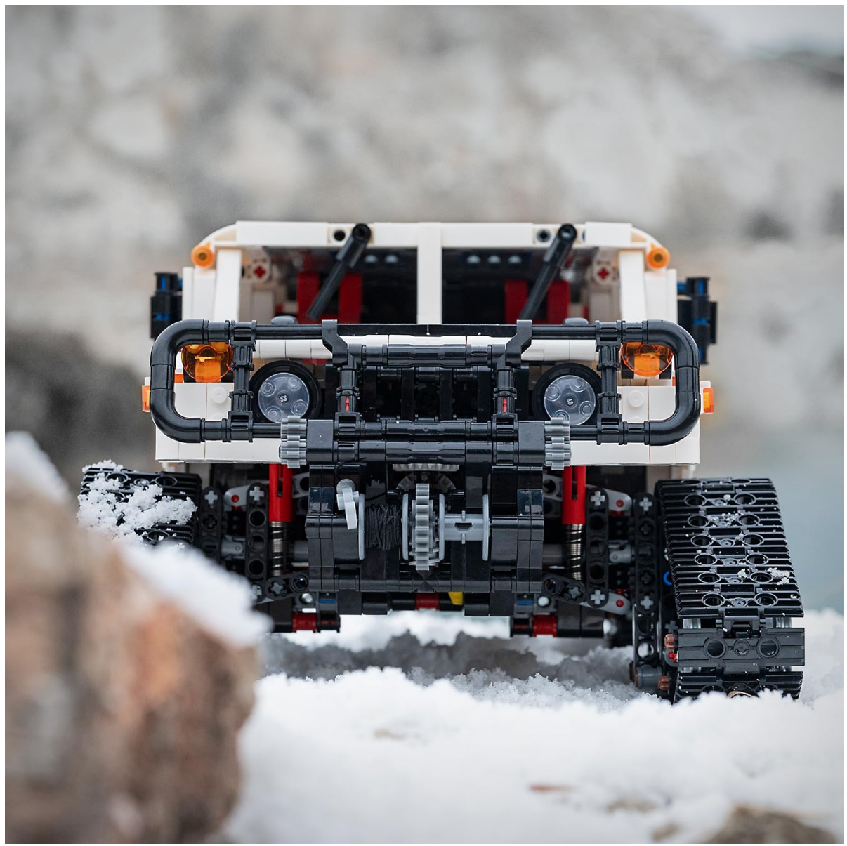
Figure 4.1: The UNCLE BRICK Hummer navigating a snowy environment, showcasing its front design and track system.