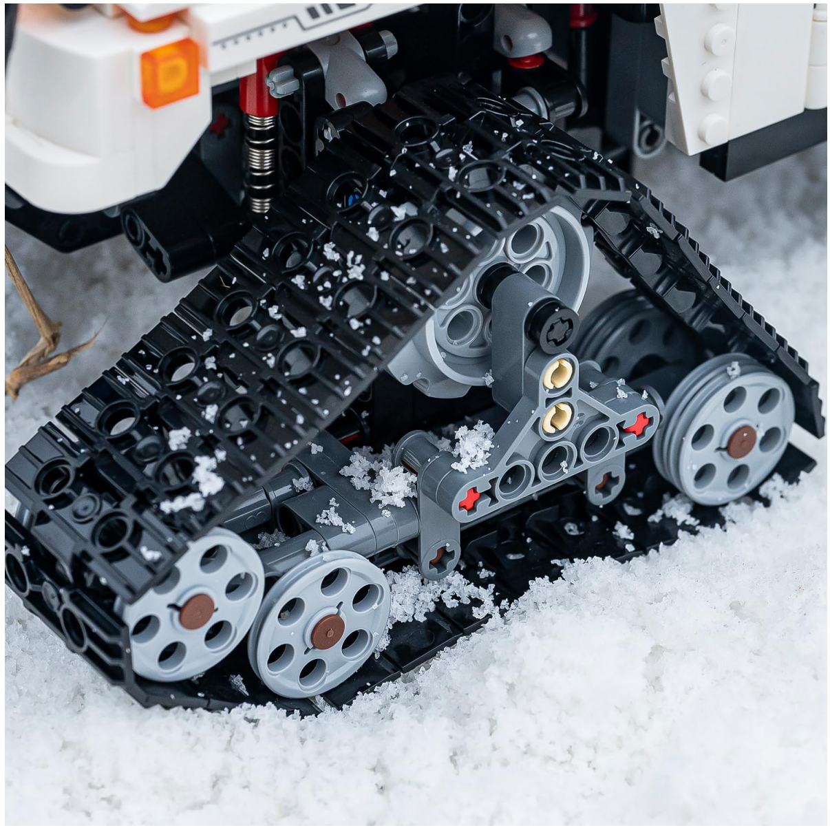
Figure 4.2: Close-up of the vehicle's track system, designed for off-road performance.

Your browser does not support the video tag.