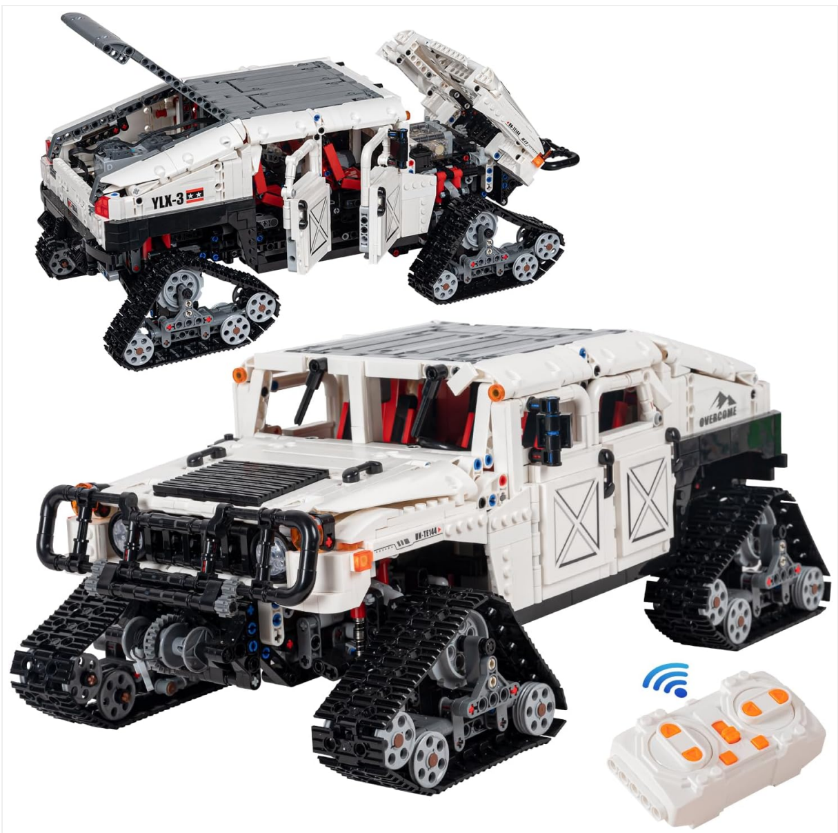
Figure 2.1: Fully assembled UNCLE BRICK Hummer Off-Road Remote Control Car with its remote controller.