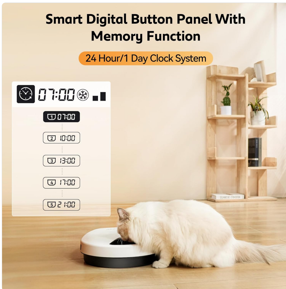
Image: A cat enjoying a meal from the feeder, with an overlay illustrating the digital display and programmed feeding schedule.