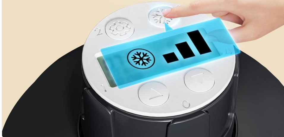
Image: A hand interacting with the cooling mode button, with a visual representation of the three cooling modes and their corresponding temperature ranges.