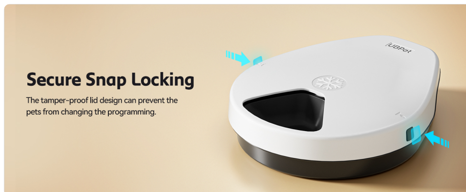
Image: Detail of the secure snap locking mechanism on the feeder's lid.