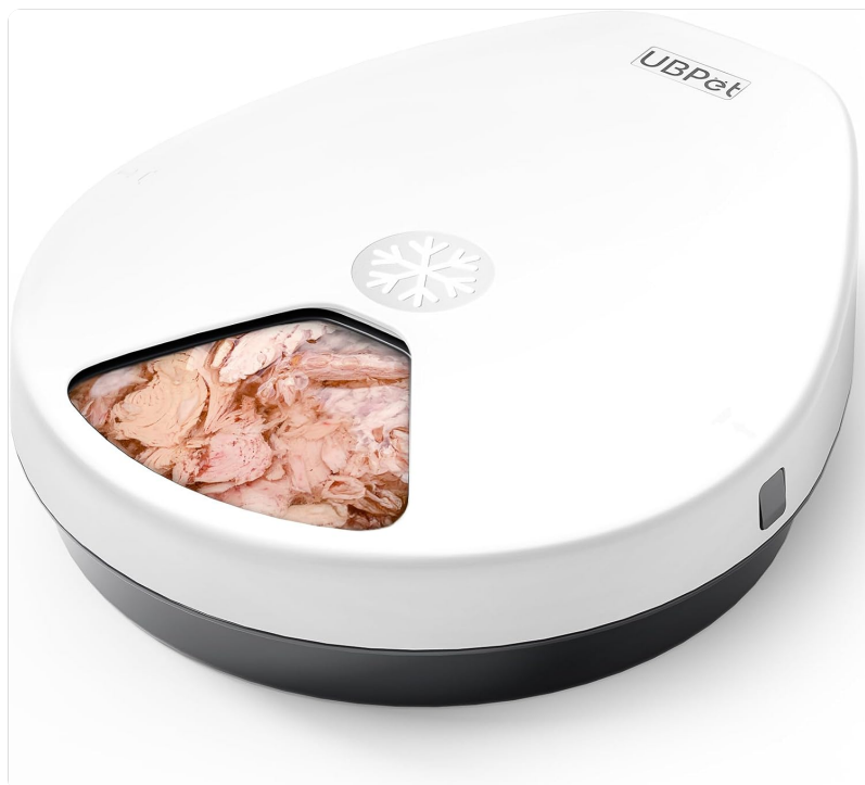
Image: UBPET F10 Automatic Pet Feeder, showcasing its sleek design and a visible food compartment.

The UBPET F10 Automatic Pet Feeder is an advanced digital dispenser designed to provide fresh meals for your cats and dogs. It features a 5-meal capacity and incorporates semiconductor refrigerating chips for long-lasting food freshness. With its smart digital button panel, you can easily personalize feeding schedules and choose from three cooling modes to suit your pet's dietary needs and environmental conditions.