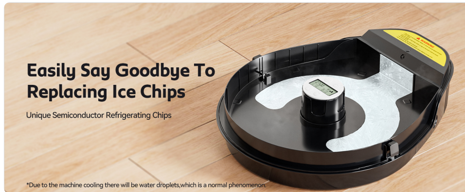
Image: Internal view of the feeder highlighting the semiconductor refrigerating chips for cooling.