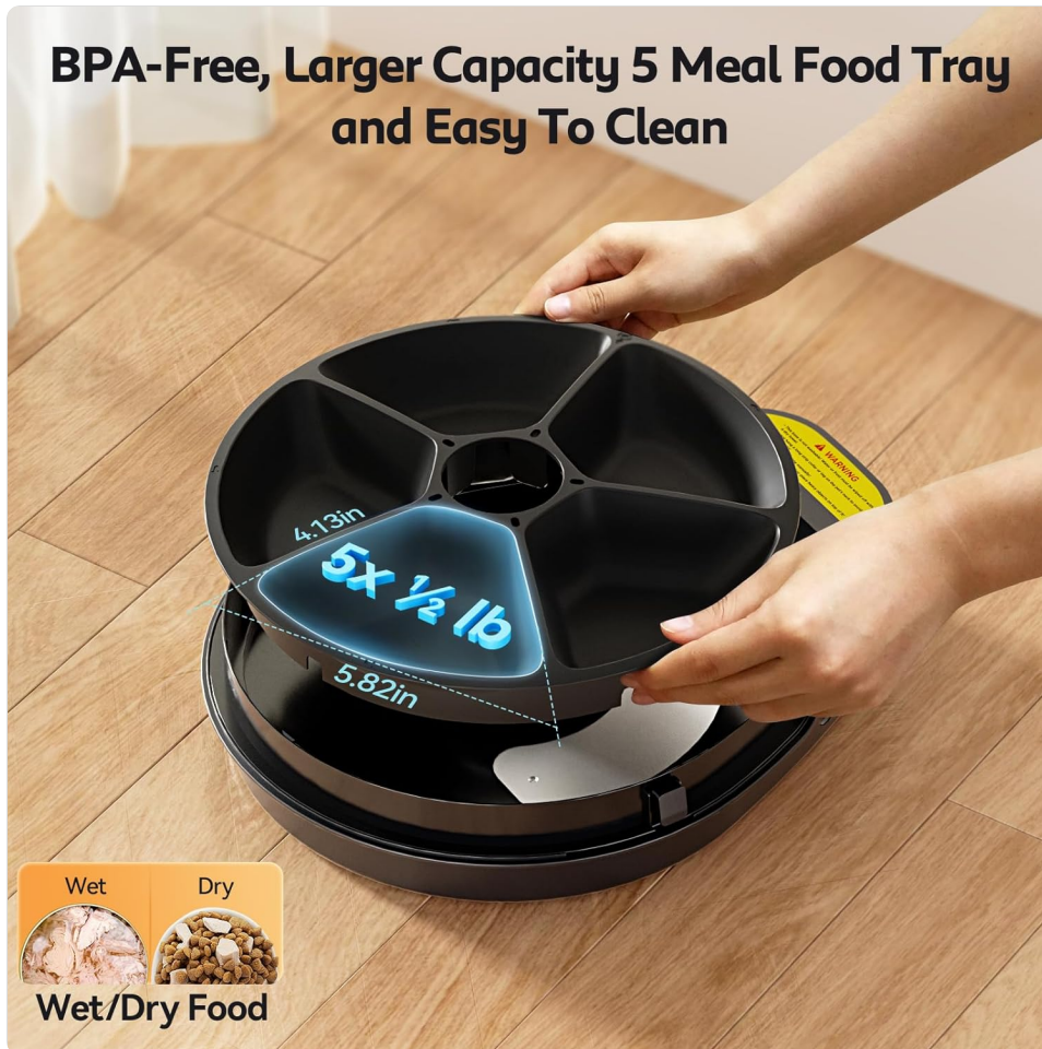
Image: The removable 5-compartment food tray, demonstrating its capacity and ease of handling.