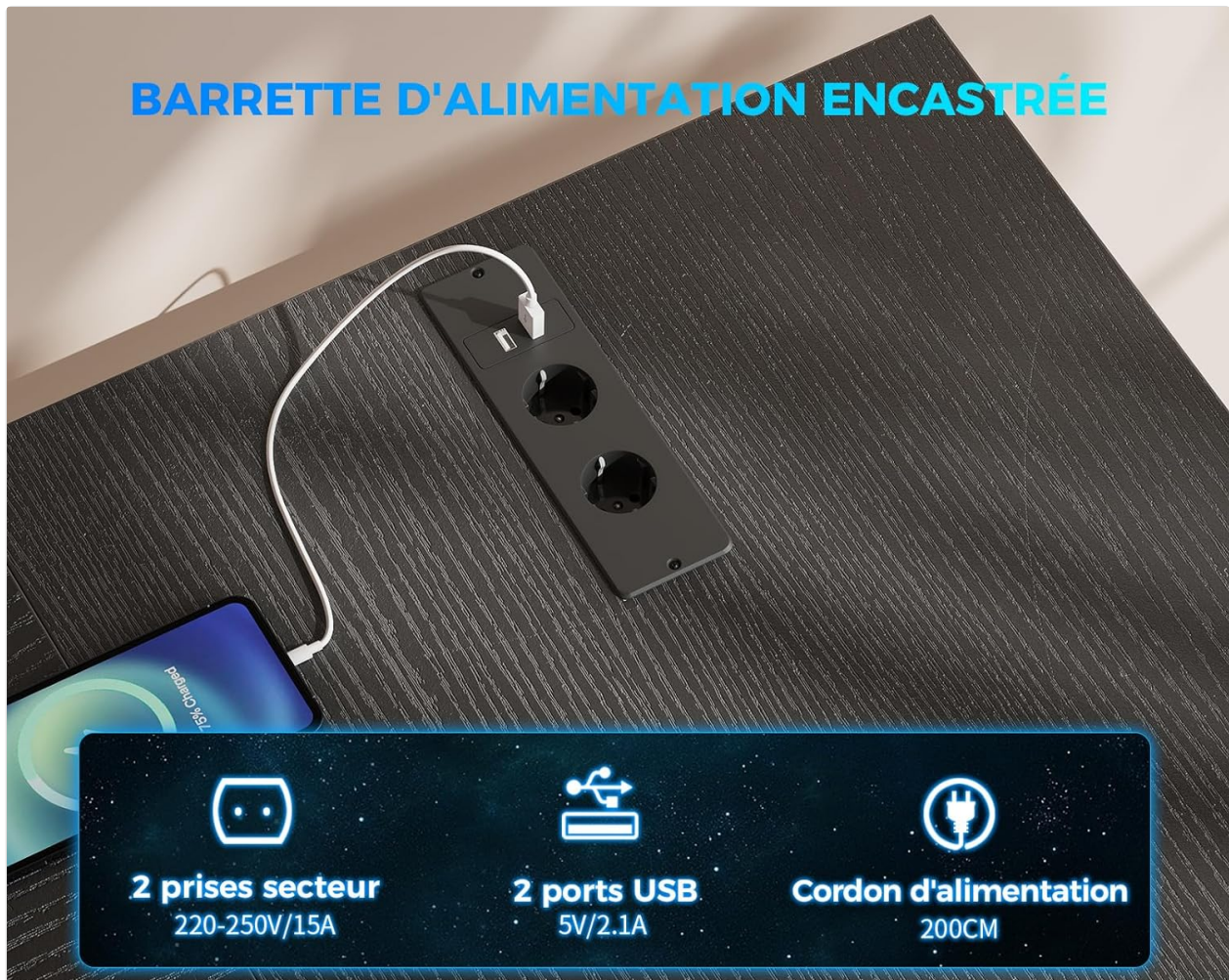
Figure 5: The integrated power strip with a smartphone connected to a USB port for charging, demonstrating its utility.