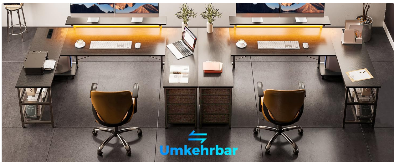
Figure 4: Visual representation of the RGB LED strips, highlighting the 10 available lighting modes and color options.