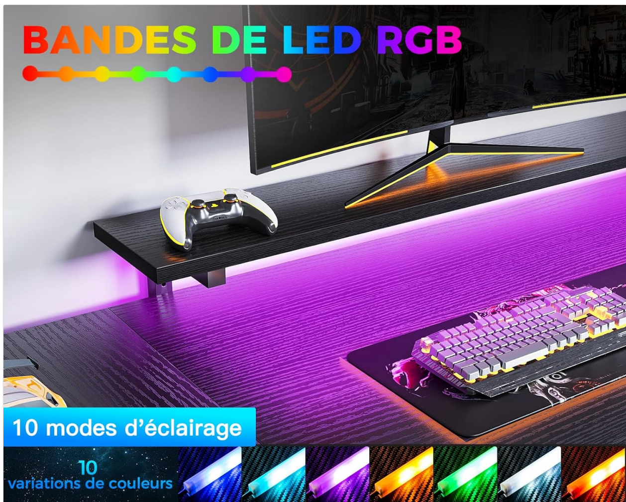
Figure 3: The LED light strip illuminating the desk area with a purple hue, showcasing its customizable lighting feature.