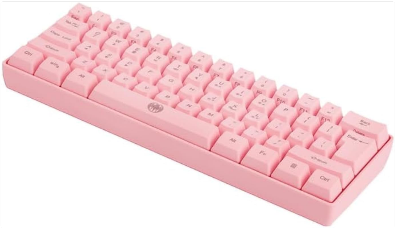
Image: The G61 Gaming Keyboard in pink, showcasing its compact 61-key layout and sleek design.