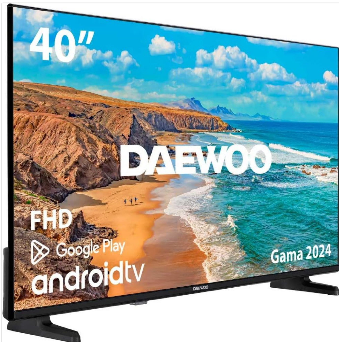
Image: Side profile of the Daewoo Smart TV, illustrating its design and potential access points for connections.