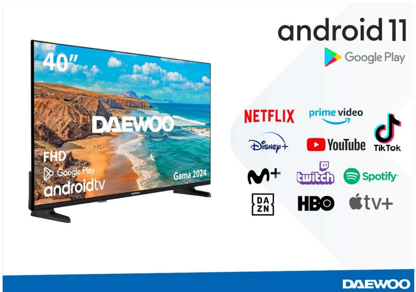
Image: The Daewoo Smart TV 40DM62FA showcasing its Android TV interface and a wide array of supported streaming applications.