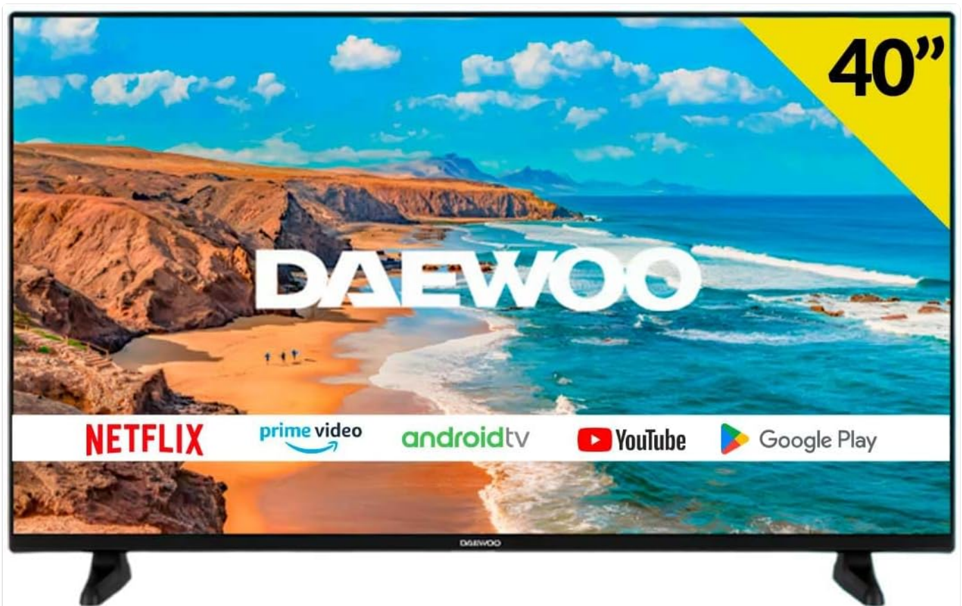
Image: Front view of the Daewoo 40DM62FA Smart TV, highlighting its display and integrated smart features.

This user manual provides comprehensive instructions for the setup, operation, and maintenance of your Daewoo Smart TV 40DM62FA. Please read this manual thoroughly before using your television to ensure proper functionality and safety. Keep this manual for future reference.