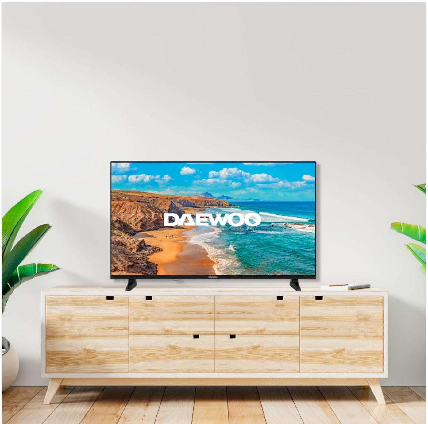
Image: The Daewoo Smart TV 40DM62FA positioned on a media console, illustrating a common setup scenario.