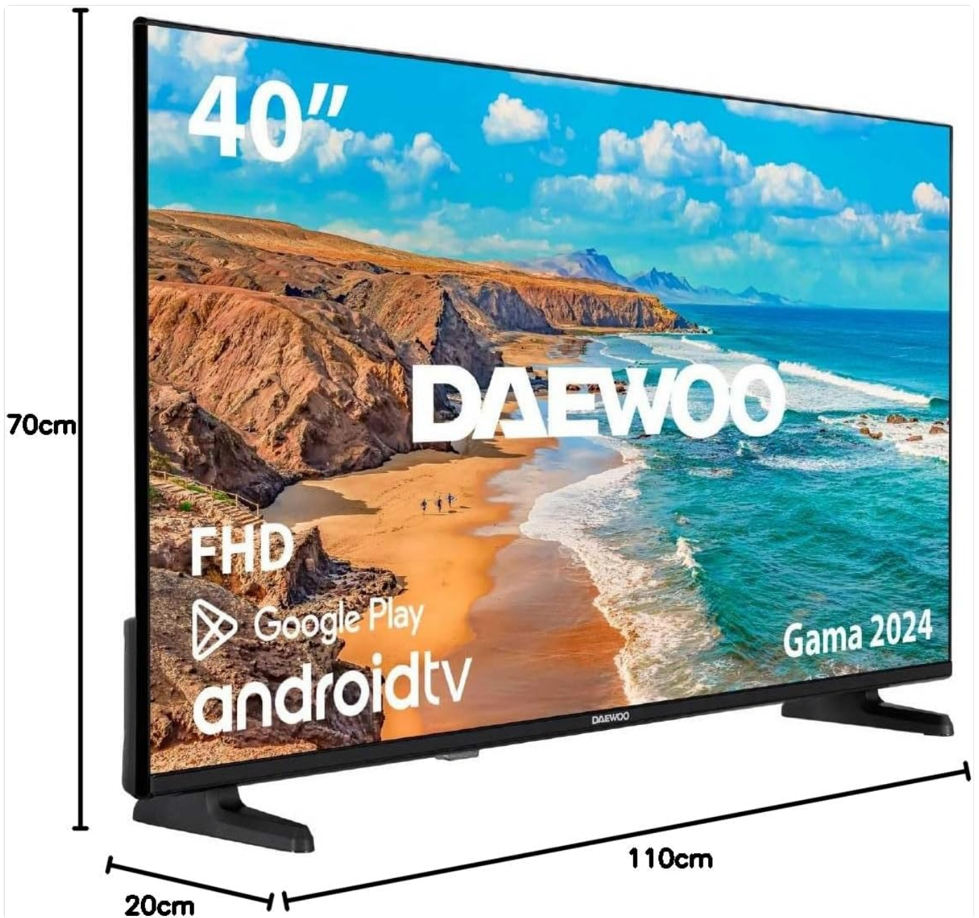
Image: Dimensional overview of the Daewoo Smart TV 40DM62FA, illustrating its physical size.