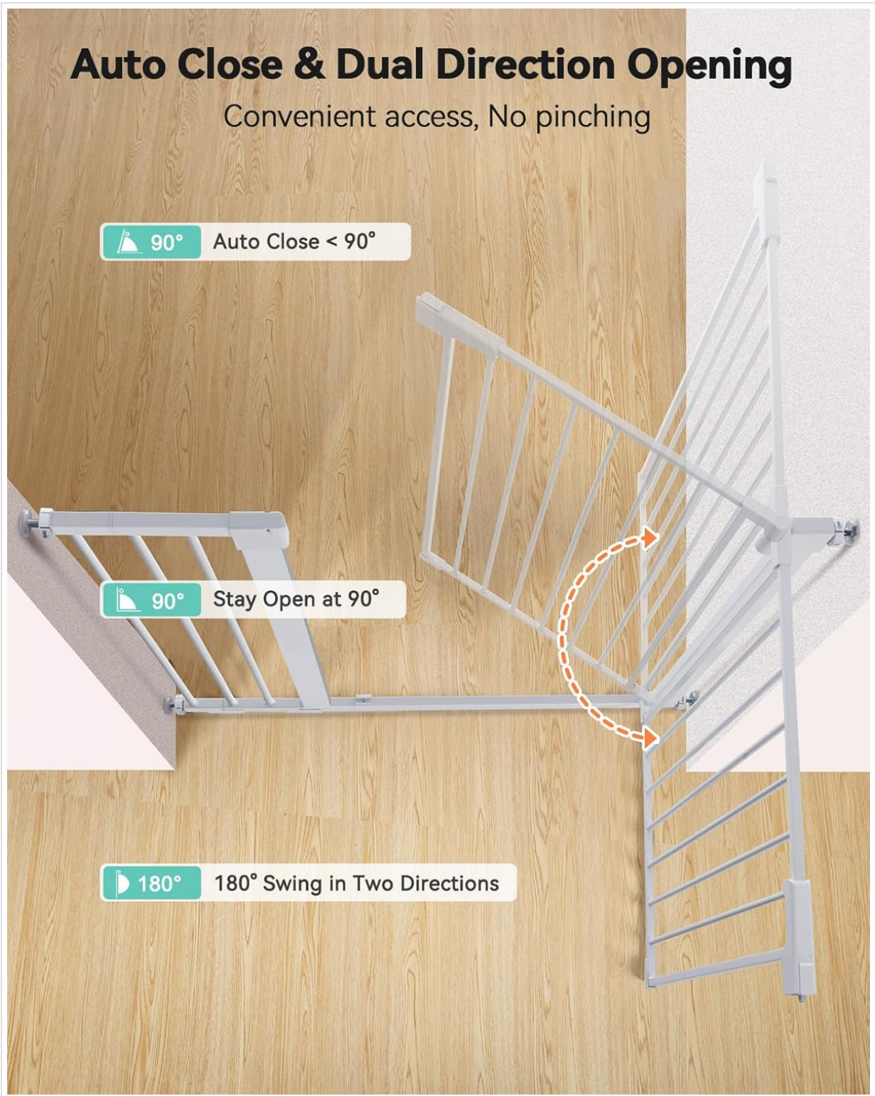
Figure 2: Auto-close and dual-direction opening features for convenient access and safety.