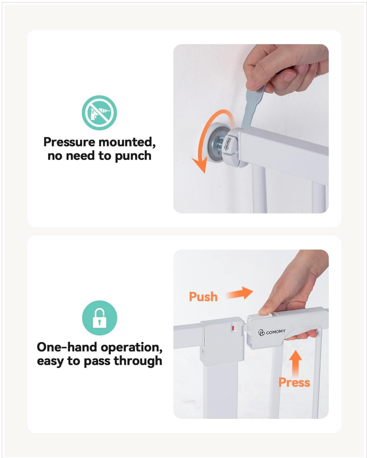
Figure 4: One-hand operation for easy passage.