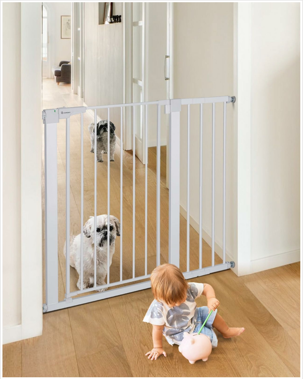
Figure 1: COMOMY 36" Extra Tall Baby Gate installed in a doorway.