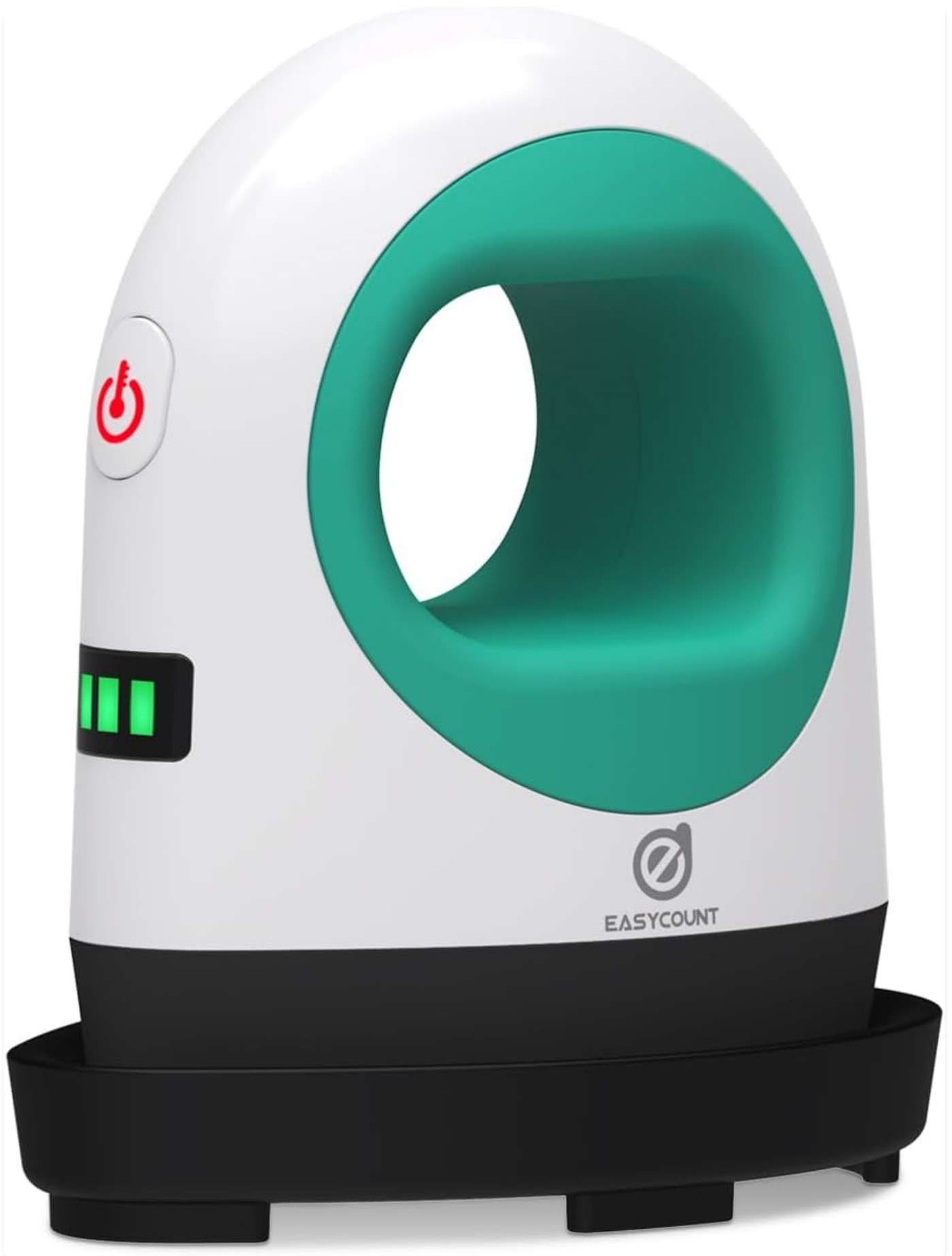
Image: The Easy Count E Mini Heat Press Machine, a compact green and white device with a handle and an insulated base.