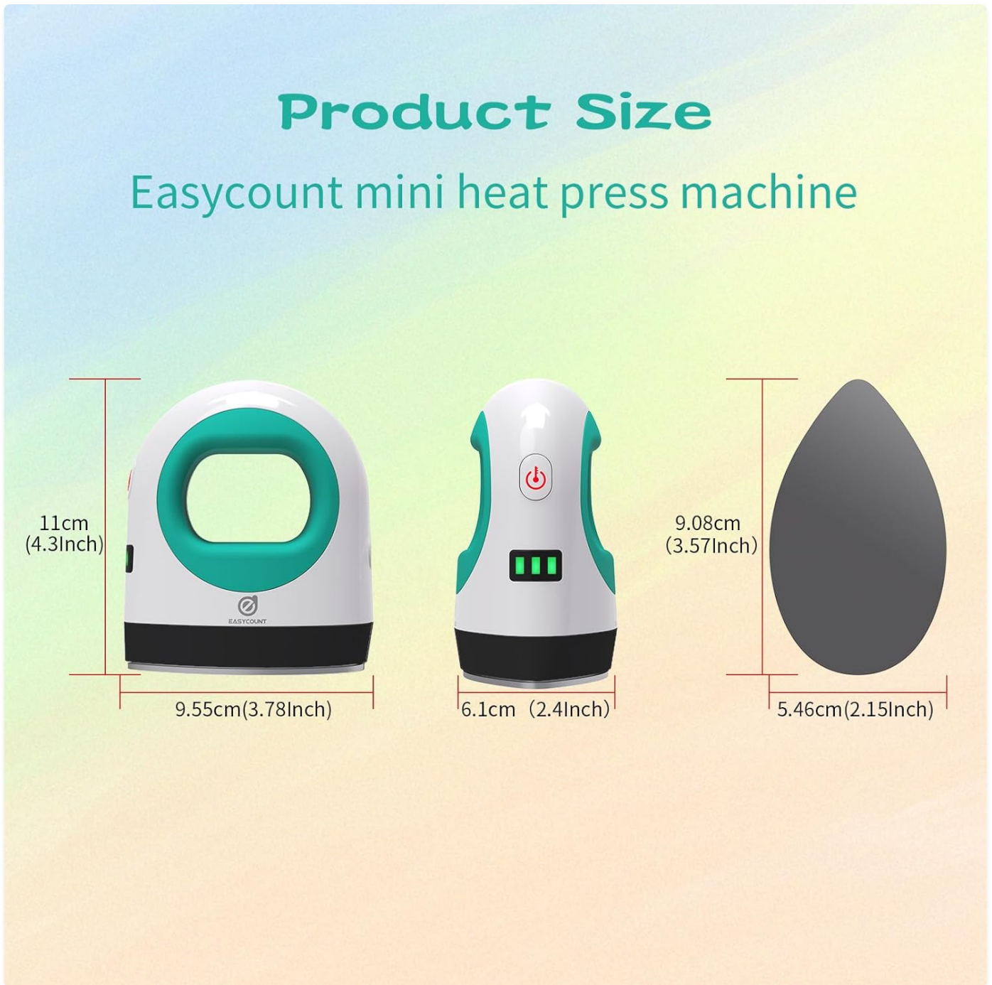
Image: Diagram showing the precise dimensions of the Easy Count E Mini Heat Press Machine in both centimeters and inches.