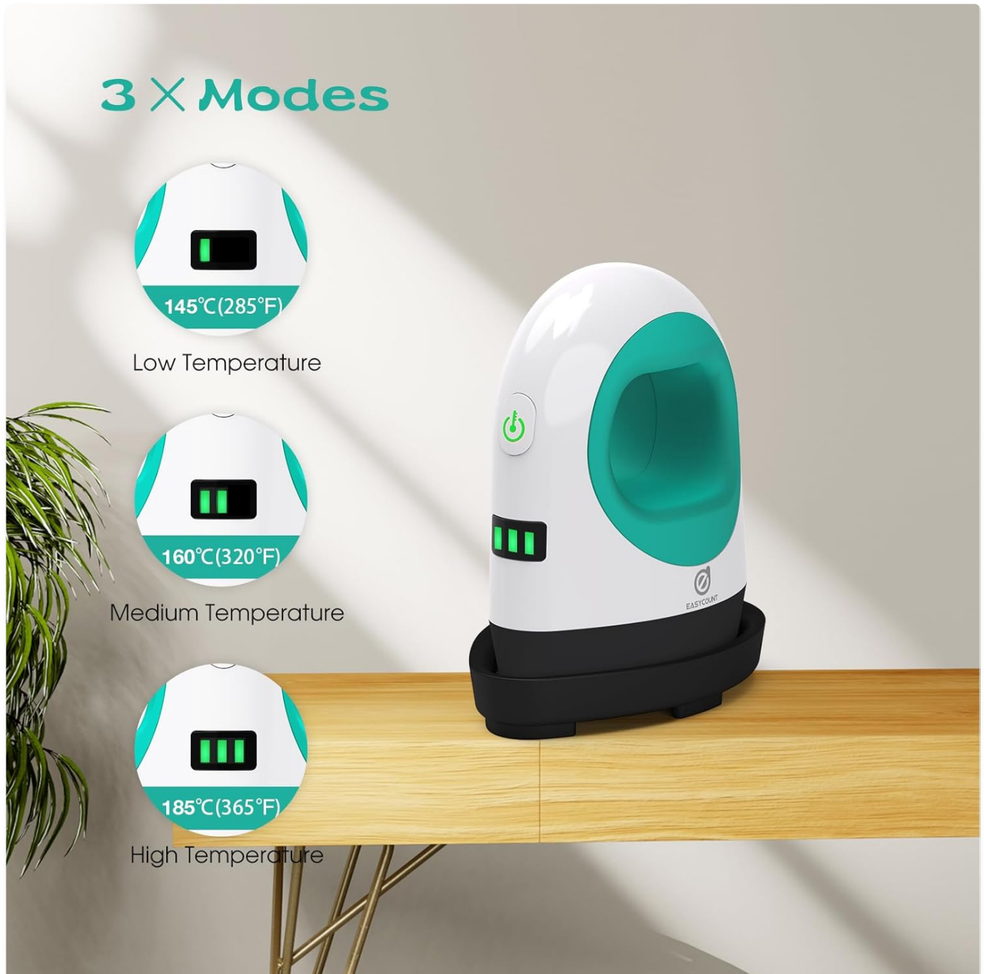
Image: Diagram illustrating the three temperature modes (Low, Medium, High) with their corresponding Celsius and Fahrenheit values, and how they are indicated by the green lights on the machine.

To cycle through the temperature settings, short press the power button. The machine will heat up rapidly to the selected temperature.