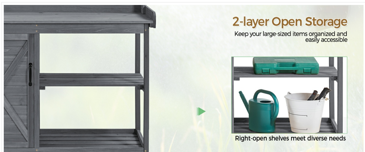
Figure 4.2: The two-layer open storage area.

Insert the bottom slatted shelf (16) into the open storage area. Then, install the middle slatted shelf (15) above it. Ensure they are level and secure.