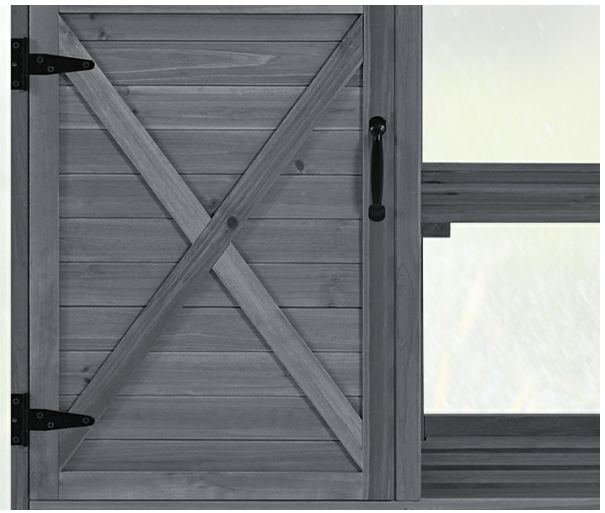
Figure 4.3: The cabinet door with X-shaped pattern.

Left cabinet better keeps items' privacy and sealing