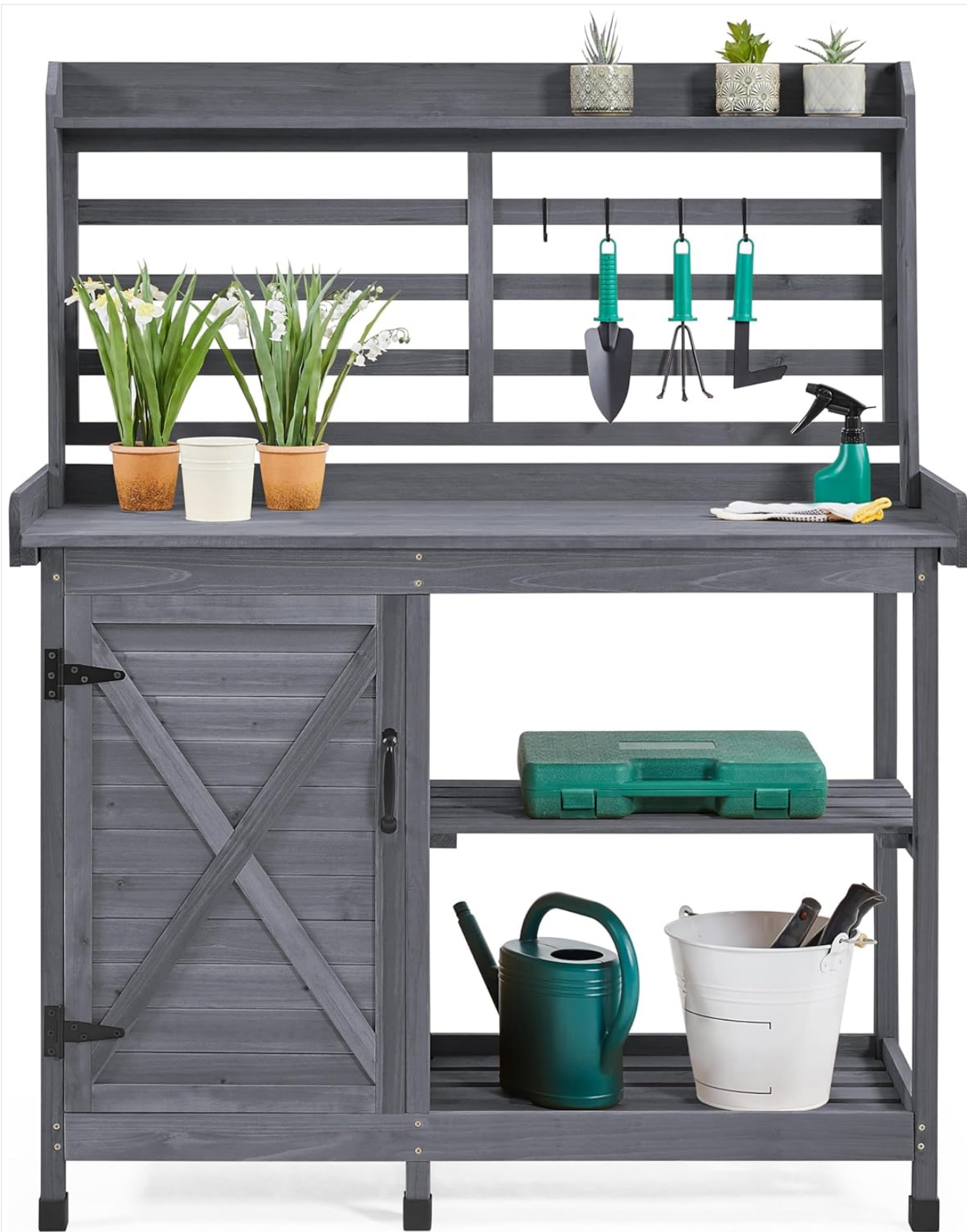
Figure 1.1: The Yaheetech Outdoor Potting Bench in a garden setting.