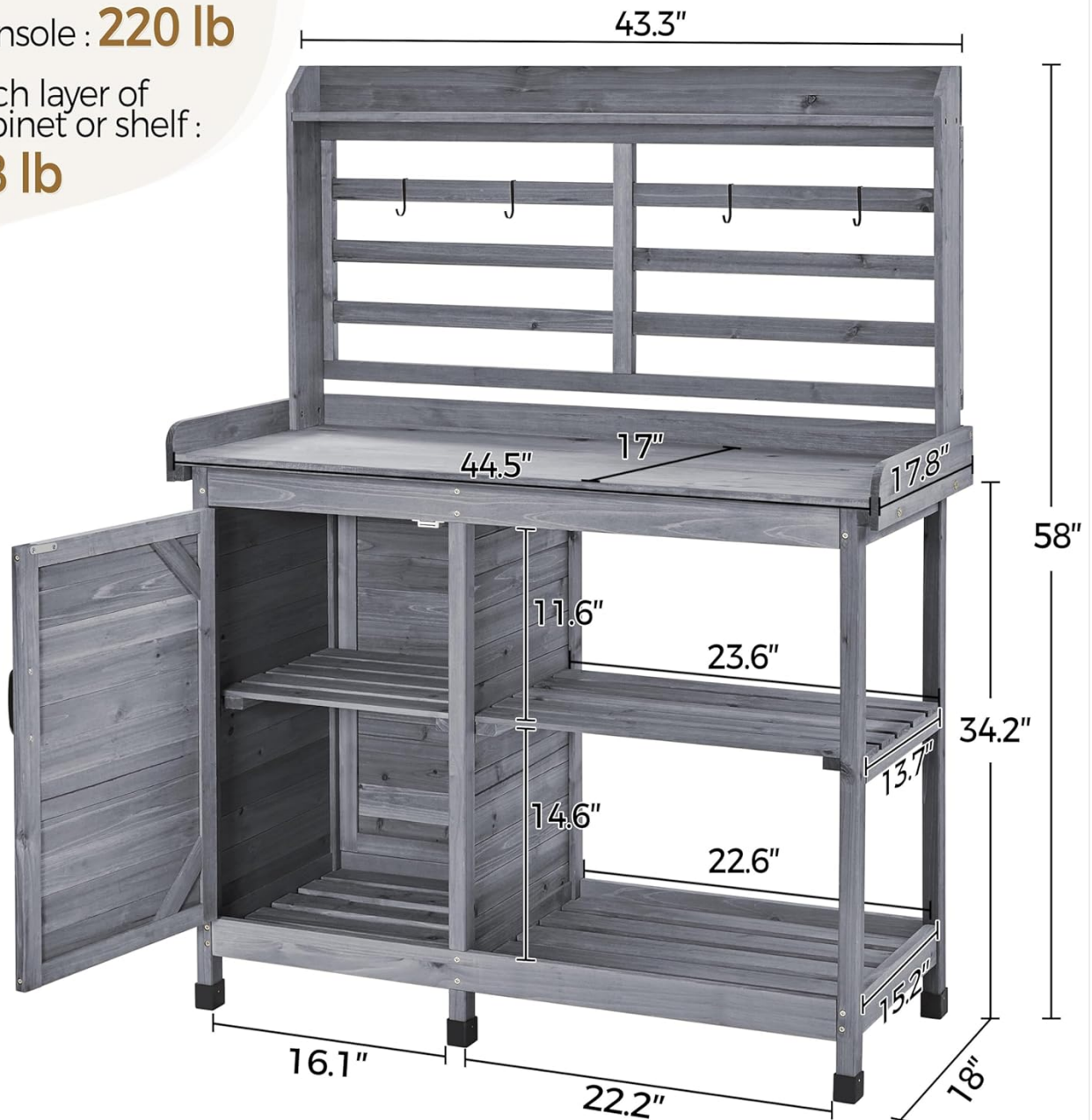
Figure 8.1: Detailed dimensions of the potting bench.