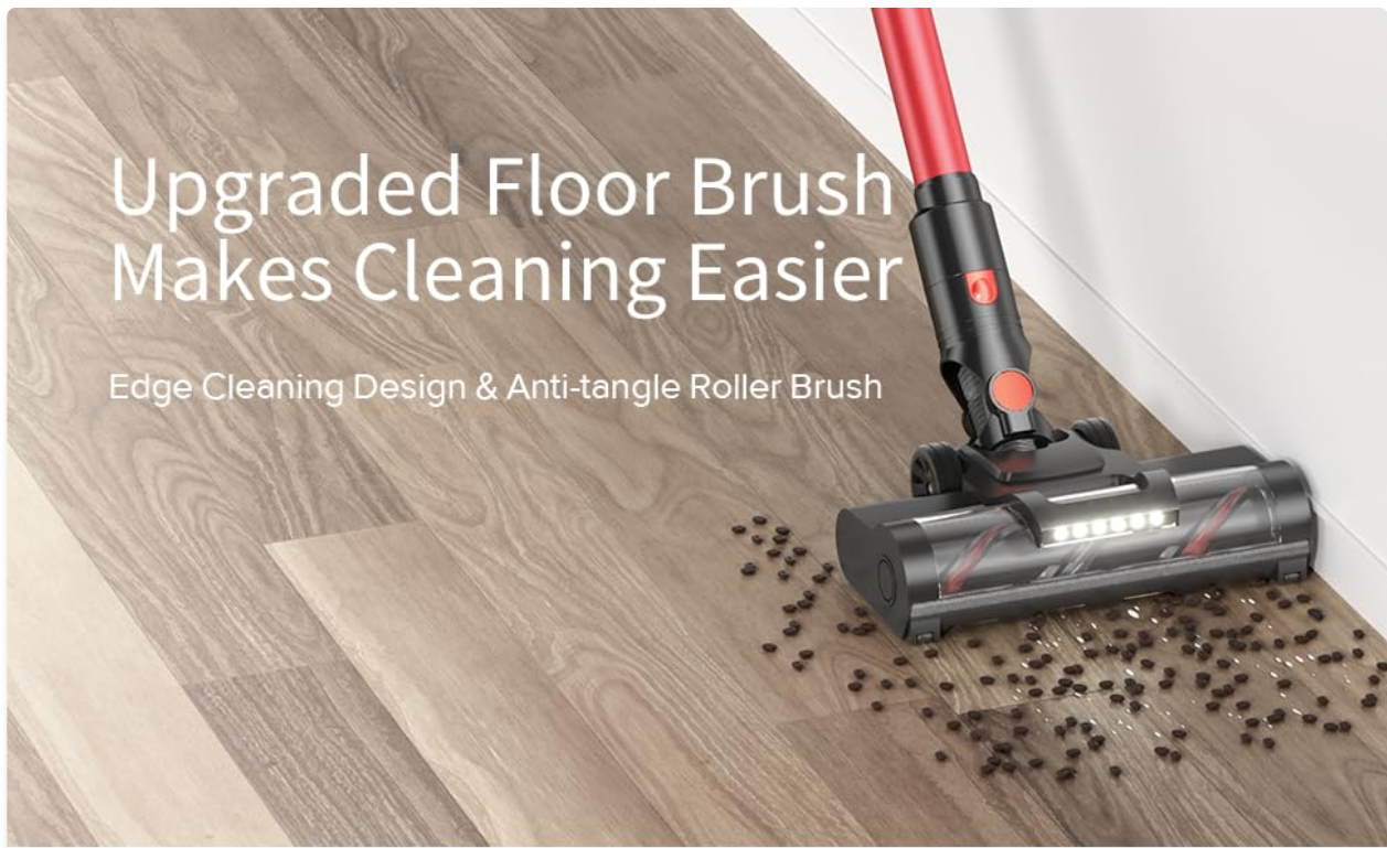
Image: Various attachments and their uses.

The vacuum comes with various attachments for specialized cleaning tasks.