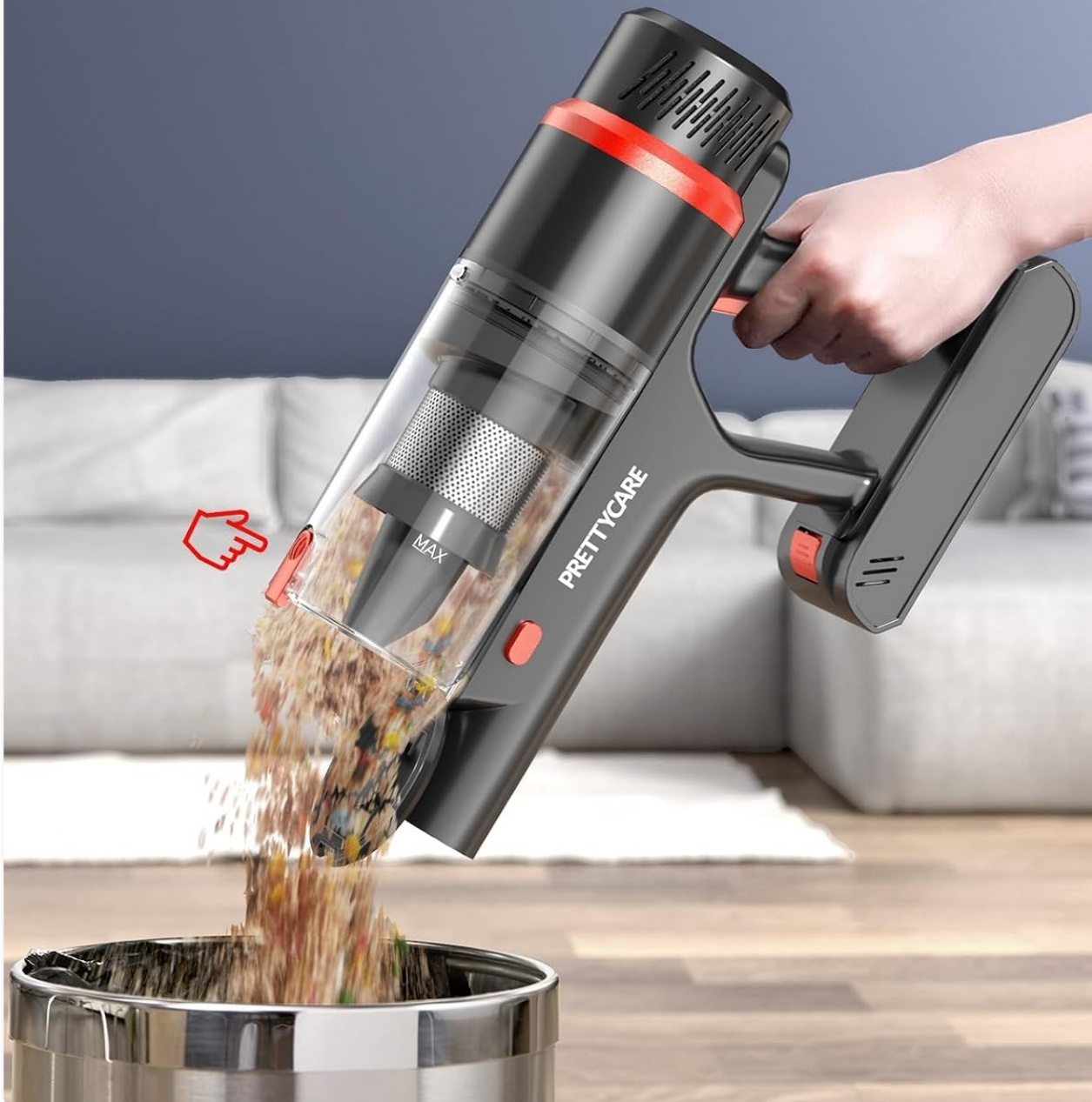
Image: One-touch dustbin emptying.