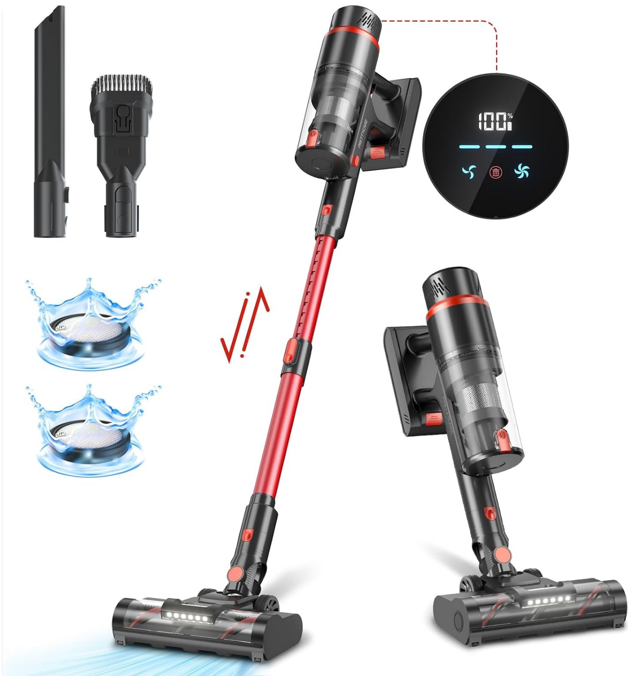
Image: Overview of the PRETTYCARE V1 Cordless Vacuum Cleaner and its main components.