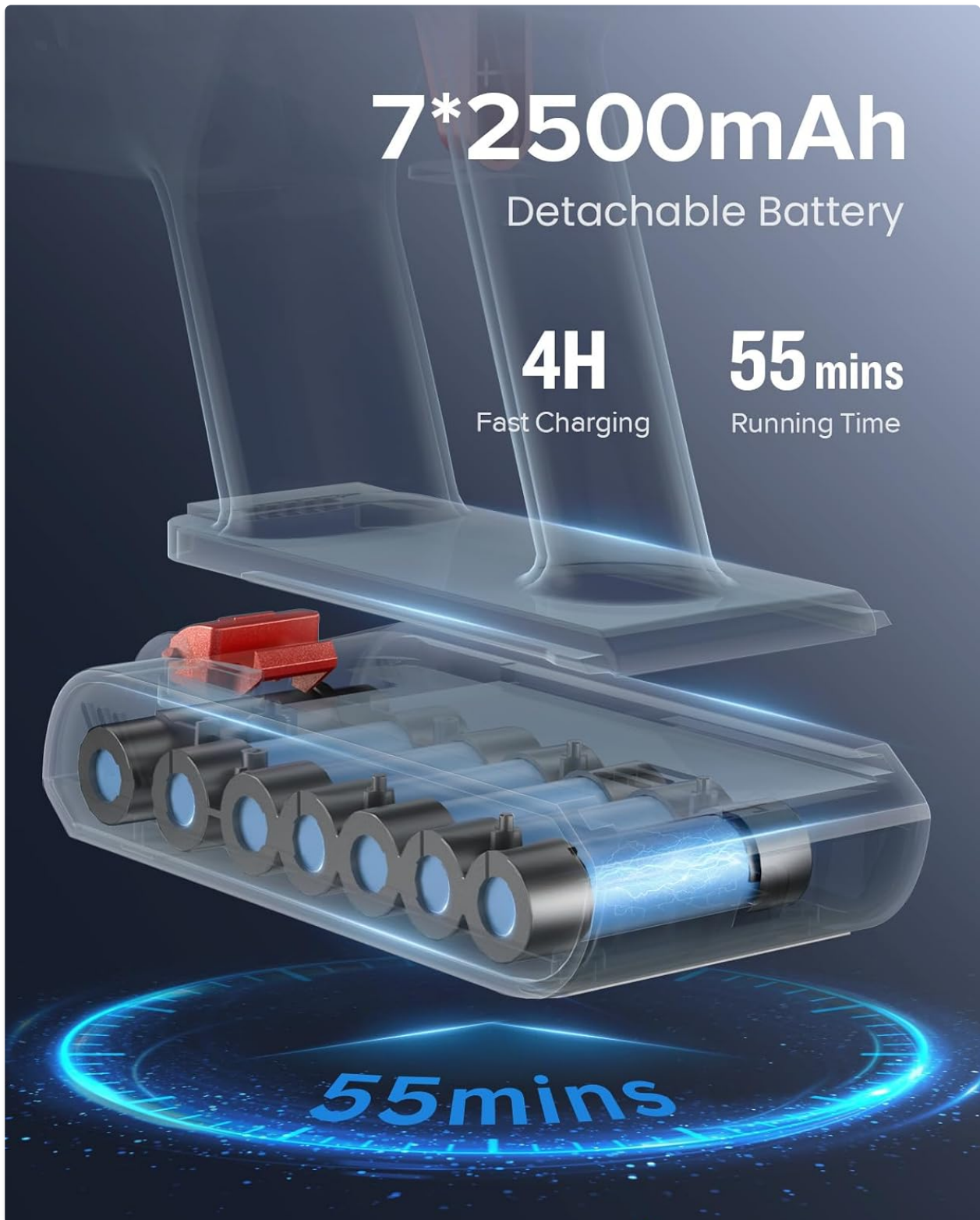
Image: Detachable battery and charging information.

Before first use, fully charge the battery. The detachable battery allows for flexible charging options.