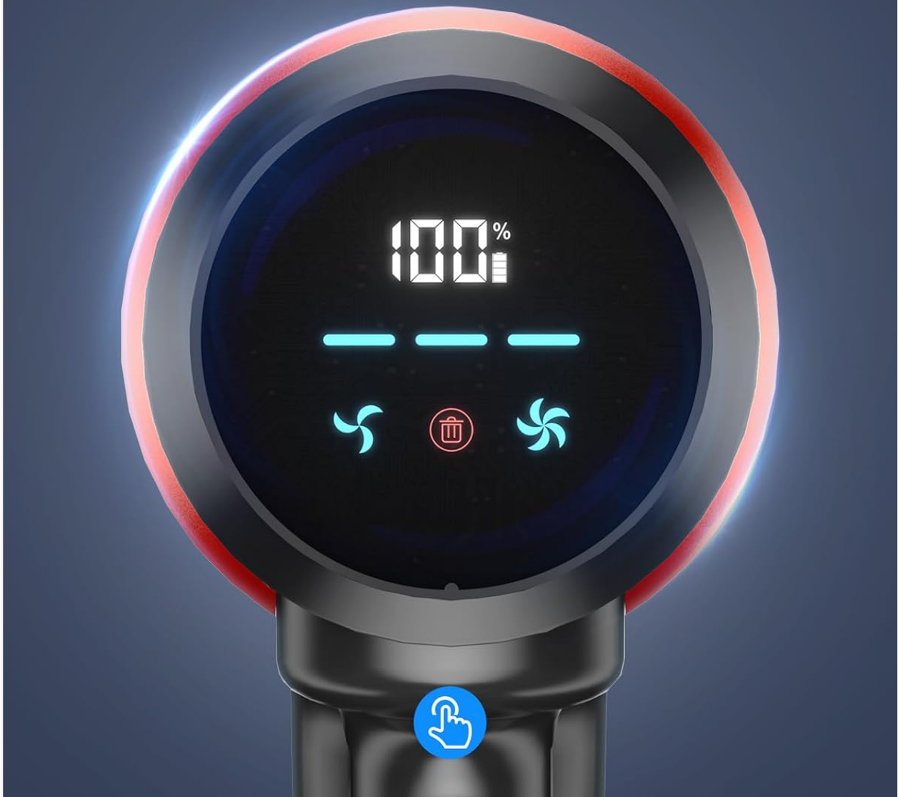
Image: LED electric brush with anti-tangle comb.

Show the Remaining Power and Make the Plan Reasonable