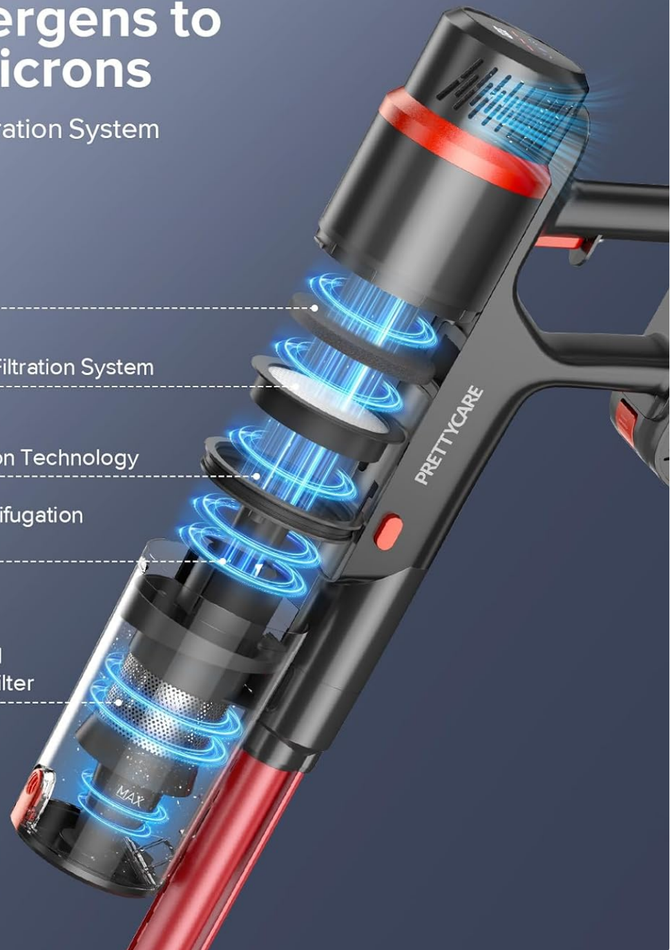
Image: 5-stage filtration system diagram.