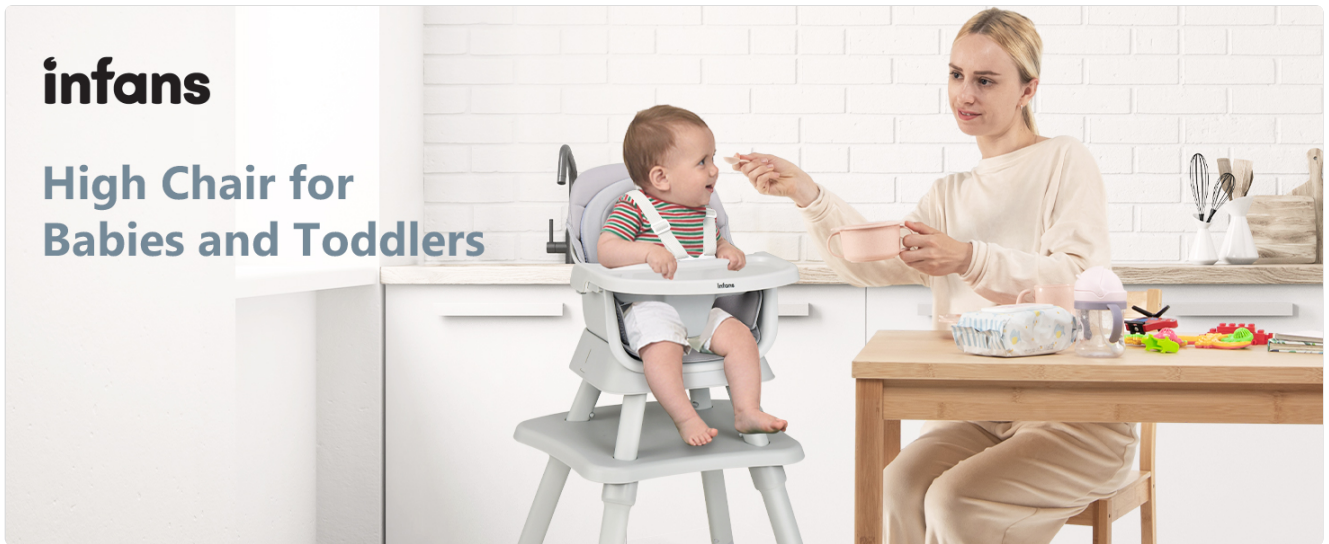
Figure 3: The 8-in-1 functionality of the high chair.