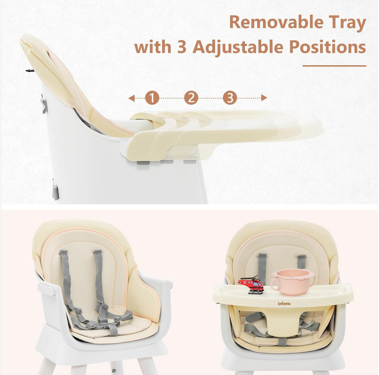
Figure 2: Safety features including the 5-point harness and fixed safety baffle.