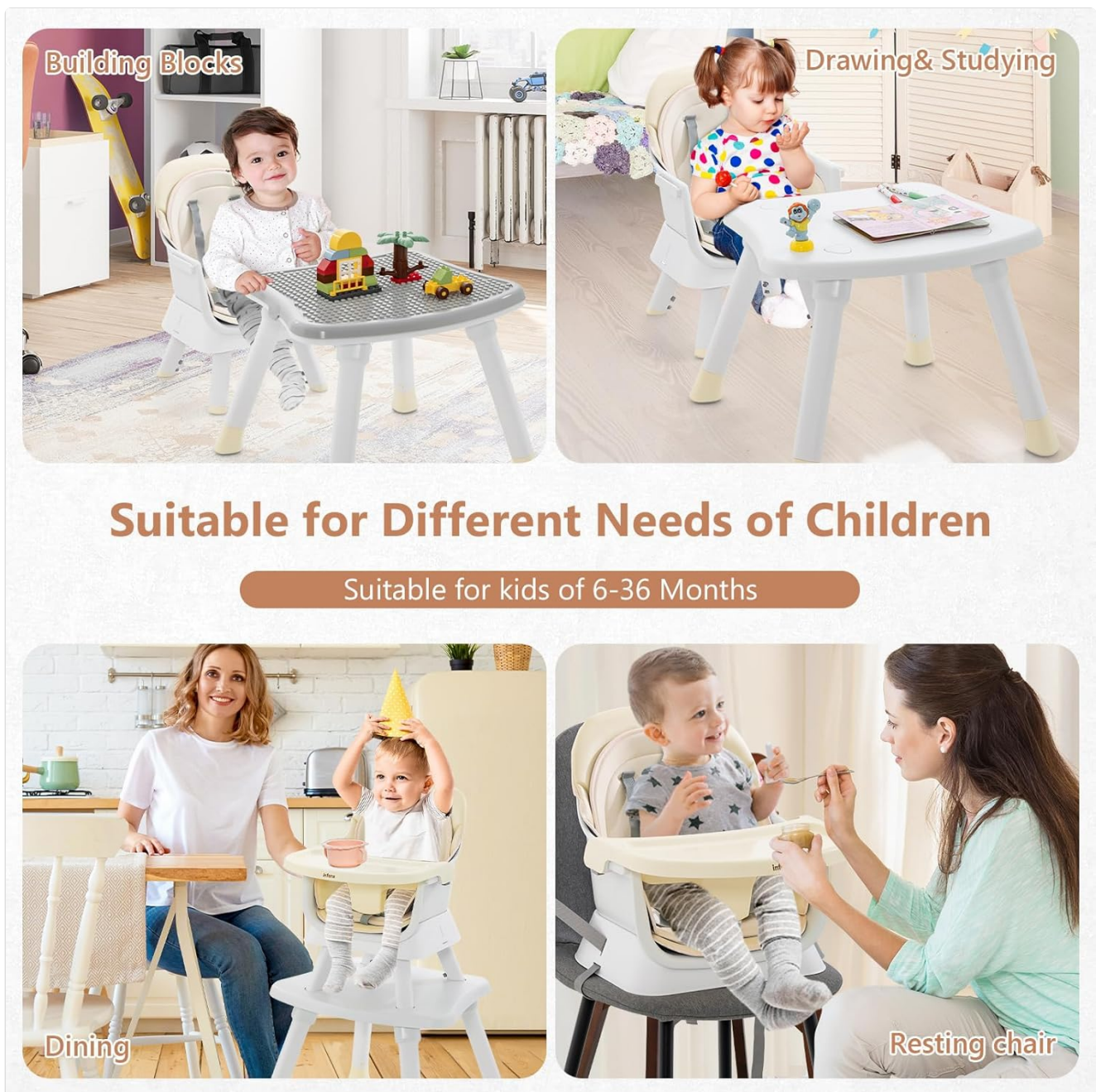
Figure 1: Overview of the 8-in-1 configurations.