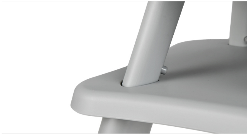
Figure 5: Easy-to-clean features of the high chair.