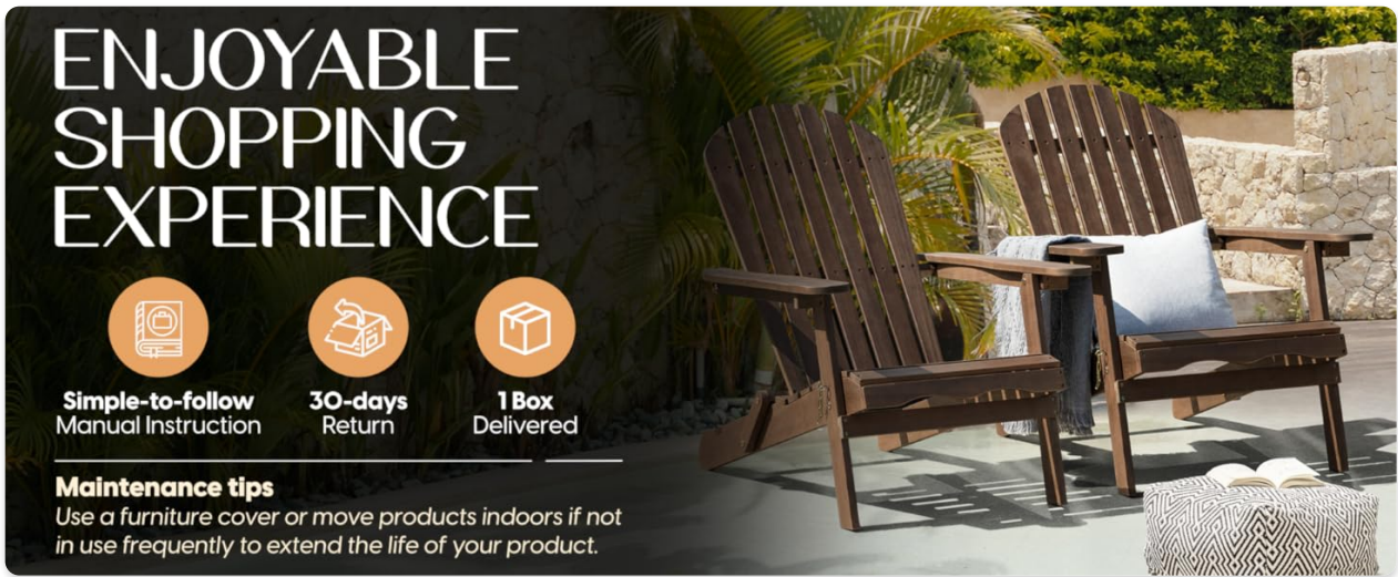
Image: A banner image that includes 'Maintenance tips' at the bottom, advising to use a furniture cover or move products indoors if not in use frequently to extend the life of the product.