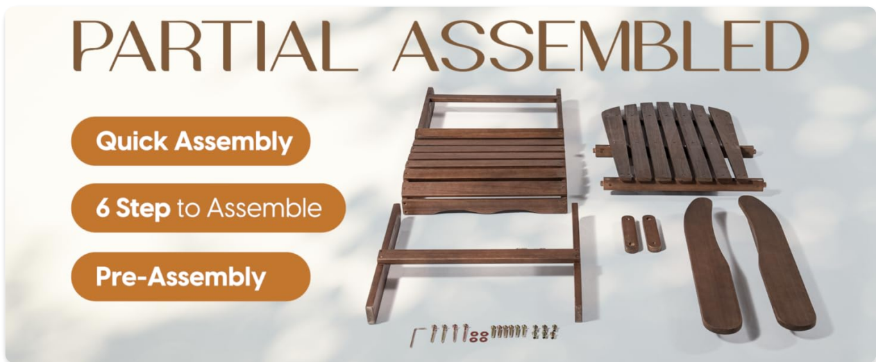
Image: A banner image illustrating the 'Partial Assembled' state of the IDZO Adirondack chair, showing components laid out with text indicating 'Quick Assembly,' '6 Step to Assemble,' and 'Pre-Assembly.' This image represents the typical contents and initial state of the product upon unboxing.