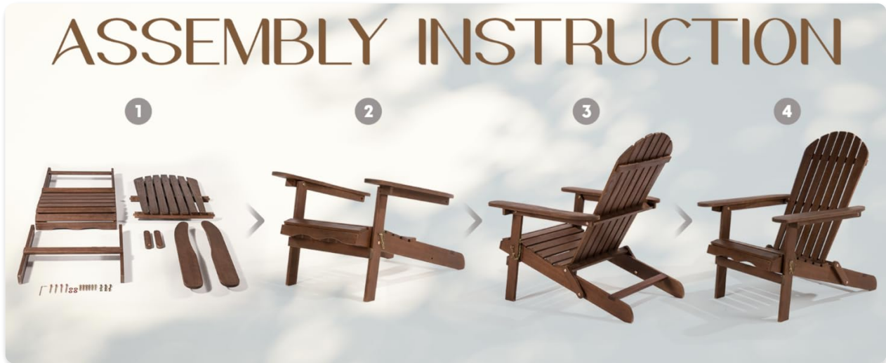
Image: A banner image providing a visual 'Assembly Instruction' in four steps, showing the progression from disassembled parts to a fully assembled IDZO Adirondack chair.