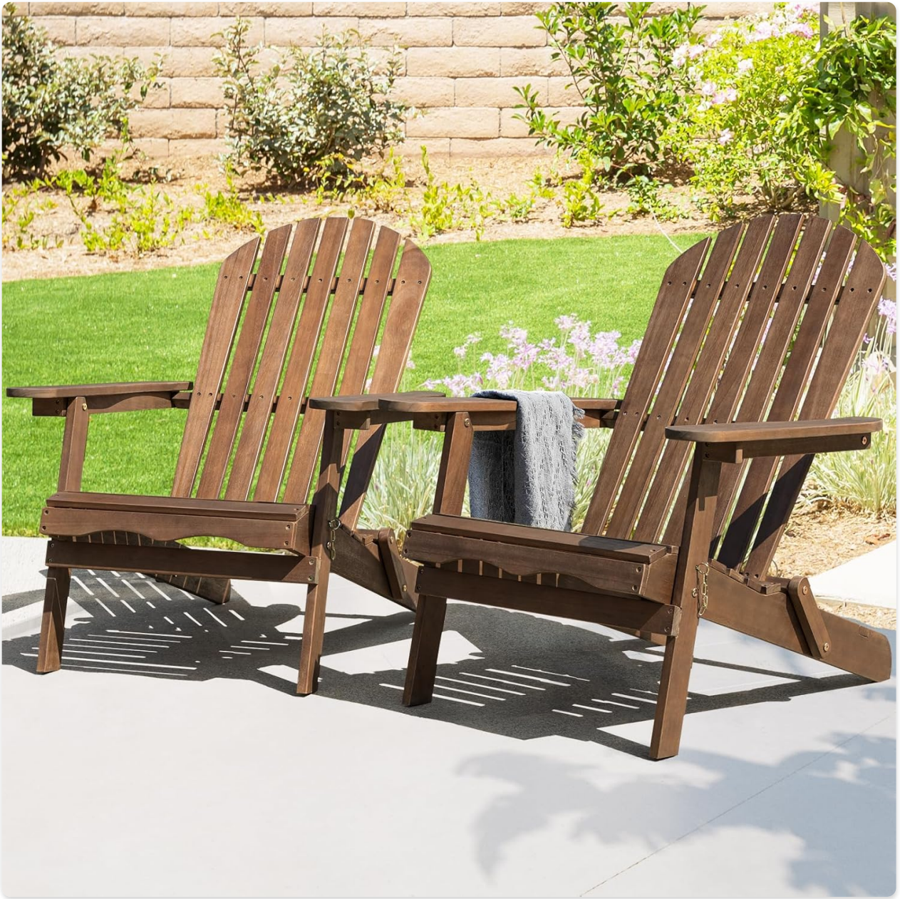
Image: Two IDZO Adirondack chairs in a natural wood finish, placed on a patio with a green lawn and garden in the background, showcasing their design and outdoor suitability.