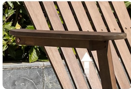
Raise the Seat

Image: Step-by-step visual guide demonstrating how to fold the IDZO Adirondack chair for space-saving storage, showing the chair in upright, partially folded, and fully folded positions.