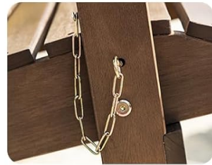
Image: Detailed images showing the folding mechanism of the IDZO Adirondack chair, specifically how to pull a bolt and raise the seat to initiate folding.