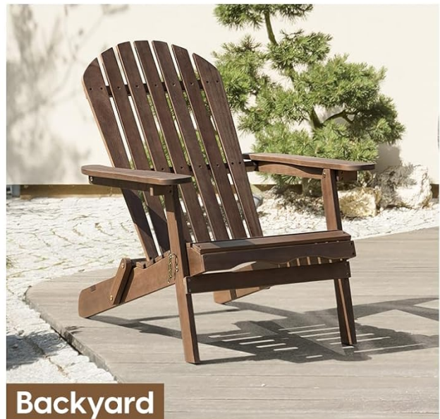
Image: A collage showing IDZO Adirondack chairs placed in different outdoor settings such as a firepit area, porch, indoor space, and backyard, illustrating their versatility.