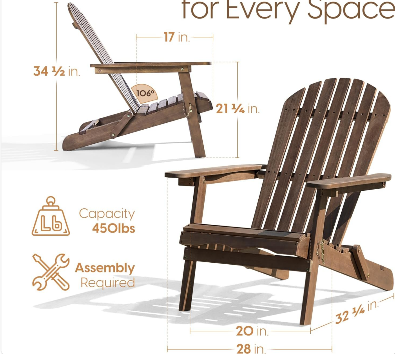
Image: Diagram showing the dimensions of the IDZO Adirondack chair, including height, width, depth, and seat angle, along with icons for 450 lbs capacity and assembly required.