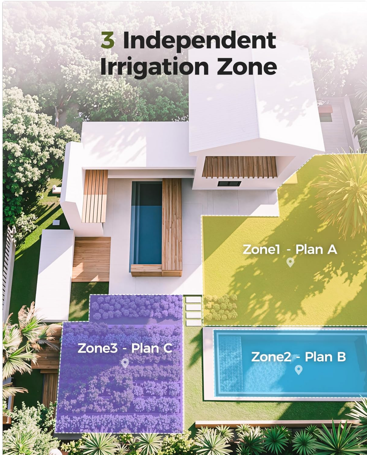
Image: An aerial view illustrating how the three independent irrigation zones can be used to water different areas of a garden or property, such as a lawn, pool area, and planted beds.

The Diivoo Sprinkler Timer allows for flexible programming across its three independent zones. Each zone can be customized with its own start time, watering duration, and frequency.