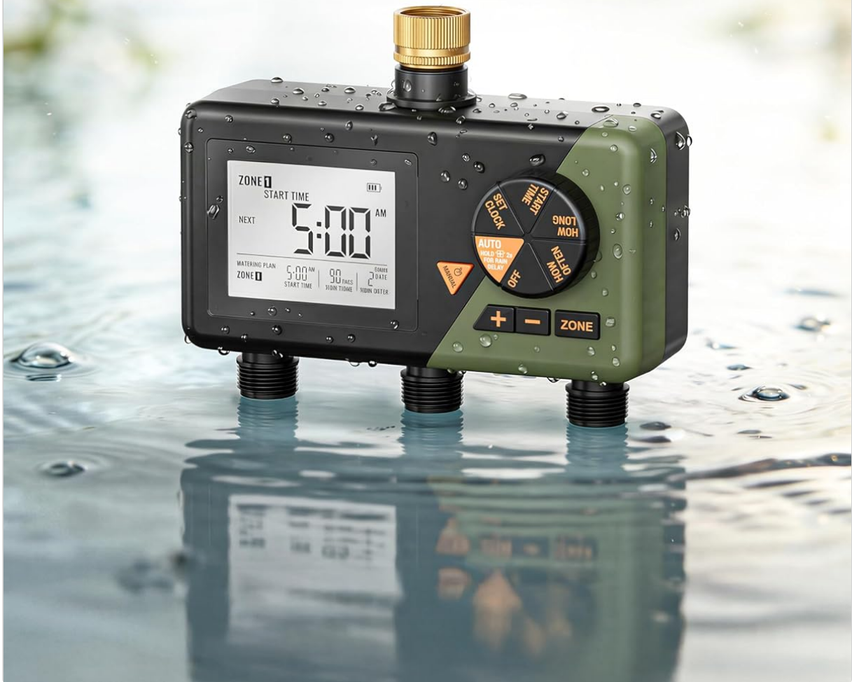
Image: The timer's display indicating a 2-day rain delay, allowing users to pause watering during periods of natural rainfall.