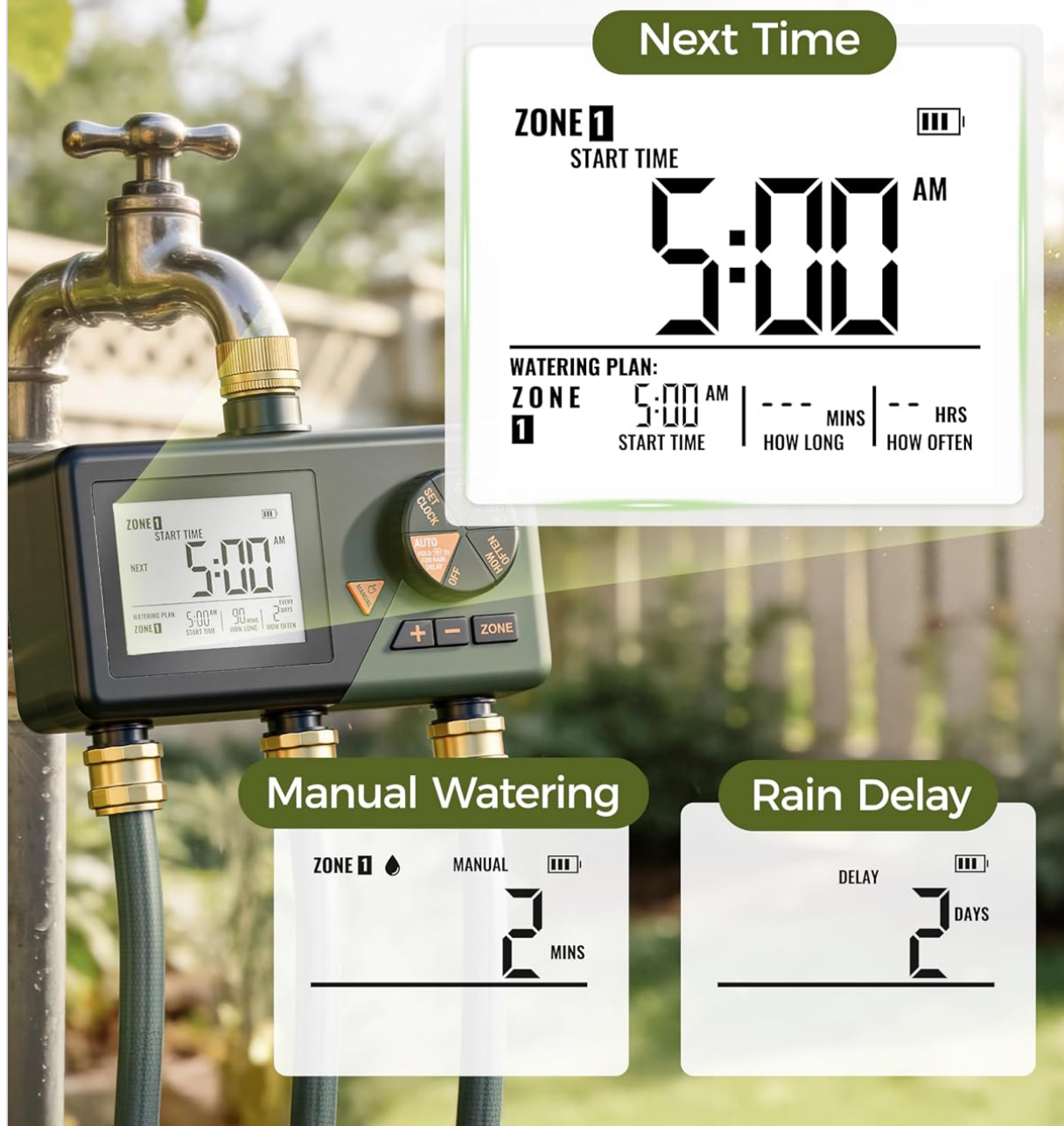
Image: The timer's display showing a comprehensive watering plan, including the next start time, duration, and frequency for a selected zone.