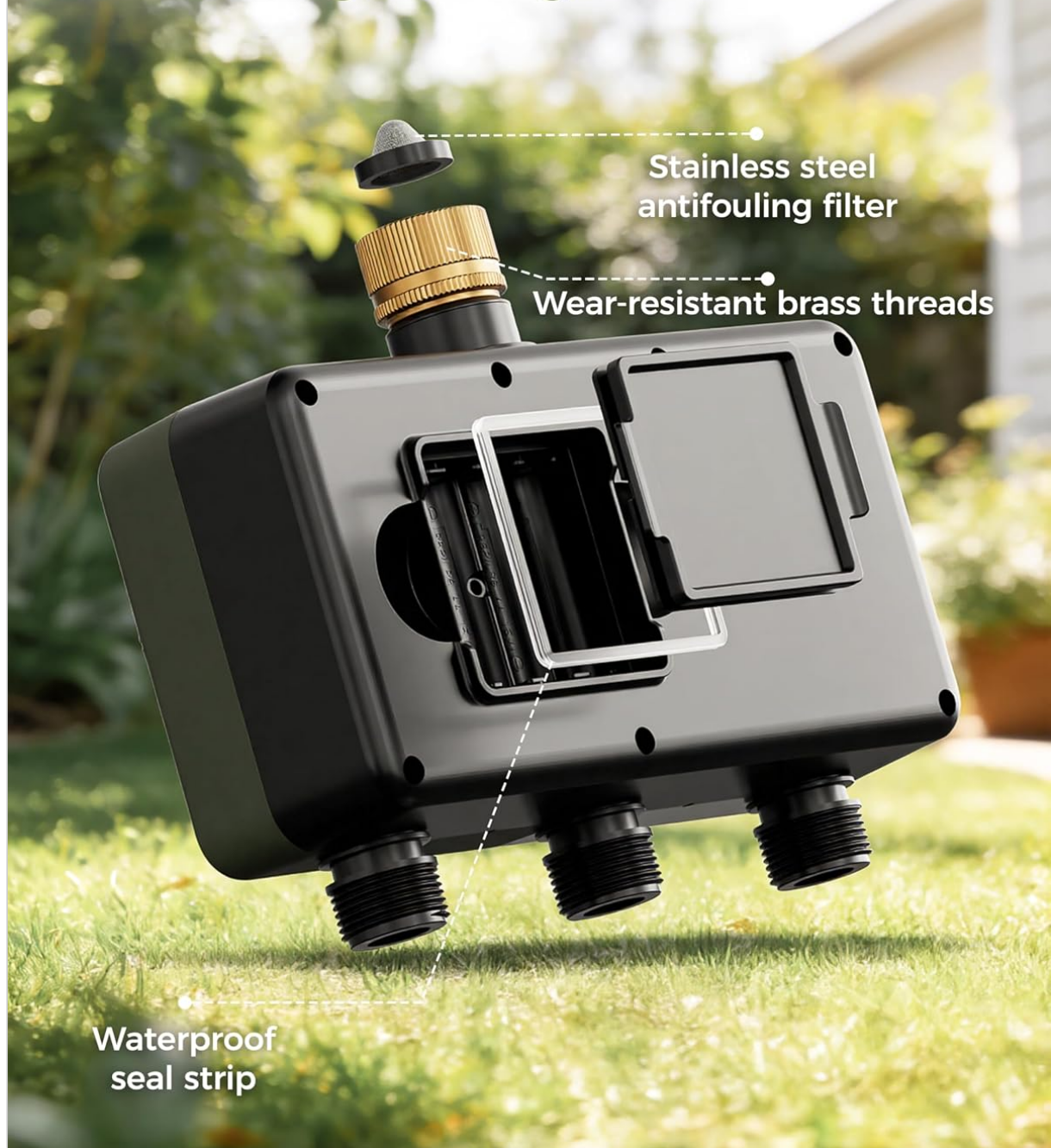
Image: The Diivoo Sprinkler Timer with its battery compartment open, illustrating the correct placement of AA batteries. Ensure the compartment is sealed properly after installation.