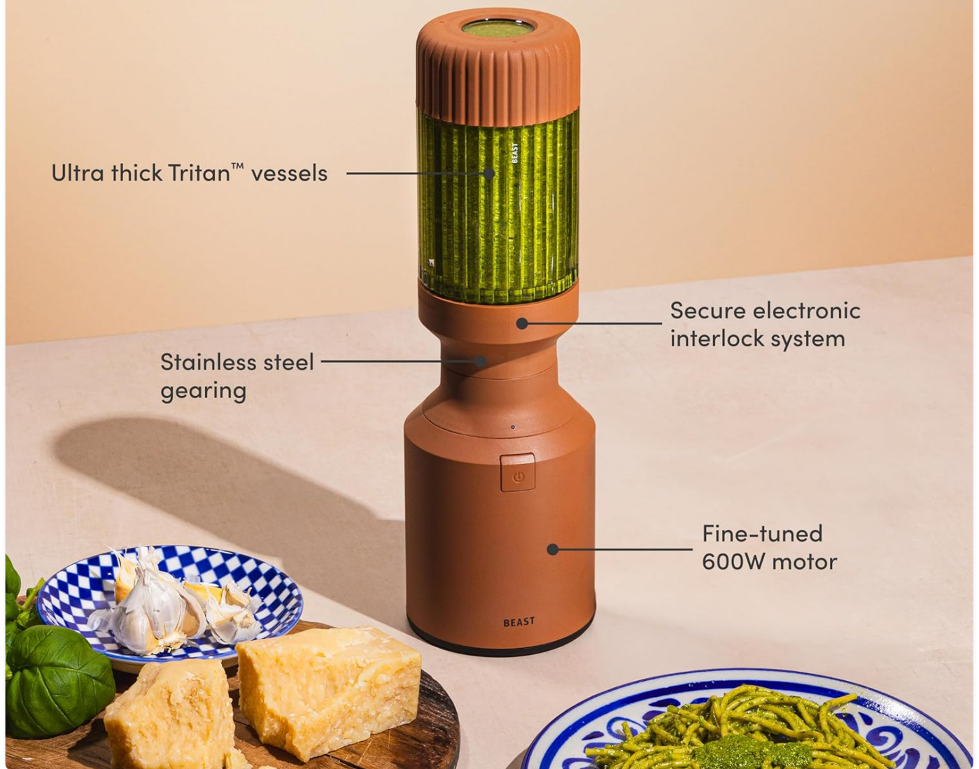
Image: High-quality components like Tritan vessels and a 600W motor ensure efficient and smooth blending for various ingredients.