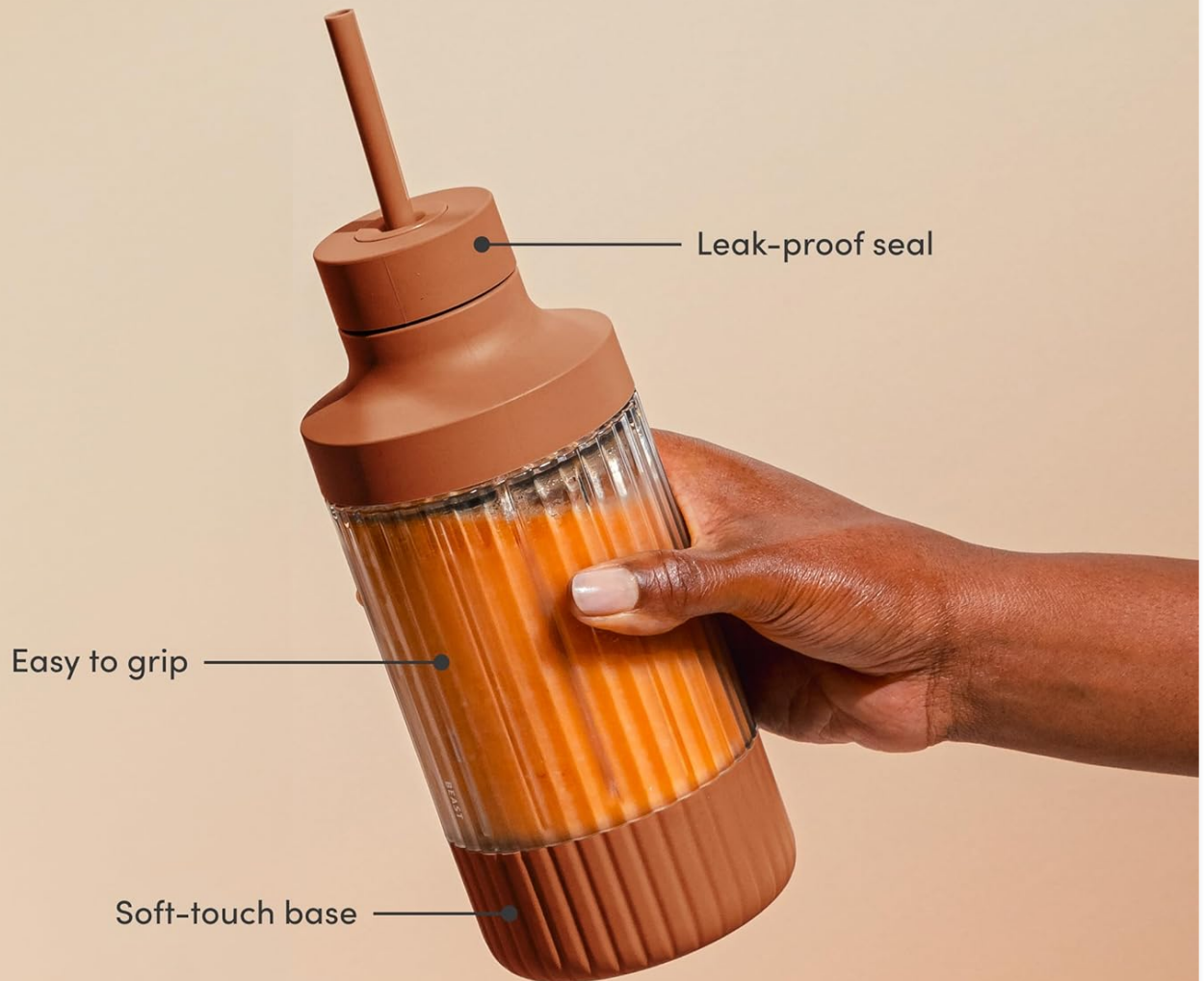
Image: The Blend-Sip-Go feature allows for convenient consumption directly from the blending vessel using the straw cap.