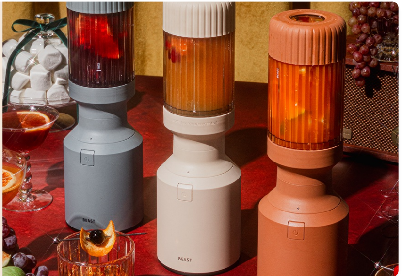
Image: The versatile design of the BEAST Mini Blender allows for a variety of culinary creations.

You wouldn't believe just how many recipes the Mini can do.