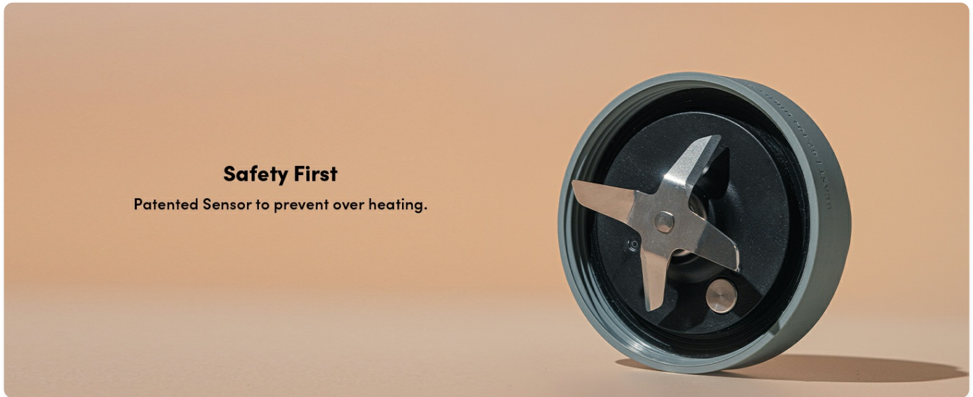
Image: The blade assembly features a patented sensor designed to prevent overheating, enhancing user safety.