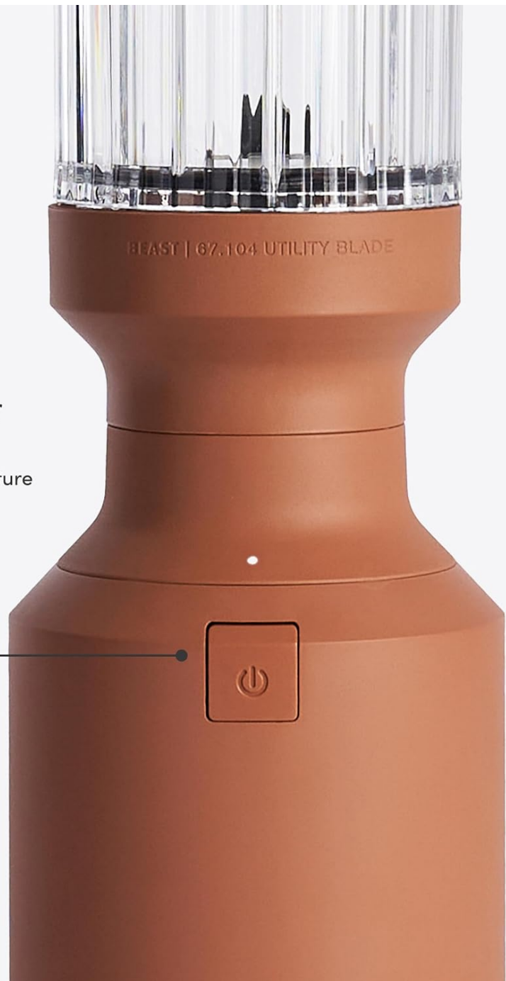
Image: Detail of the power button, which controls both pulse and continuous blending functions.

*Automatic stop-and-go for optimal texture