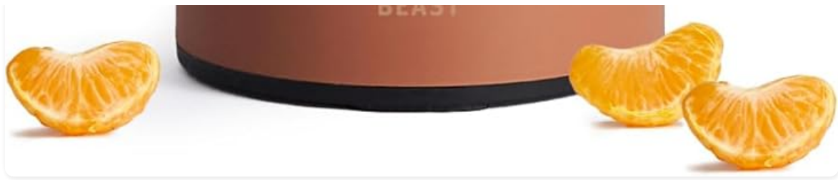
Image: The BEAST Mini Blender (Terra) assembled and ready to blend, showcasing its sleek design.