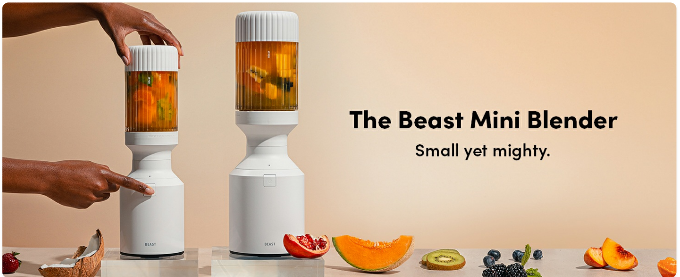
Image: The BEAST Mini Blender is designed for compact and powerful blending, available in various colors including Terra and Cloud White.

This manual provides essential information for the safe and efficient operation of your BEAST Mini Blender. Please read all instructions carefully before first use and retain for future reference.