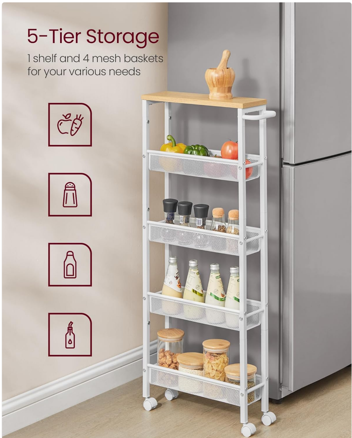
Image: A detailed view of the cart's five tiers, showcasing how different items, from spices to larger jars, can be organized within its mesh baskets and top shelf.