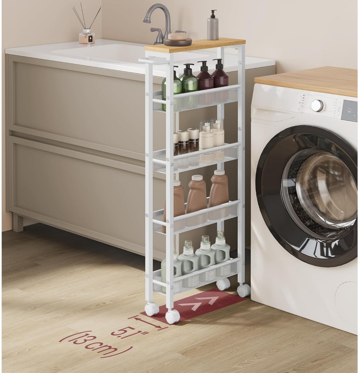
Image: The slim rolling cart demonstrating its ability to fit into a narrow gap, highlighting its practical design for maximizing storage in tight areas.

Makes use of narrow spaces with a compact structure