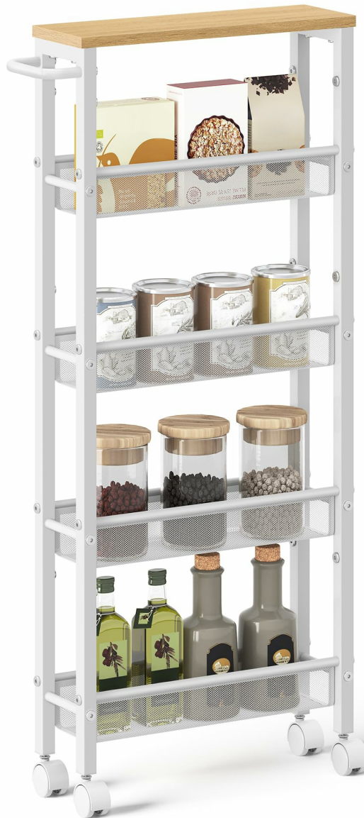
Image: The VASAGLE Slim 5-Tier Rolling Storage Cart, featuring an oak beige top and classic white frame, neatly fits into a narrow kitchen space, providing additional storage.