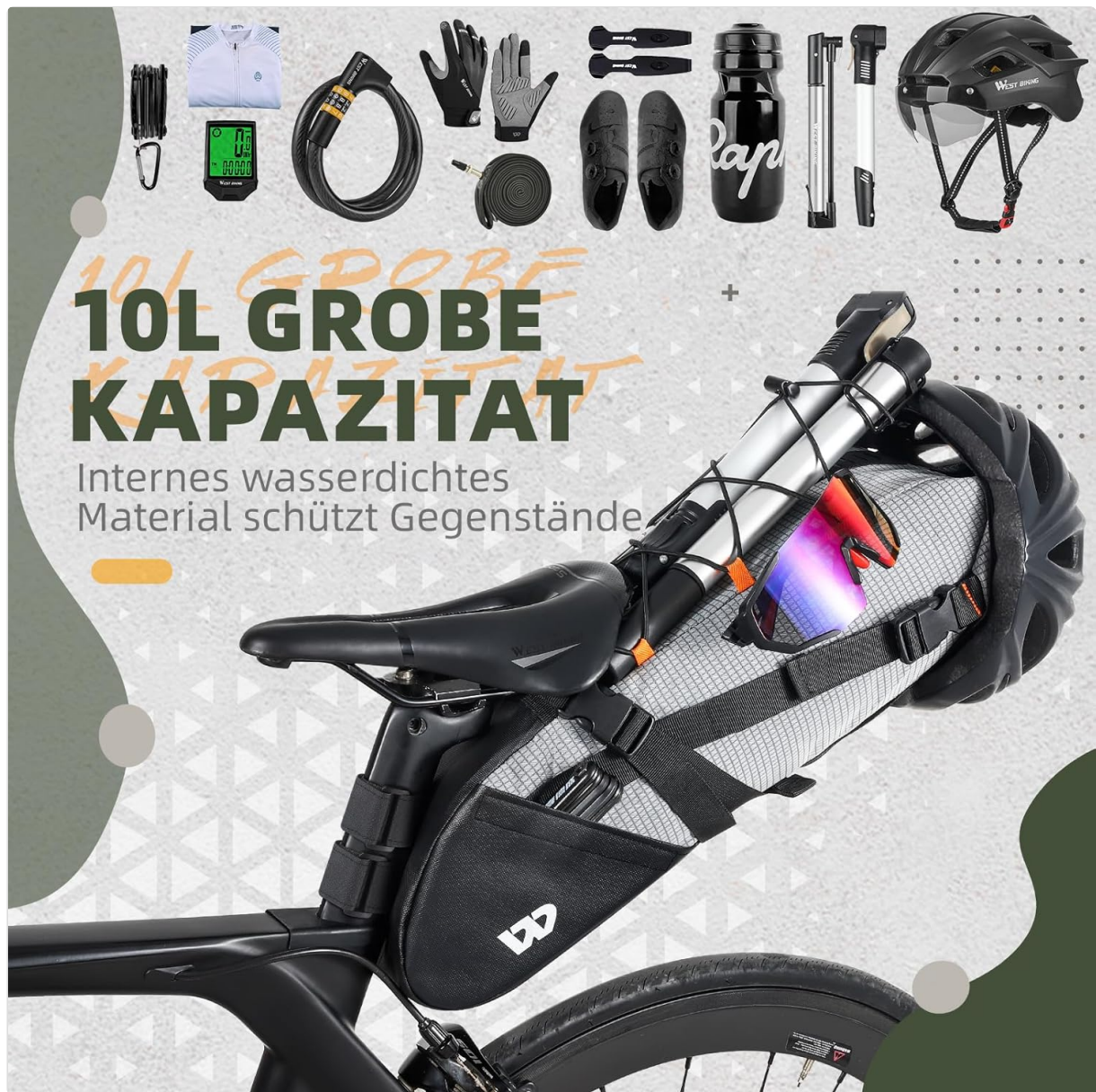
Image: The 10L saddle bag shown with various cycling essentials like a helmet, pump, water bottle, and clothing, illustrating its large storage capacity.