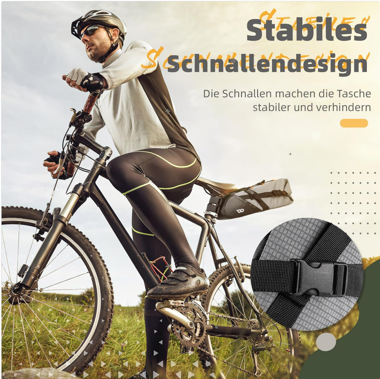
Image: Close-up of the stable buckle design, demonstrating how the buckles secure the bag to the bicycle for enhanced stability.