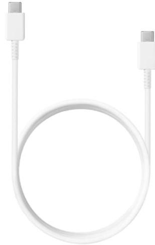
Data cable (C to C)