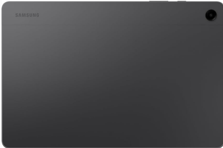
Galaxy Tab A9+ 5G