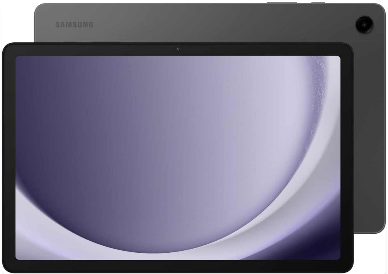
Figure 2: Front and rear views of the Samsung Galaxy Tab A9+ 5G. The front features the 11-inch display and front camera, while the rear shows the main camera and Samsung branding.

Front Camera: Located at the top center when held horizontally, used for video calls and selfies.