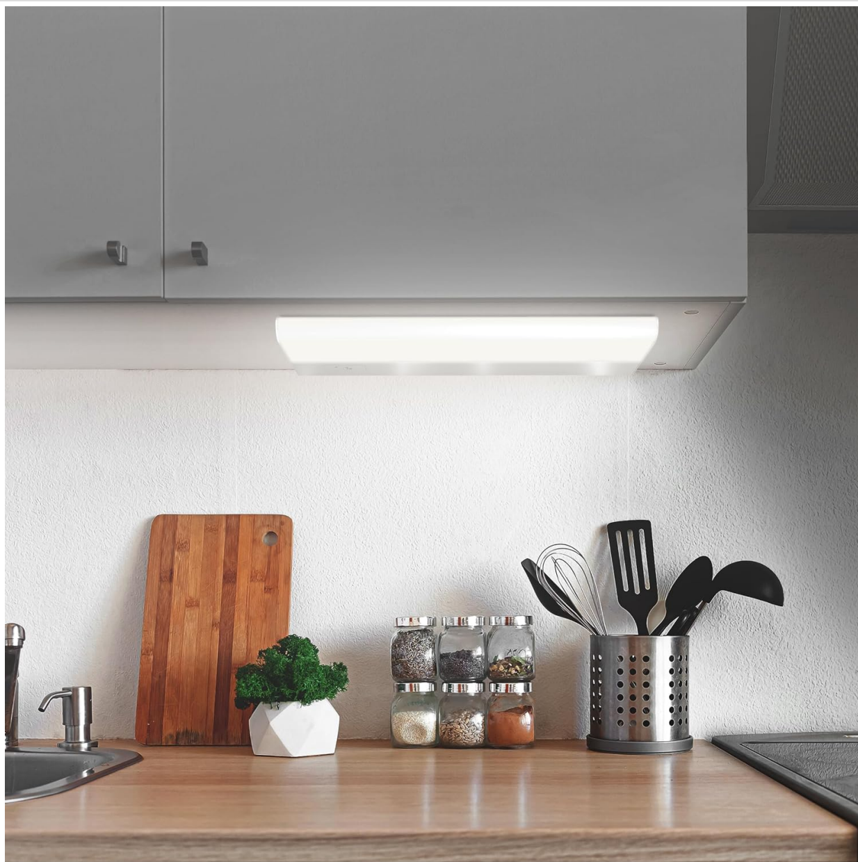
Figure 3.1: The under cabinet light installed in a kitchen setting.