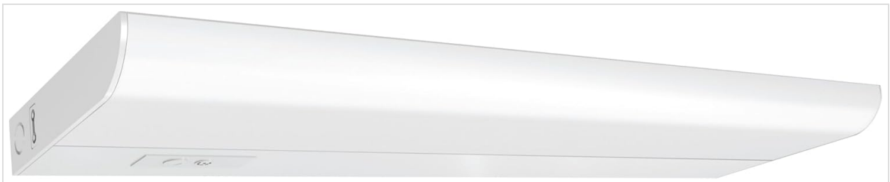
Figure 1.1: Feit Electric UCL24/CCTCA/AG Under Cabinet Light.

The Feit Electric UCL24/CCTCA/AG Under Cabinet Lighting fixture is a smart LED light designed to enhance your kitchen or workspace. This 20-watt fixture features integrated LEDs, eliminating the need for bulb replacements. It provides bright 1500-lumen light and offers a tunable white feature, allowing you to select color temperatures from 2700K (soft white) to 6500K (daylight). Control is versatile, with options including a button on the fixture, an included remote control, the Feit Electric mobile app, and voice commands via Google Home and Alexa. Its ultra-slim, low-profile design ensures even light distribution and seamless integration. With a high 90+ Color Rendering Index (CRI), colors appear more vibrant and natural. This energy-efficient light is designed for long-term use, with an average lifespan of 25,000 hours (approximately 22.8 years). It can be powered by plugging into a standard outlet or by direct hardwiring.