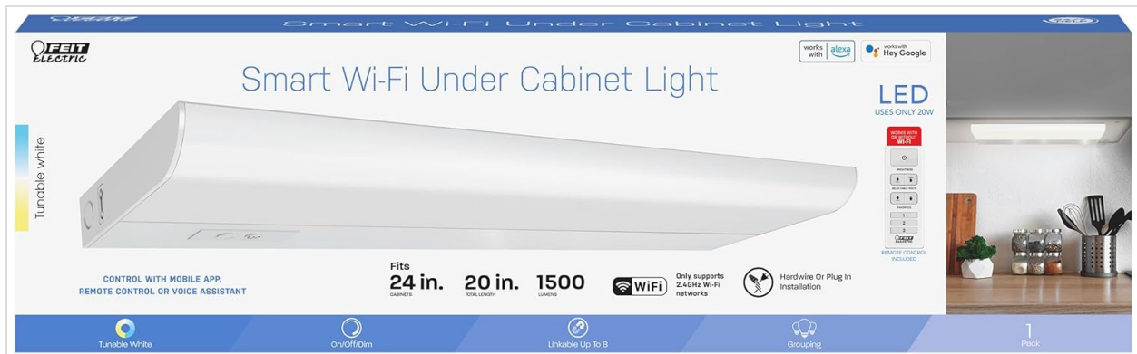
Figure 2.1: Overview of smart features and specifications.