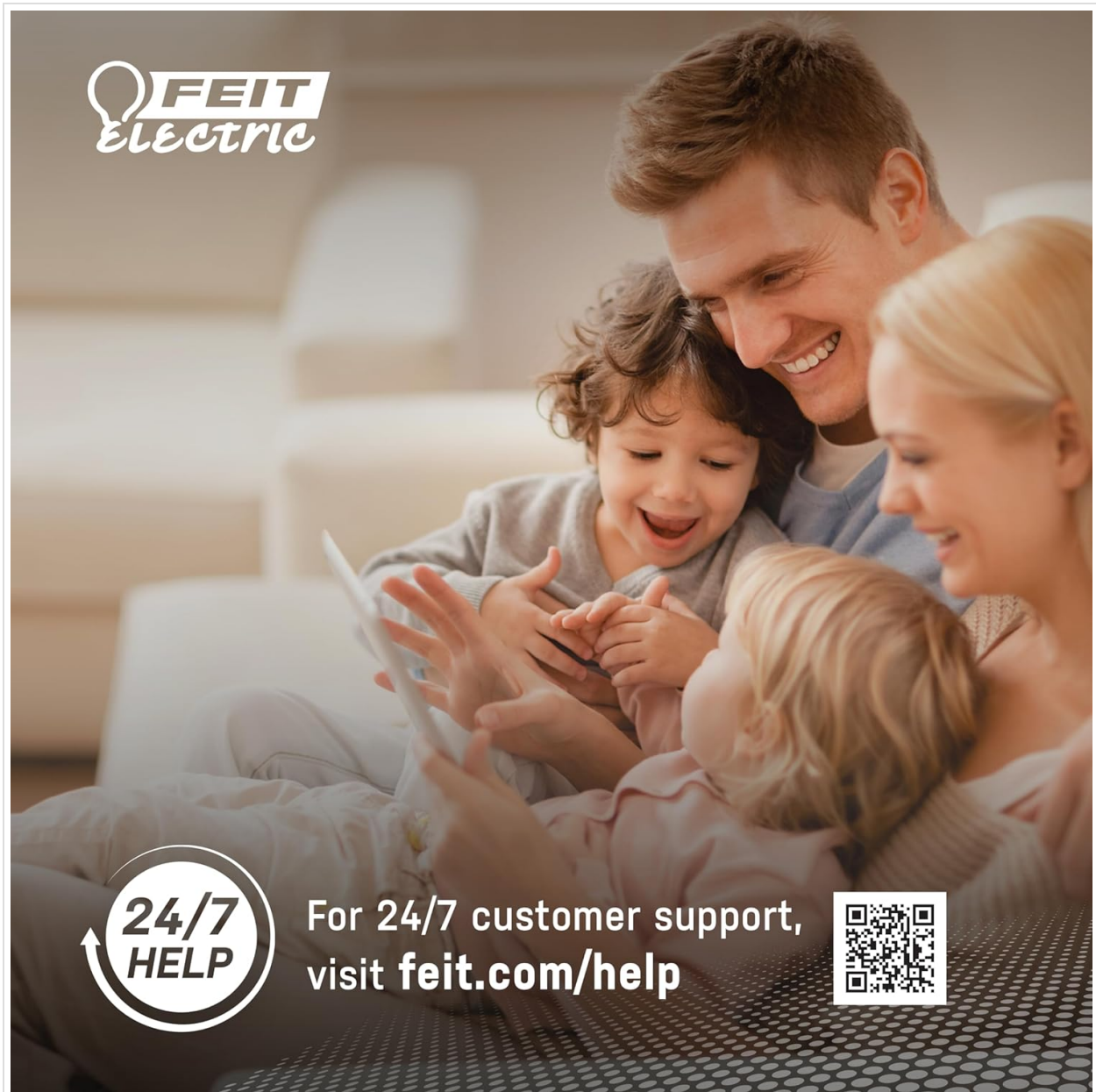
Figure 9.1: Feit Electric customer support contact information.