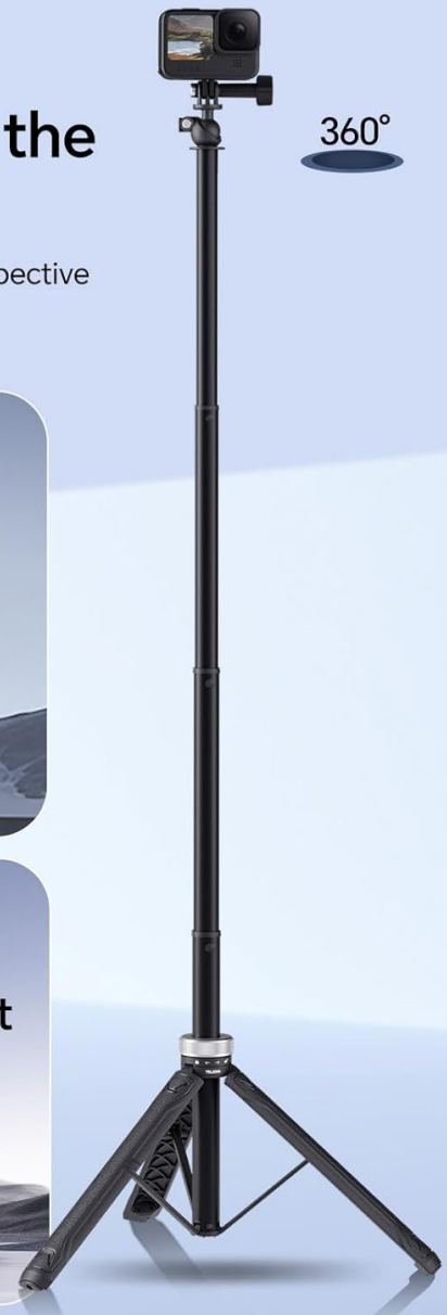
Figure 2: The 360° ball head allows for flexible camera positioning.

Horizontal 360° rotation, Adjust your seat at will.