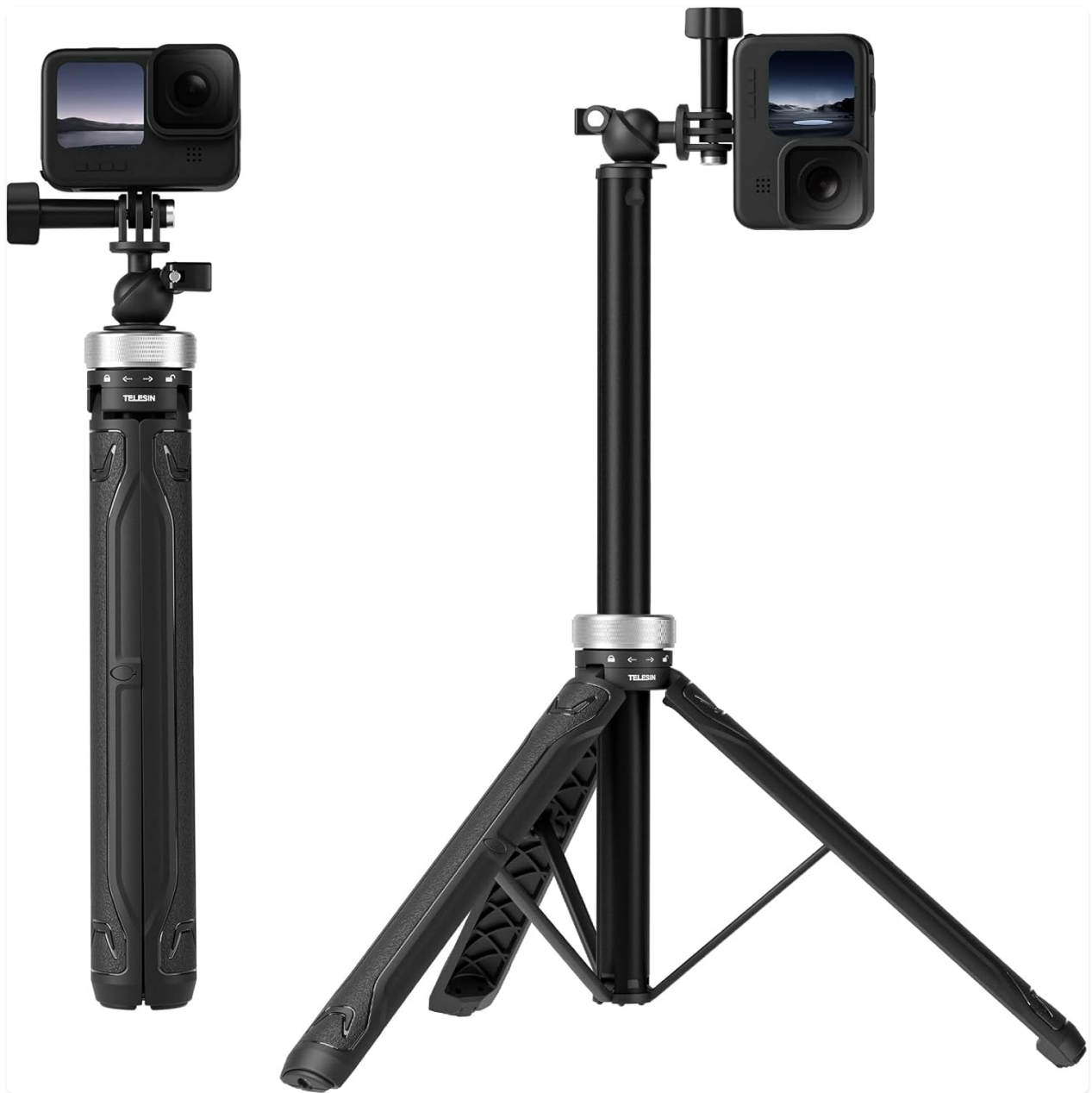
Figure 1: TELESIN Selfie Stick Tripod in various configurations.