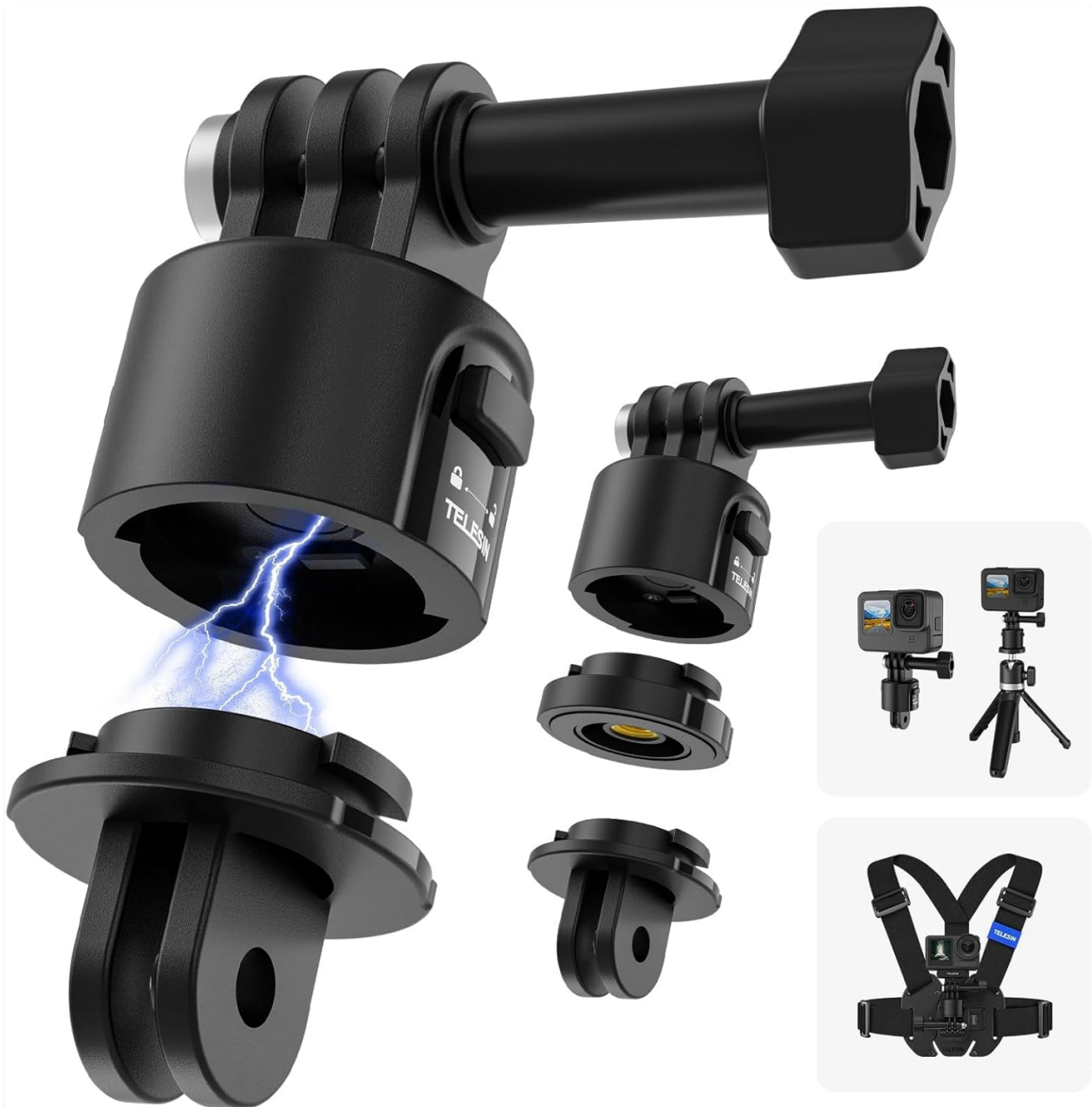
Figure 3: The quick release mount and 1/4 inch adapter for camera attachment.