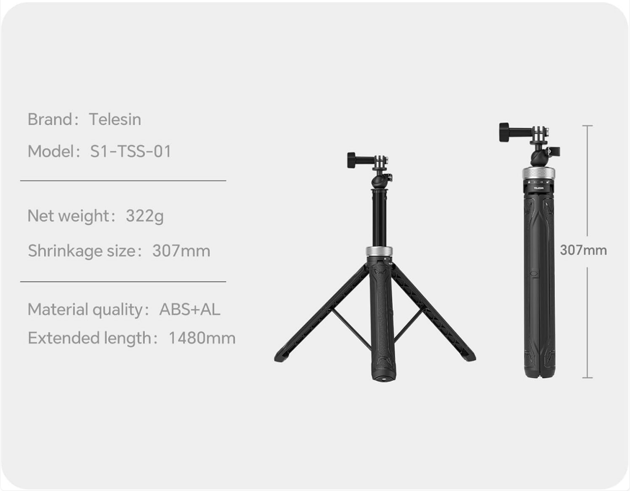
Figure 5: Detailed product parameters and dimensions.