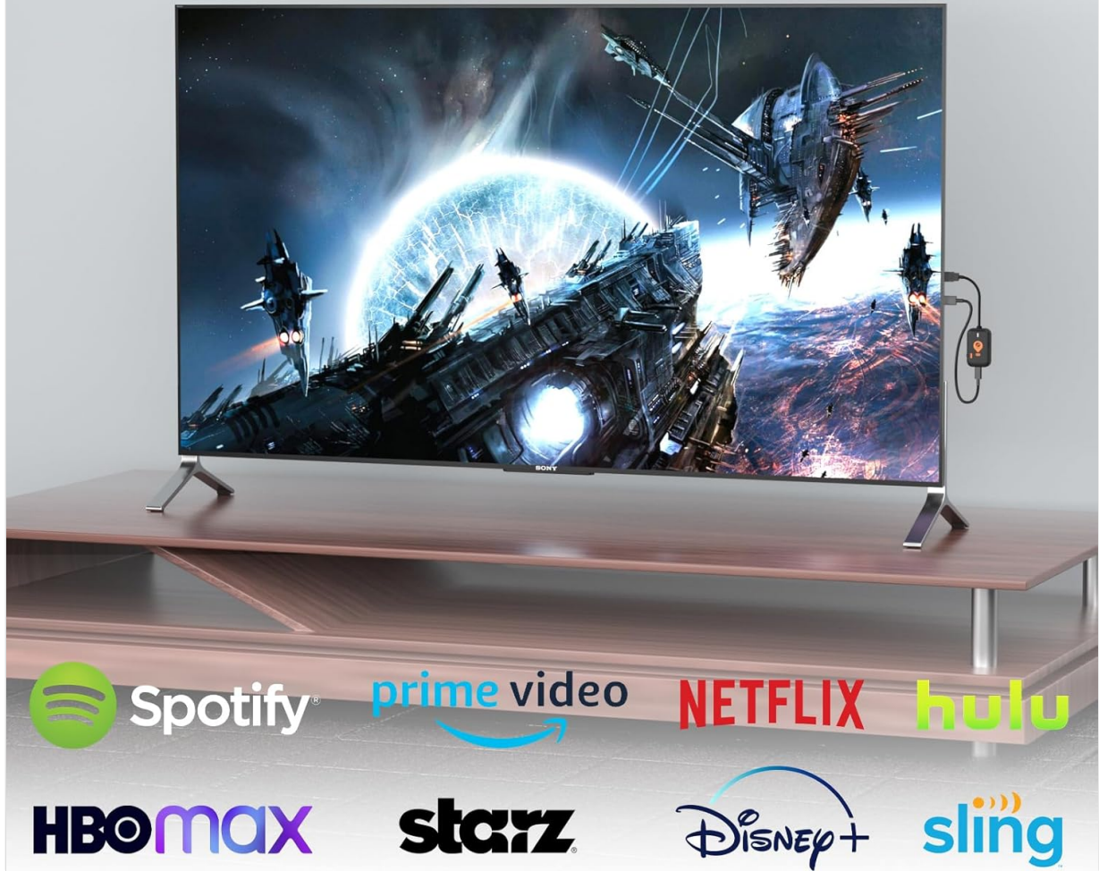
Image: A television screen showing vibrant HD content, demonstrating the device's ability to stream 1920*1080P@60Hz clear image quality, compatible with various video apps.

Enjoy your favorite live movies on a big screen with 1920*1080P@60Hz clear image, support all video apps