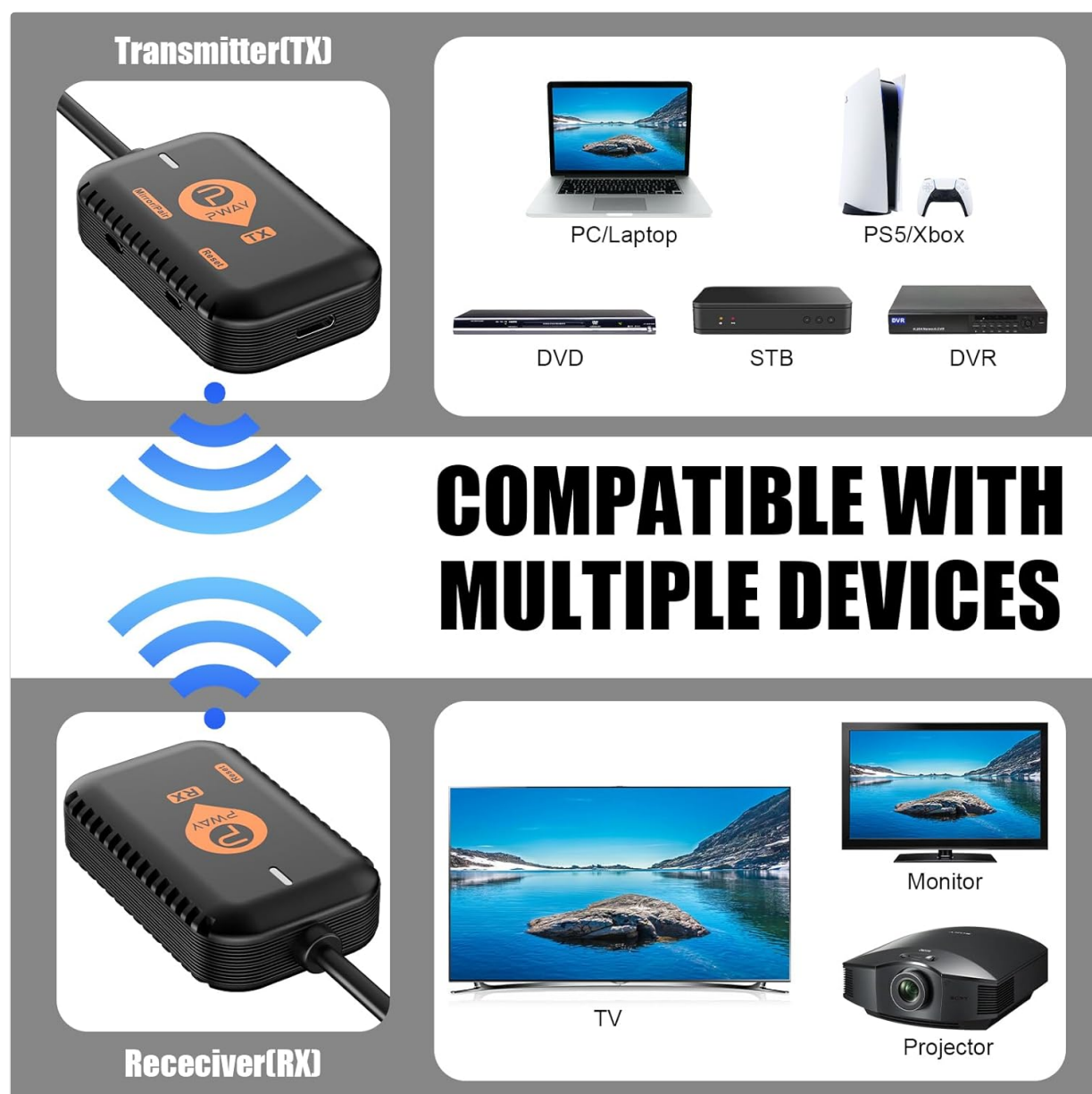
Image: Illustration of the PWAY Wireless HDMI Extender's compatibility with multiple source devices (PC, Laptop, PS5, Xbox, DVD, STB, DVR) and display devices (TV, Monitor, Projector).