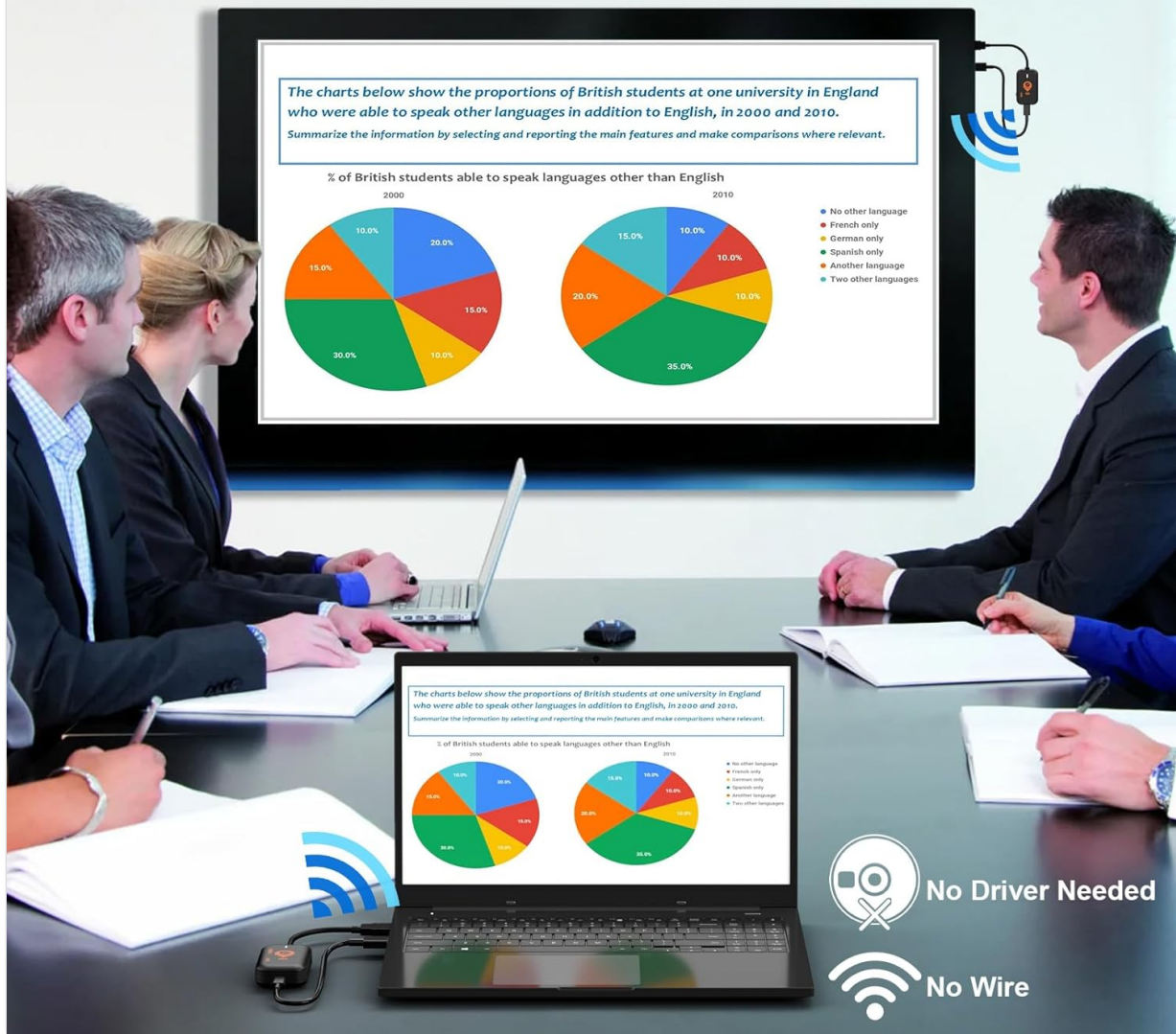
Image: A visual representation of the plug-and-play setup, showing a laptop wirelessly transmitting to a large screen, emphasizing no app, no driver, and no wire requirements.

Auto Pairing & Stream, No Need App or Bluetooth