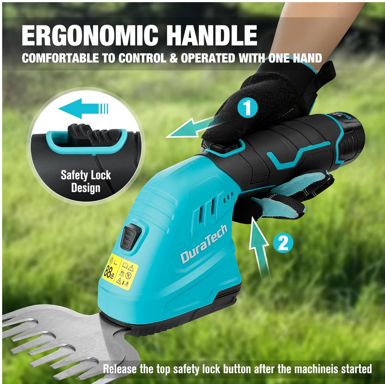
Image: Visual representation of the dual safety lock mechanism, indicating the two steps to activate the trimmer.