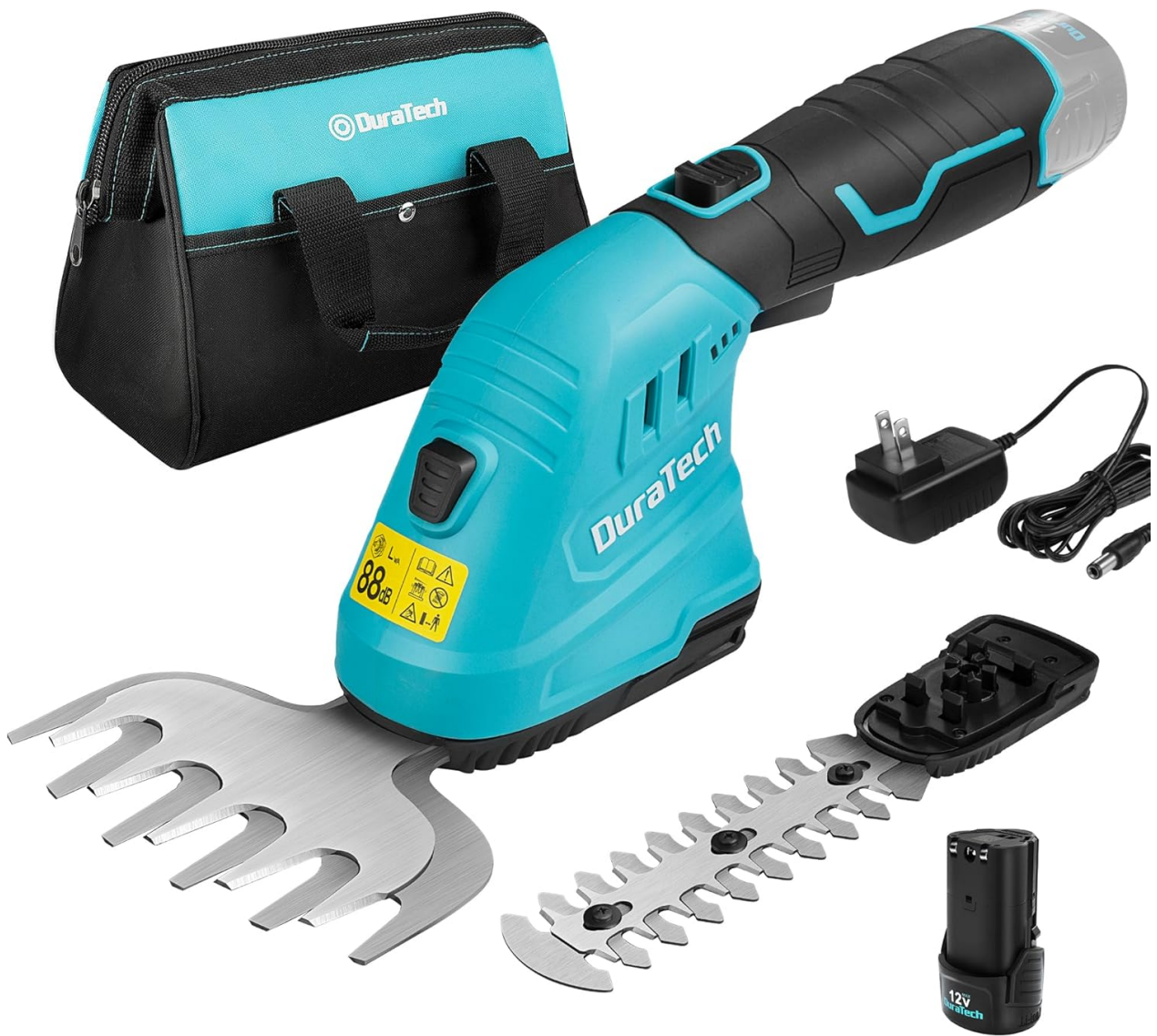
Image: The complete package including the main unit, two interchangeable blades, battery, charger, and storage bag.