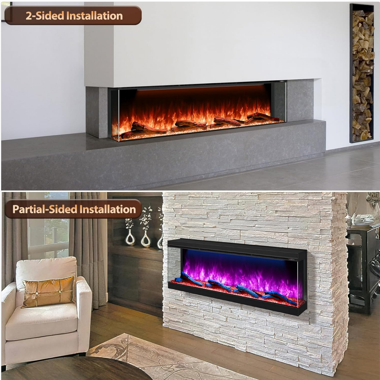
Figure 4.1: Examples of 2-Sided and Partial-Sided Installation