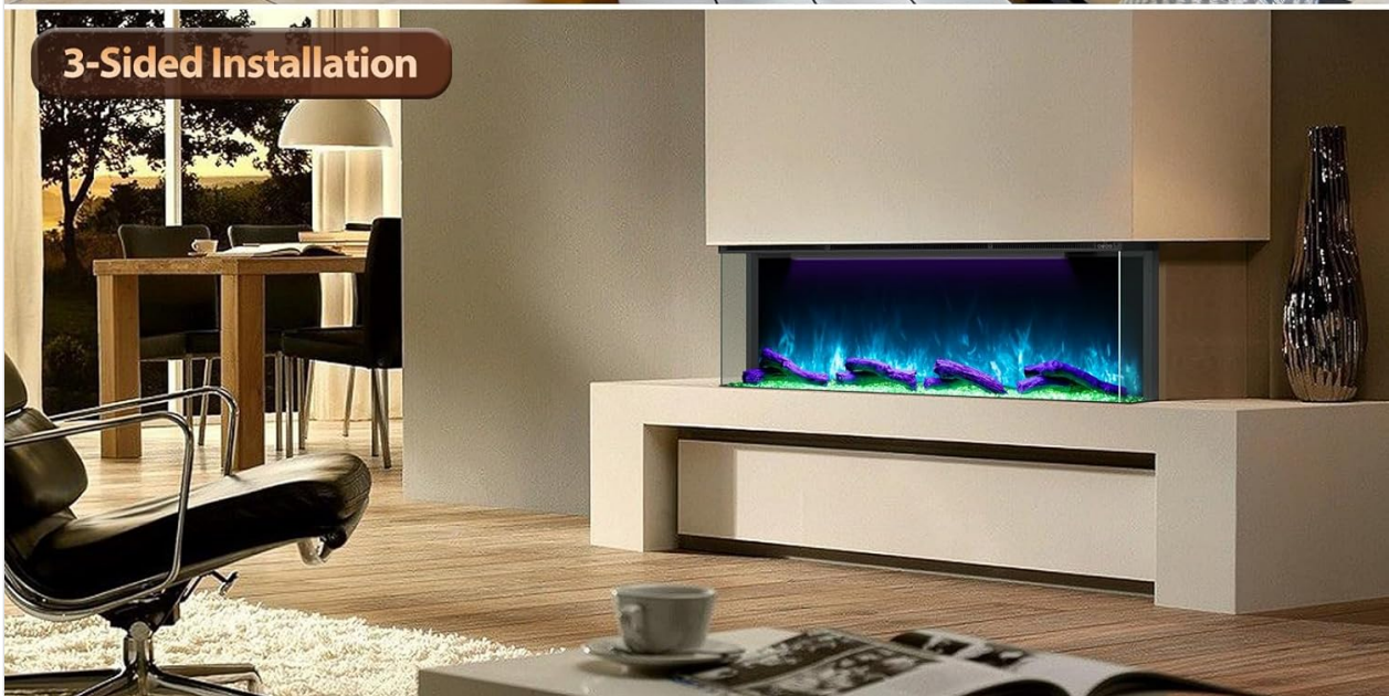
Figure 4.2: Examples of Single-Sided and 3-Sided Installation