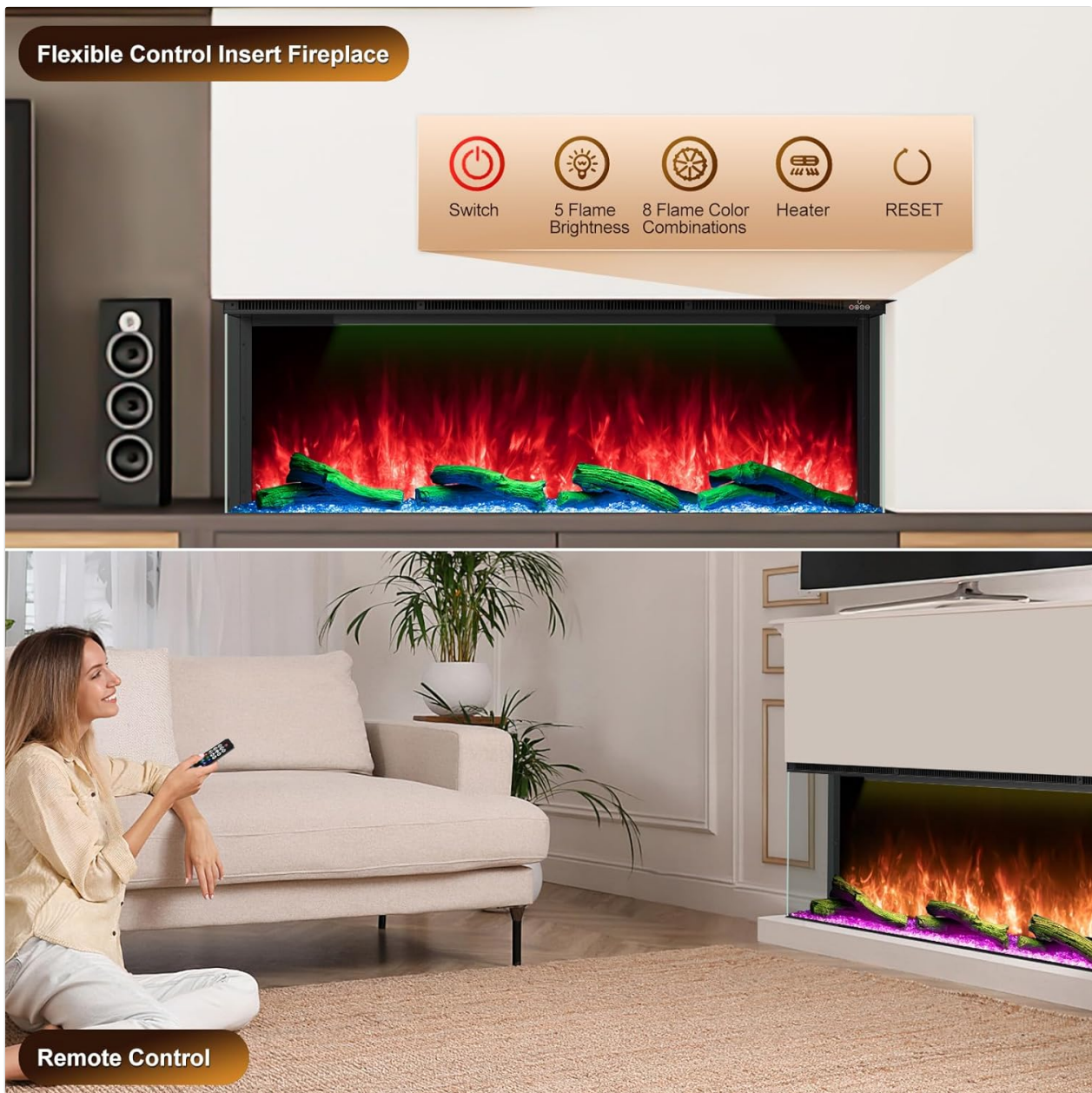
Figure 5.1: Fireplace Control Panel and Remote Control