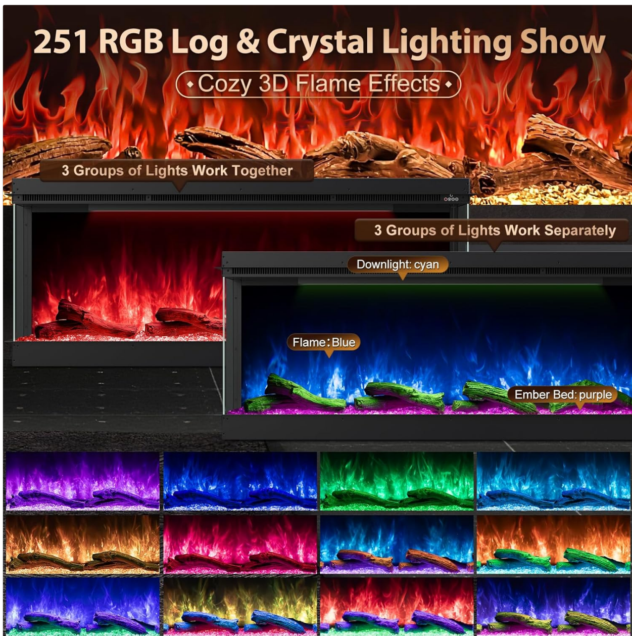
Figure 5.2: 251 RGB Log & Crystal Lighting Options