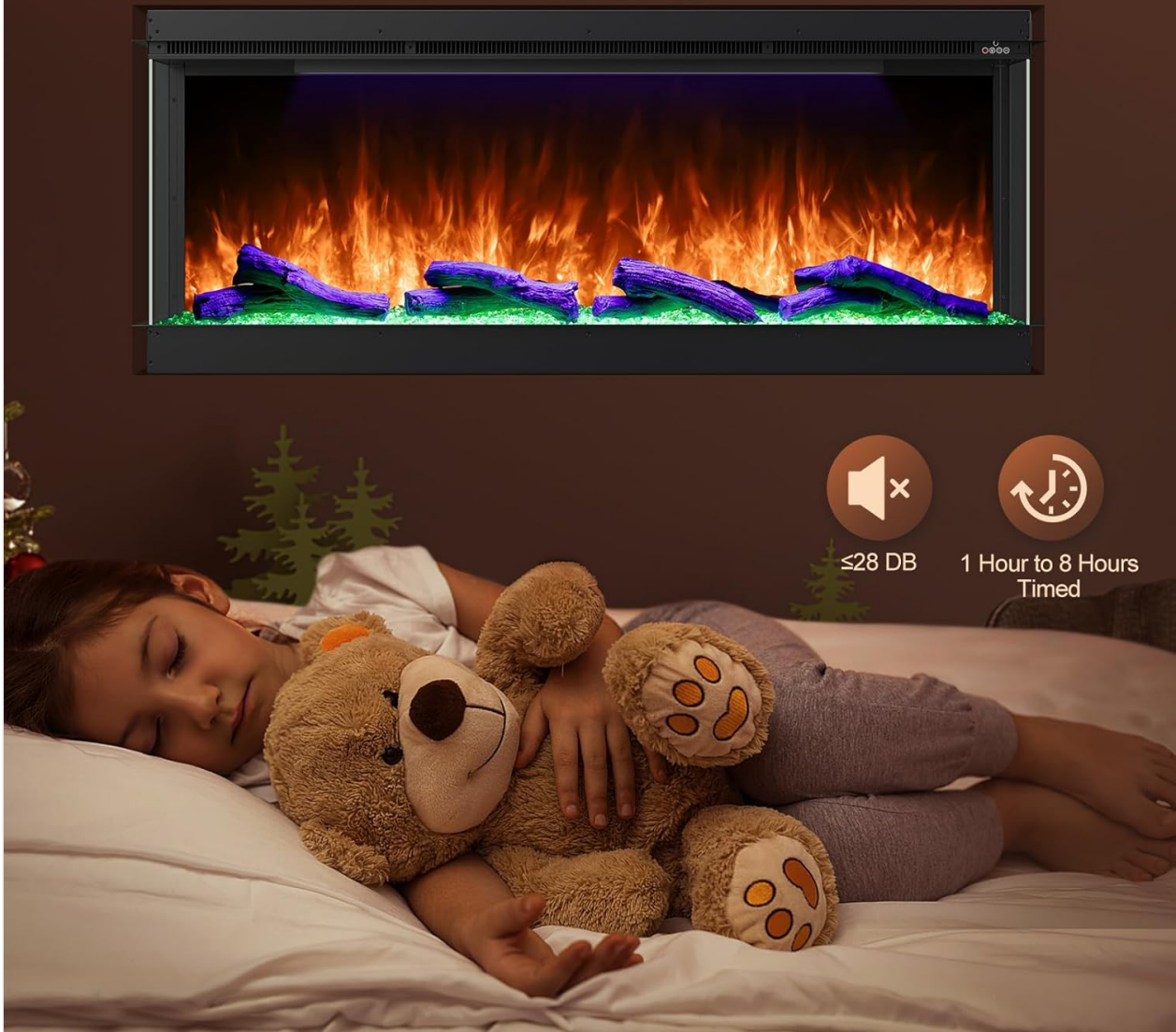
Figure 5.3: Quiet Heating and Smart Timer Features