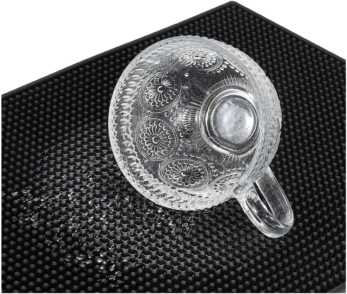
Image demonstrating the spill-proof design of the mat, with a glass placed on its textured surface and liquid droplets contained within the mat's raised nubs.