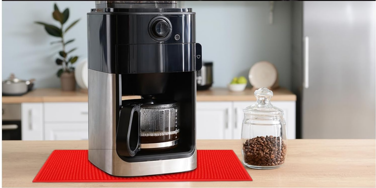
Image depicting the mat in use in a bar setting, holding a drink, and in a kitchen setting under a coffee machine. Note: The mat shown in the kitchen is red, but the product described is black.