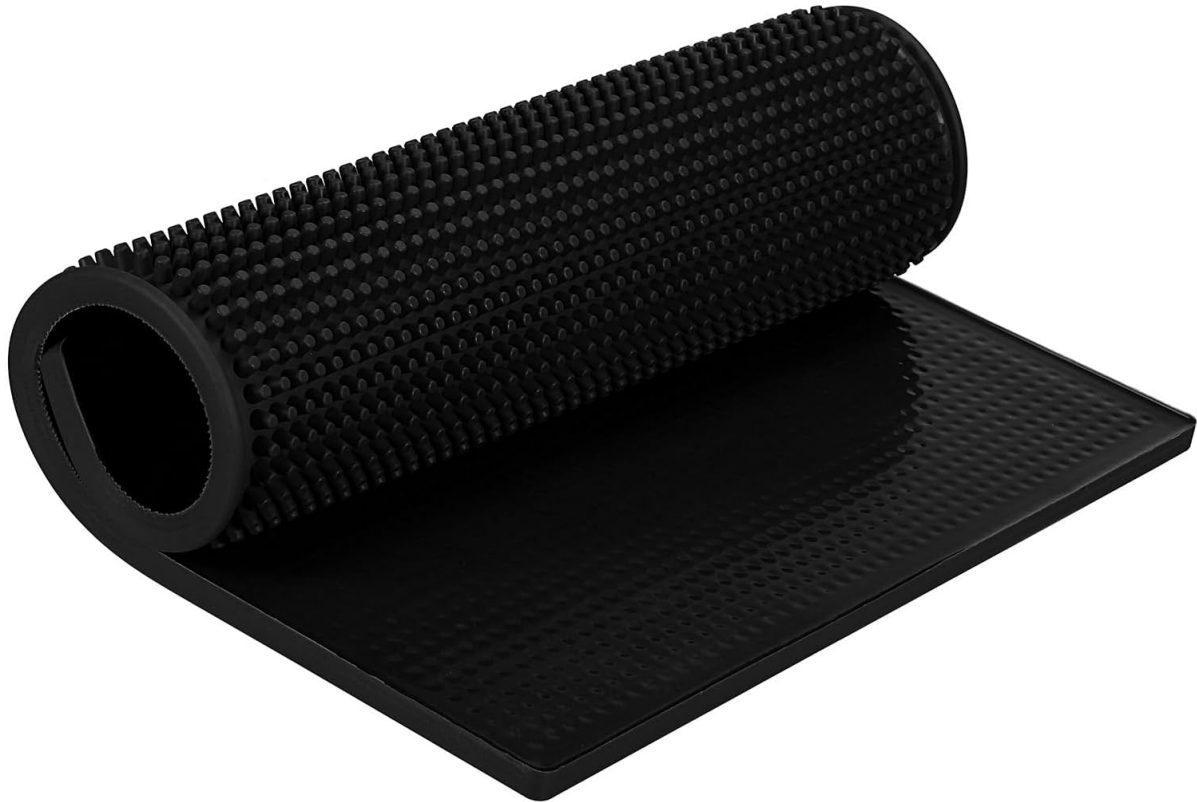
Image illustrating the flexible and soft PVC material of the mat, with a view of its anti-slip back surface, which is smooth and easy to clean.

• Anti-slip Back is Smooth and Easy To Clean