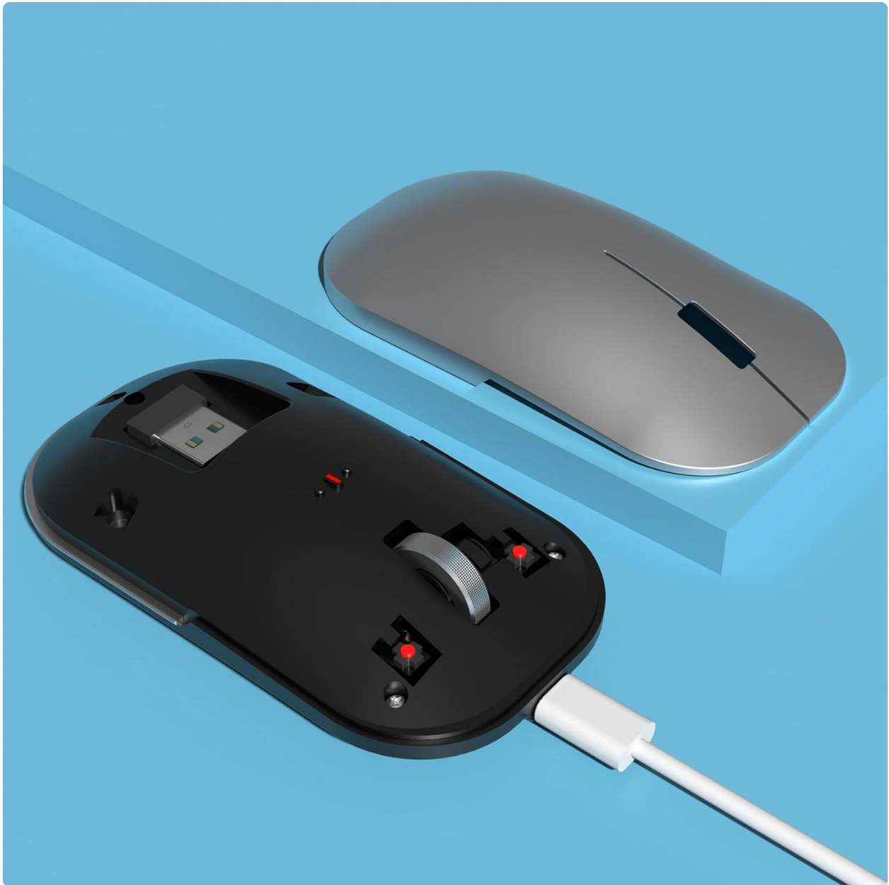
Image: The underside of the mouse, revealing the storage compartment for the USB receiver and the charging port.