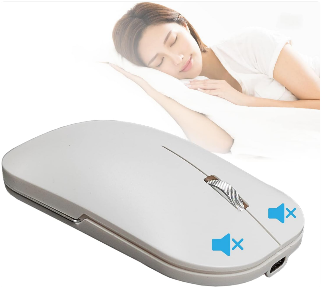
Image: The white mouse with visual cues indicating its silent click functionality.