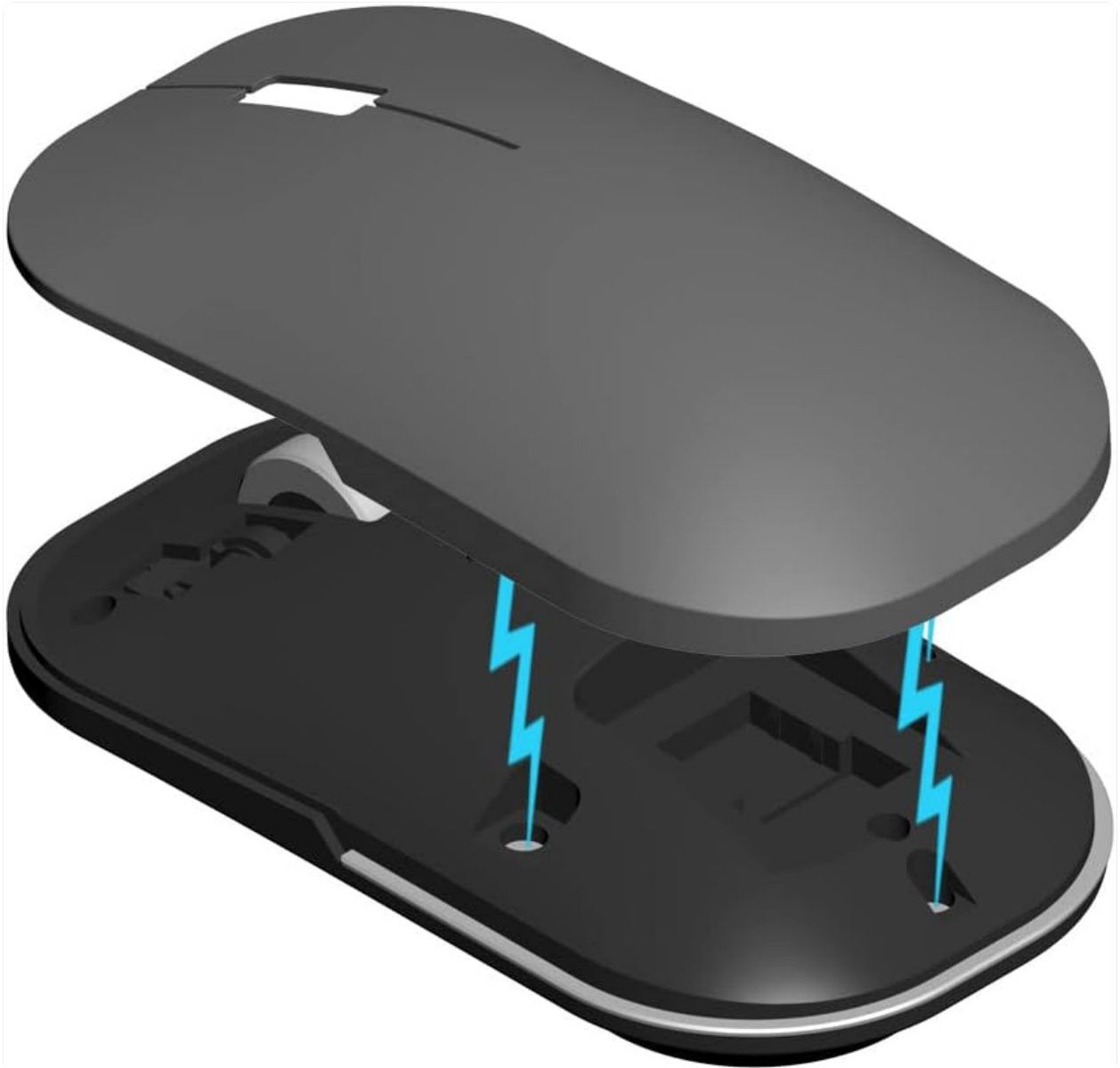
Image: An illustration demonstrating the magnetic top cover of the mouse, which provides access to the USB receiver.