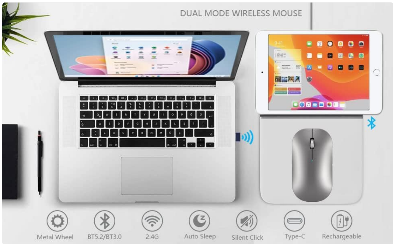
Image: The mouse demonstrating dual-mode connectivity, simultaneously used with a laptop (2.4G) and an iPad (Bluetooth).