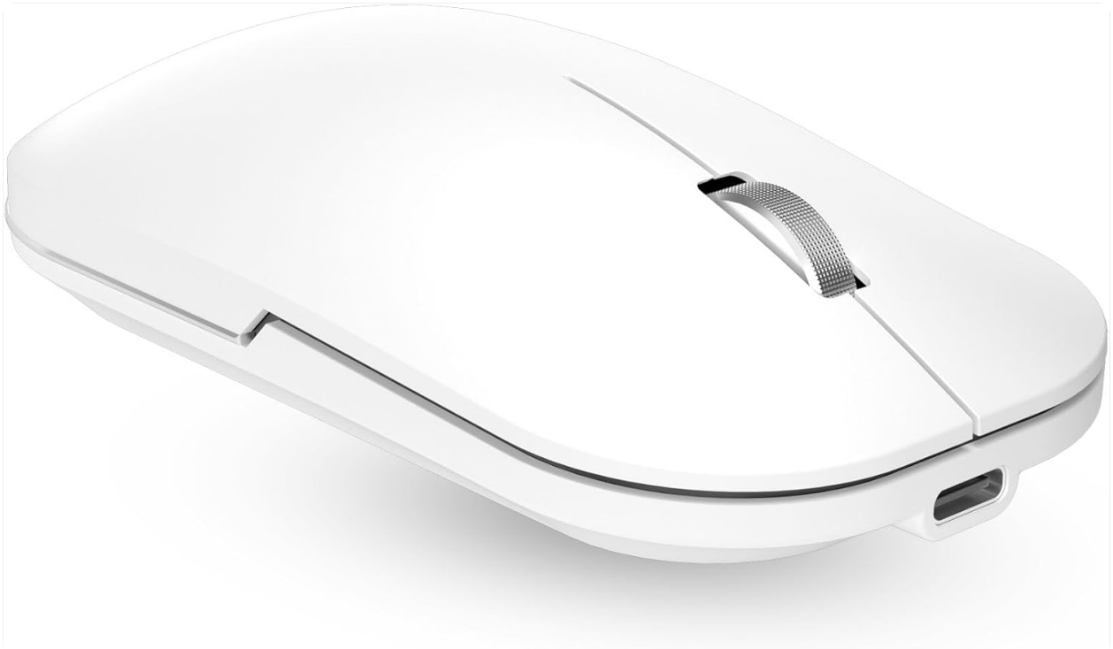
Image: The comeic Portable Dual Mode Bluetooth Wireless Mouse in white, showcasing its sleek design and metal scroll wheel.

Thank you for choosing the comeic Portable Dual Mode Bluetooth Wireless Mouse. This mouse is designed for versatility and convenience, offering both Bluetooth and 2.4G wireless connectivity. It features a durable metal scroll wheel, silent click buttons, and adjustable DPI settings for precise control. This manual provides detailed instructions for setup, operation, and maintenance to ensure optimal performance.