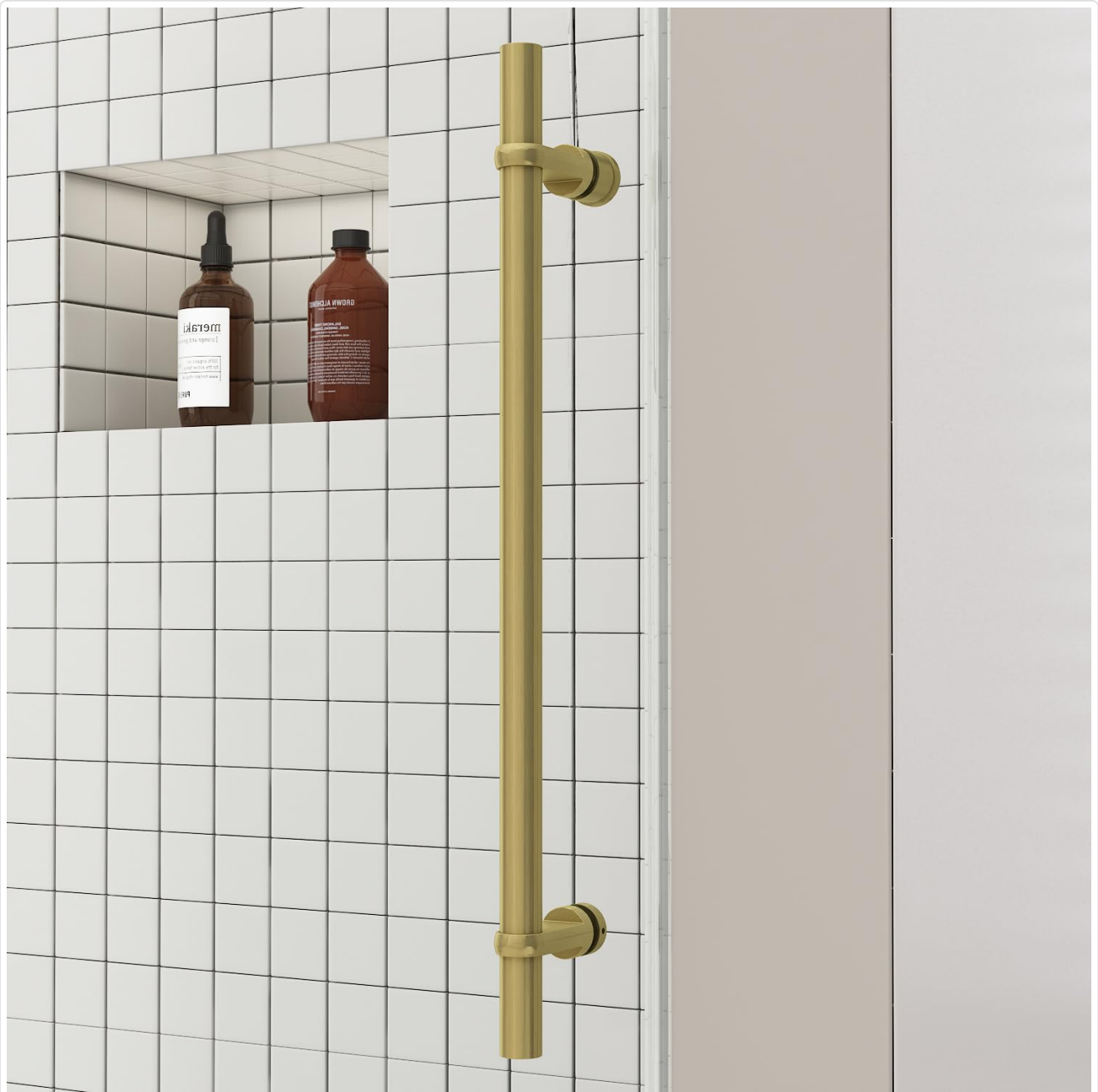
Figure 3.4: Generous Nano Coating Benefits.