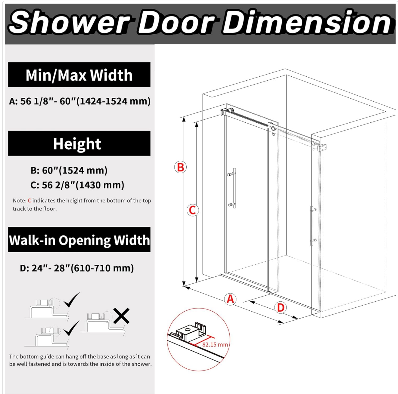
Figure 3.1: Shower Door Dimensions. Note: C indicates the height from the bottom of the top track to the floor.

The Sunrosa Frameless Double Sliding Tub Shower Door is designed for adjustable installation. Please verify your measurements before purchase and installation.