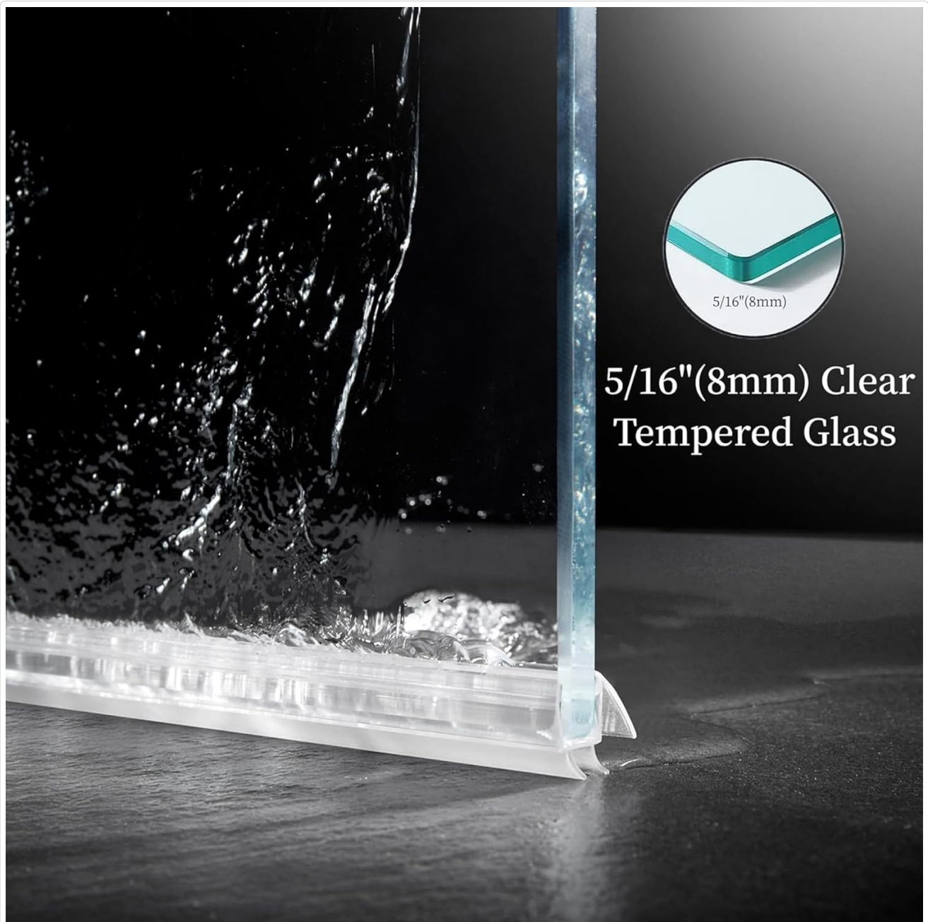
Figure 3.2: 5/16" (8mm) Clear Tempered Glass.