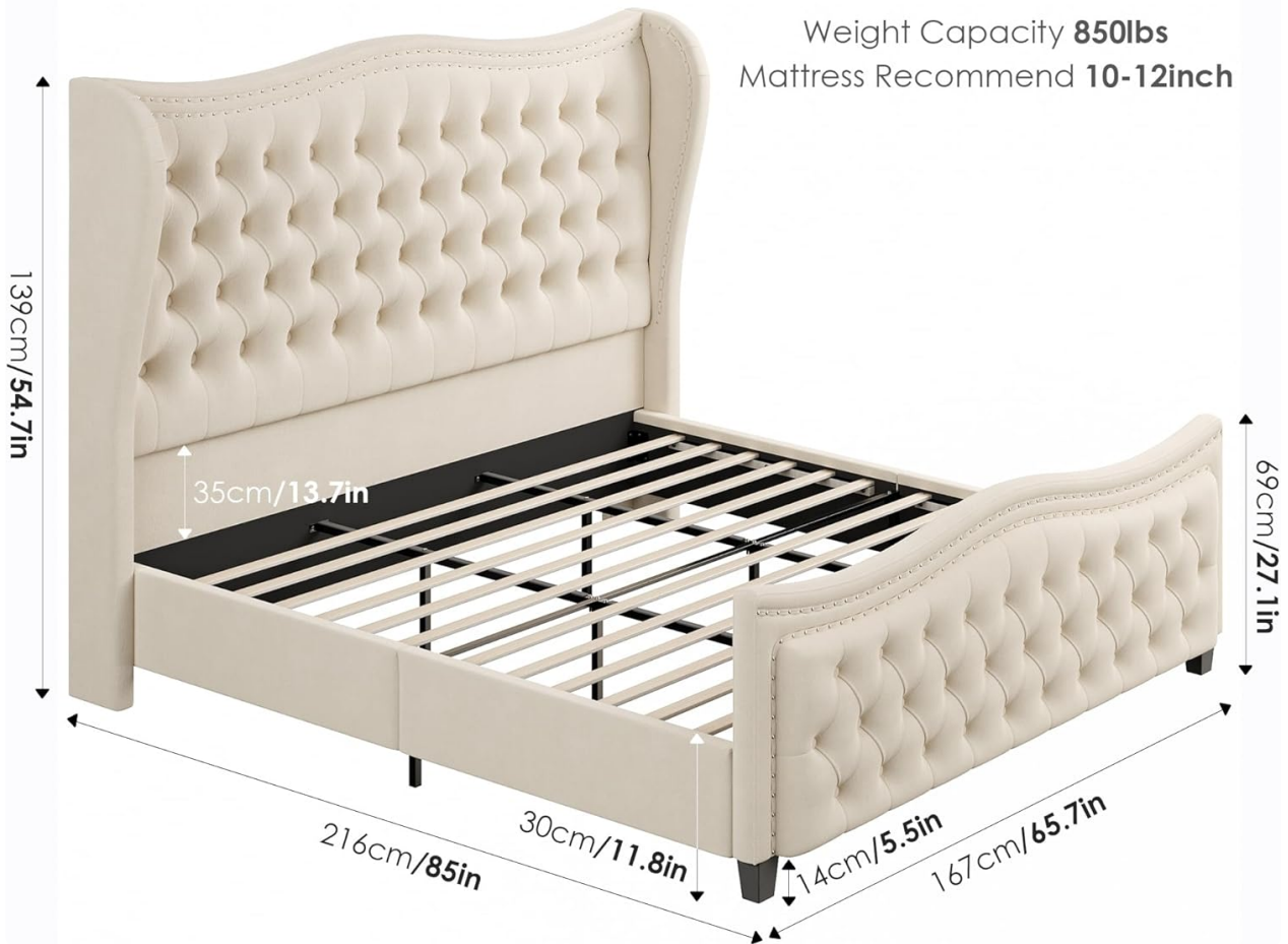
Image: Dimensional diagram of the Queen bed frame, including height, length, and width measurements.

Weight Capacity 850lbs Mattress Recommend 10-12inch