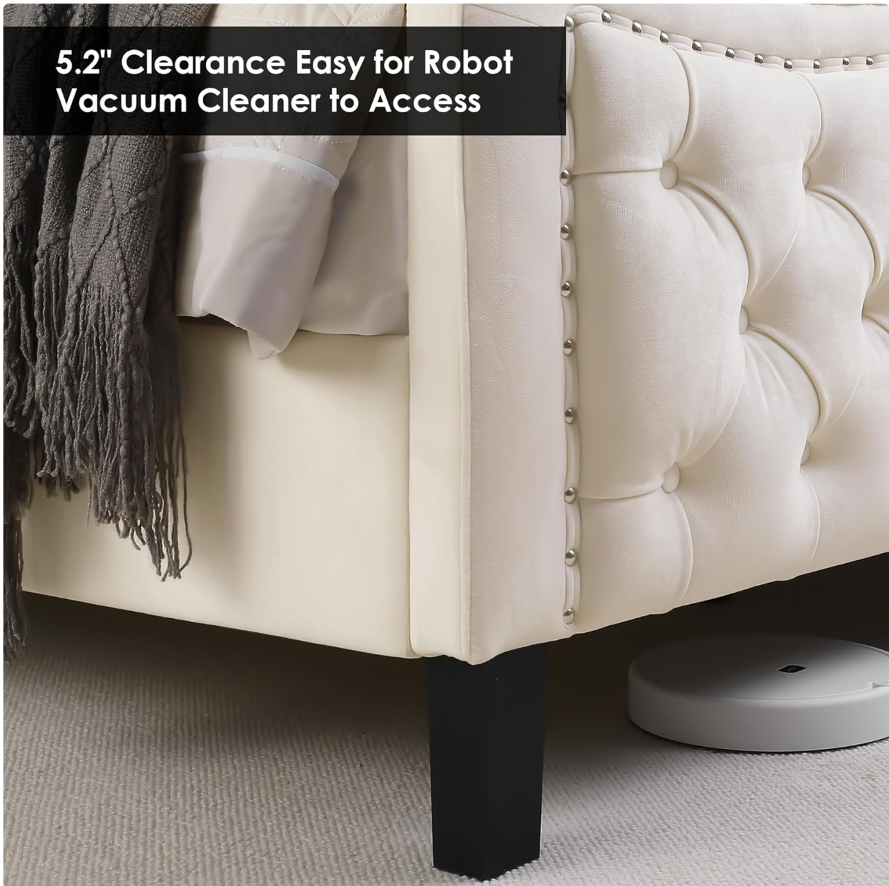
Image: The under-bed clearance, demonstrating accessibility for cleaning devices.