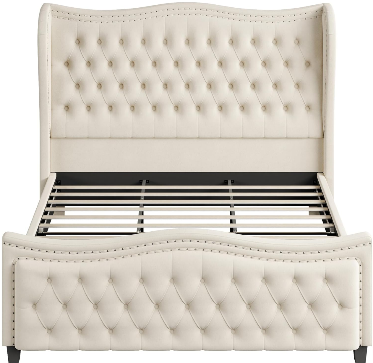
Image: The bed frame structure, illustrating the wooden slat support system and central metal legs.

For detailed, step-by-step instructions, please consult the separate assembly manual included in your packaging.