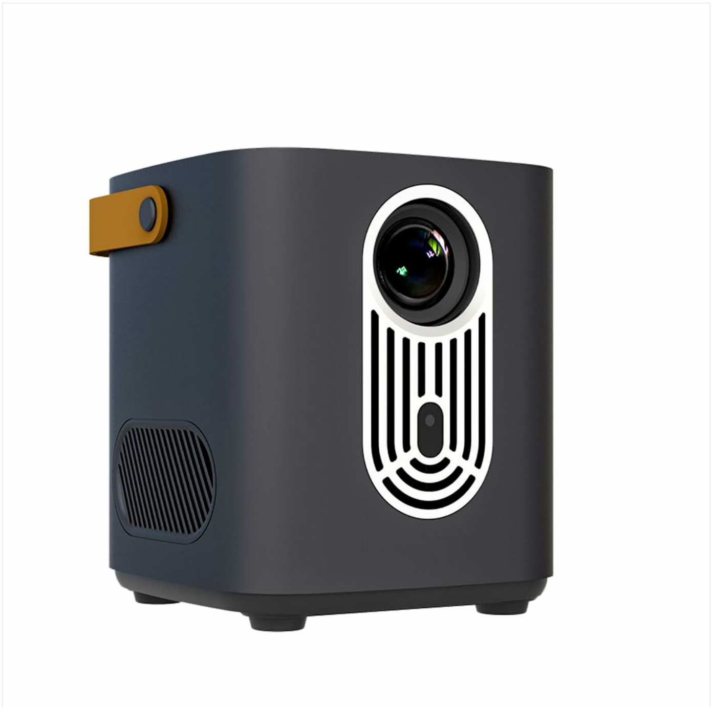
Figure 1: Front view of the Lapcare Laplay LLP-006 Projector.