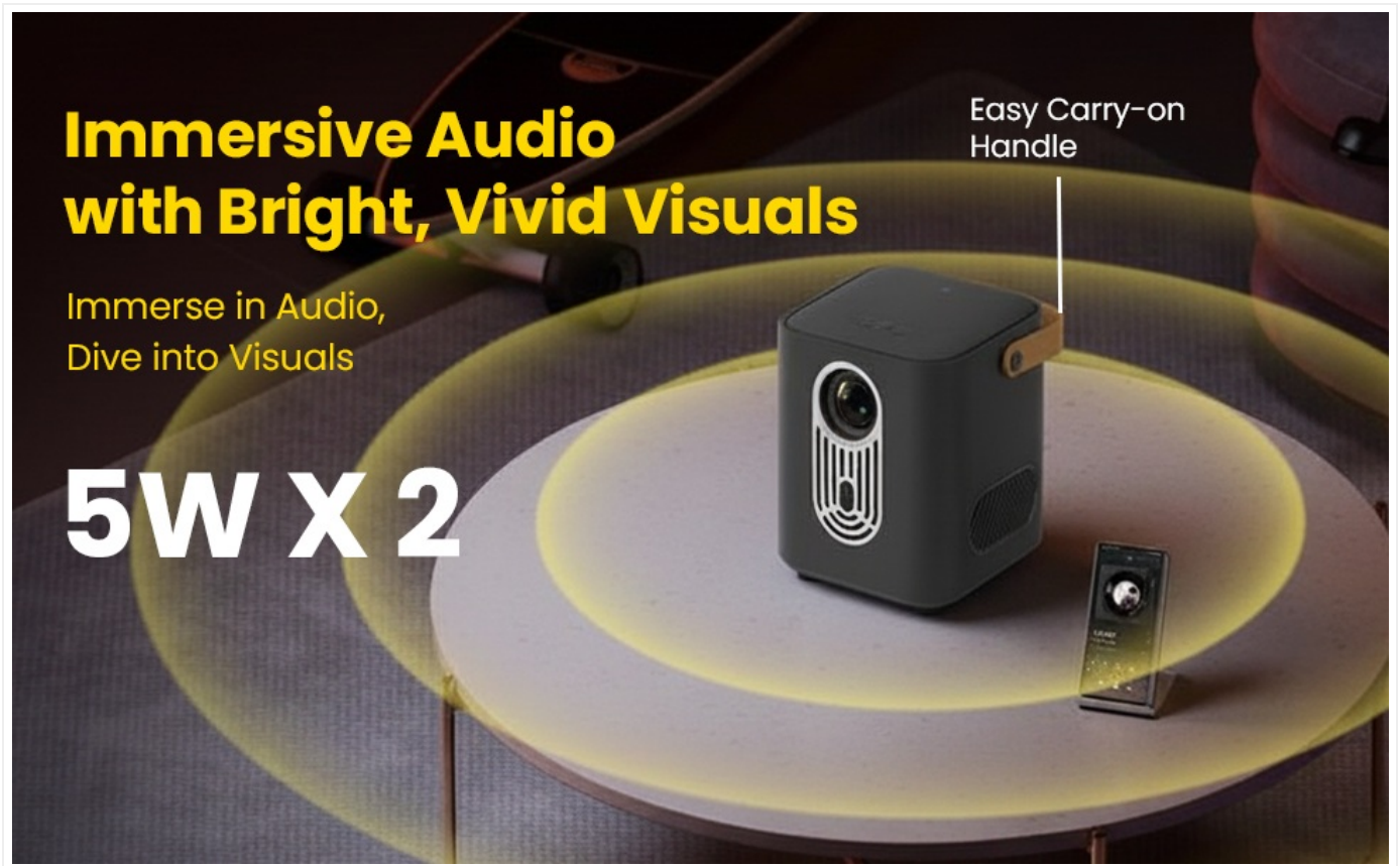
Figure 2: The projector features an easy carry-on handle for portability.