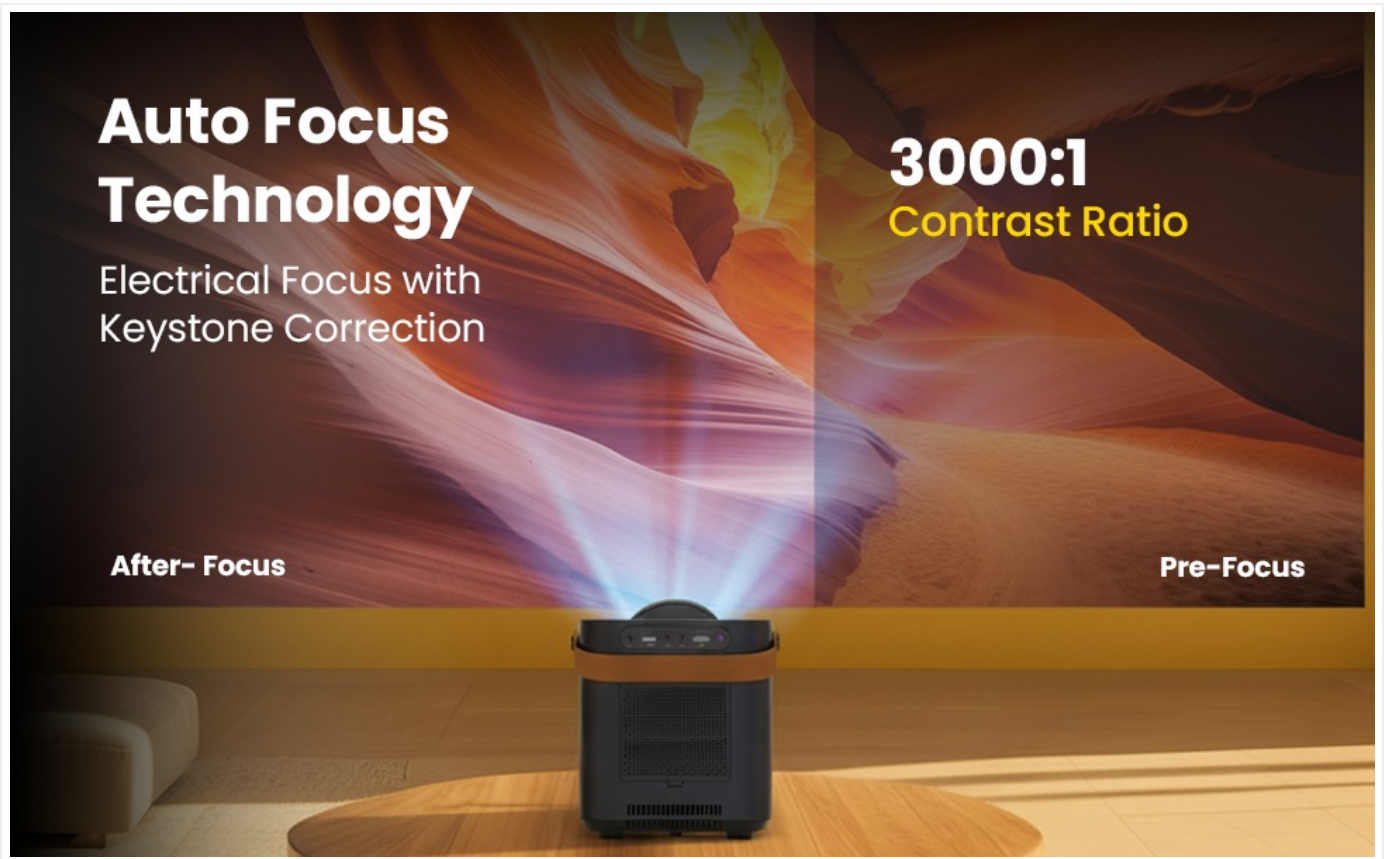
Figure 6: Auto Focus Technology ensures a clear image.