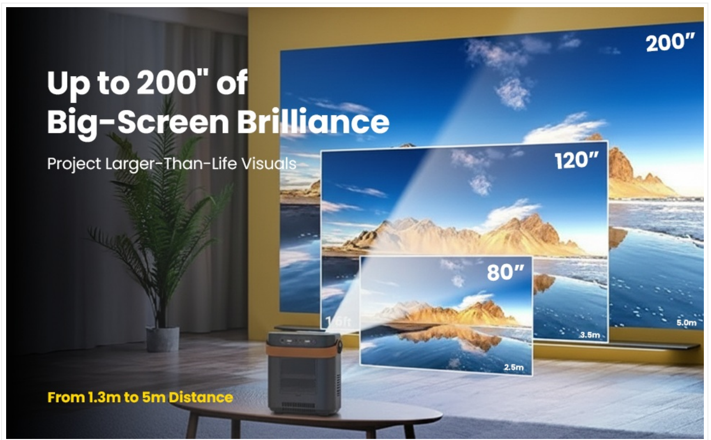
Figure 3: Projection distances and corresponding screen sizes.