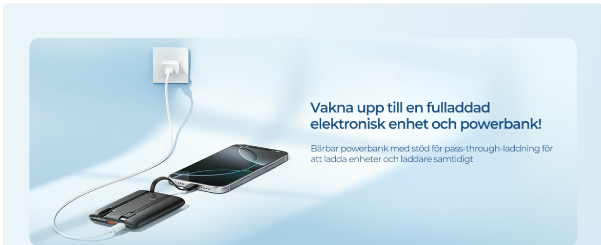
Image: Visual representation of pass-through charging, where the power bank and a connected device are charged simultaneously.

The power bank supports pass-through charging, allowing you to charge both the power bank and your connected devices at the same time. Simply connect the power bank to a wall charger while your devices are connected to the power bank.