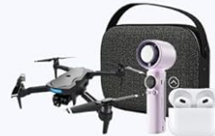
Ventilatori portatili Giubbotti riscaldanti Altoparlante Bluetooth / Drone, e altri

Image: Demonstrates the 22.5W fast charging capability, showing it's significantly faster than standard chargers.