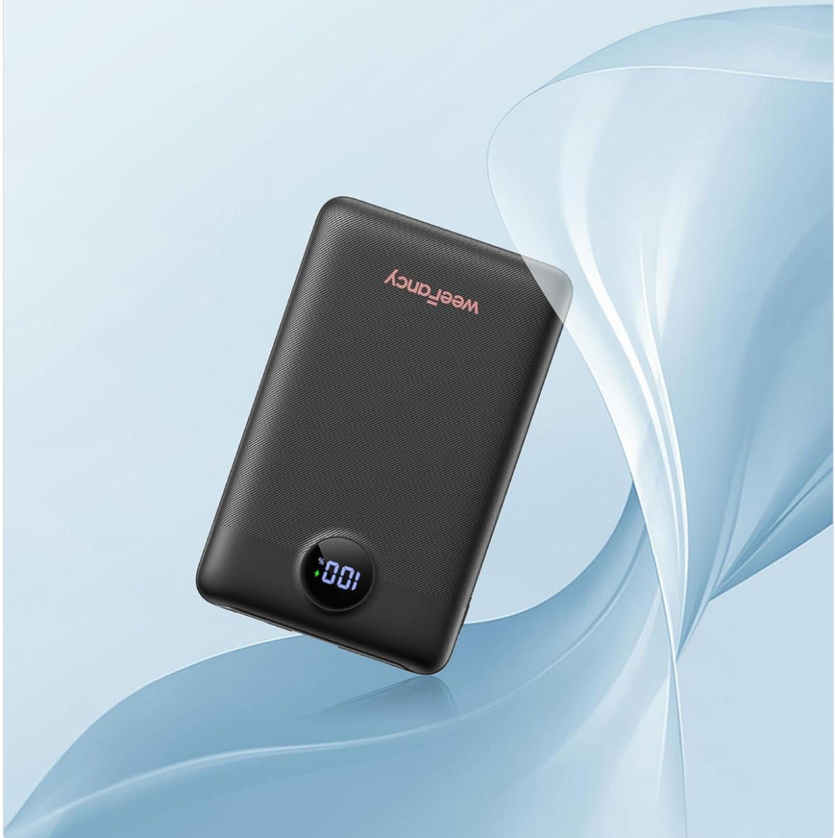
Image: The WeeFancy Mini Power Bank, highlighting its compact and lightweight design.