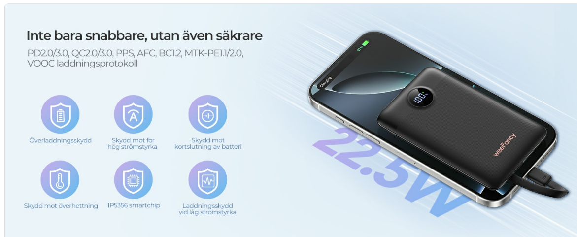
Image: Details the comprehensive safety features integrated into the power bank.