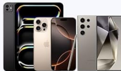
Samsung S24 / iPhone 16 / iPad, e altri