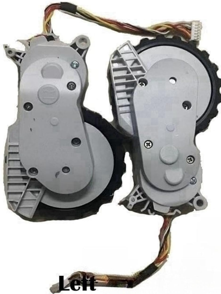
Image: Displaying both the left and right wheel replacement units, including their respective housings and wiring harnesses.