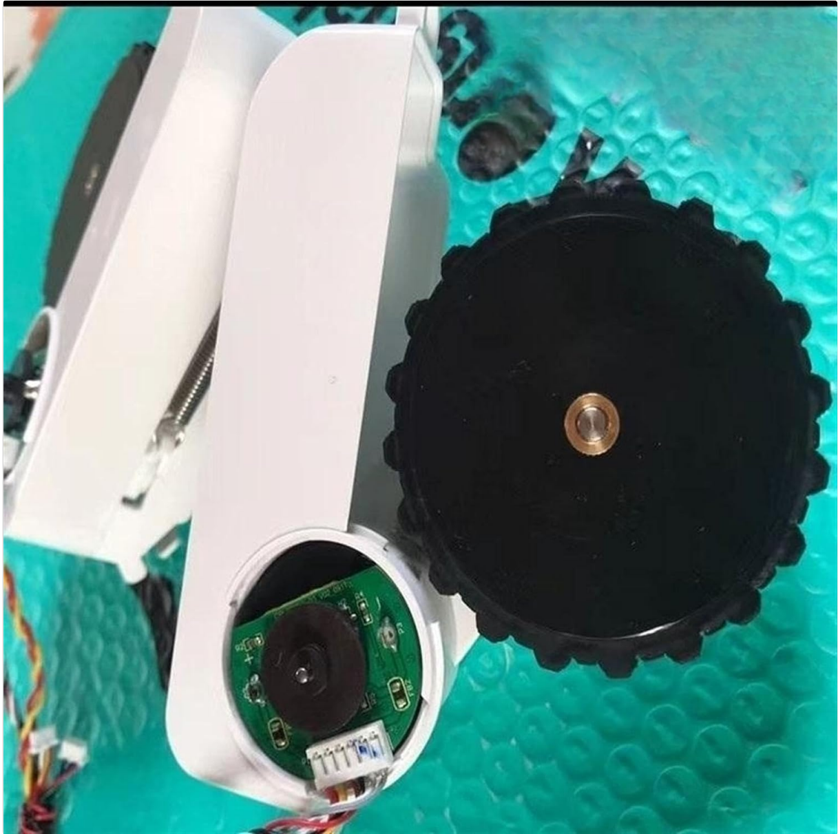
Image: Close-up view of the wheel assembly's underside, illustrating the wheel's connection point, internal gears, and circuit board.