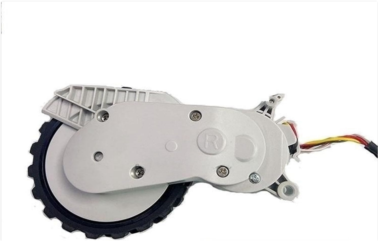
Image: Showing a single replacement wheel assembly, typically the right wheel, with its housing and electrical connector.